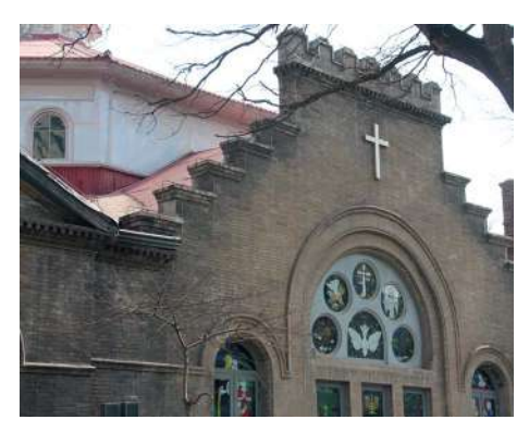
Chongwenmen Church, also known as Asbury Church, is the largest Protestant Church in existence in Beijing. The church was built in 1870 and rebuilt in 1906.