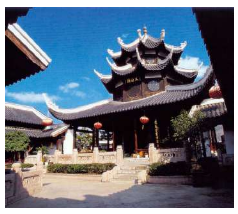
The Tower of Cultural Prosperity (Wen Chang Ge)

The projects have resulted in improved environment, better rural infrastructure, reduced soil erosion, increased income, access to convenient medical services, and confidence in future prosperity for local residents.