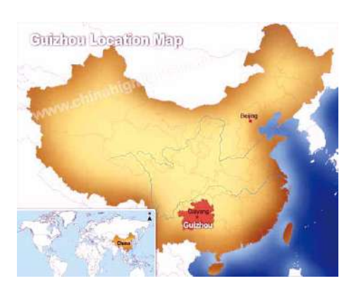
This map locates Beijing, the capital of China, Guizhou Province, and Guiyang, the capital city of Guizhou.