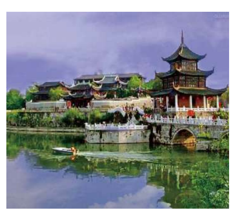
The Chamber of the Finest Elegance (Jia Xiu Lou)