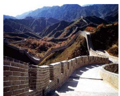
The Great Wall