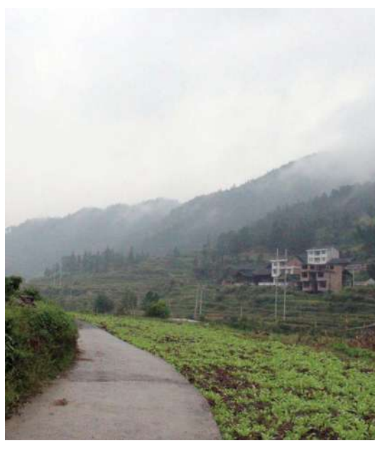
An Amity-funded village road enables villagers' access to outer world

Integrated rural development projects in Sansui County aim to improve rural infrastructure, planting conditions, living environment in the project area, and local people's, especially women's, capacity of community-based self-management. The projects also lead to increase of income, ecological balance and sustainable development for local residents.