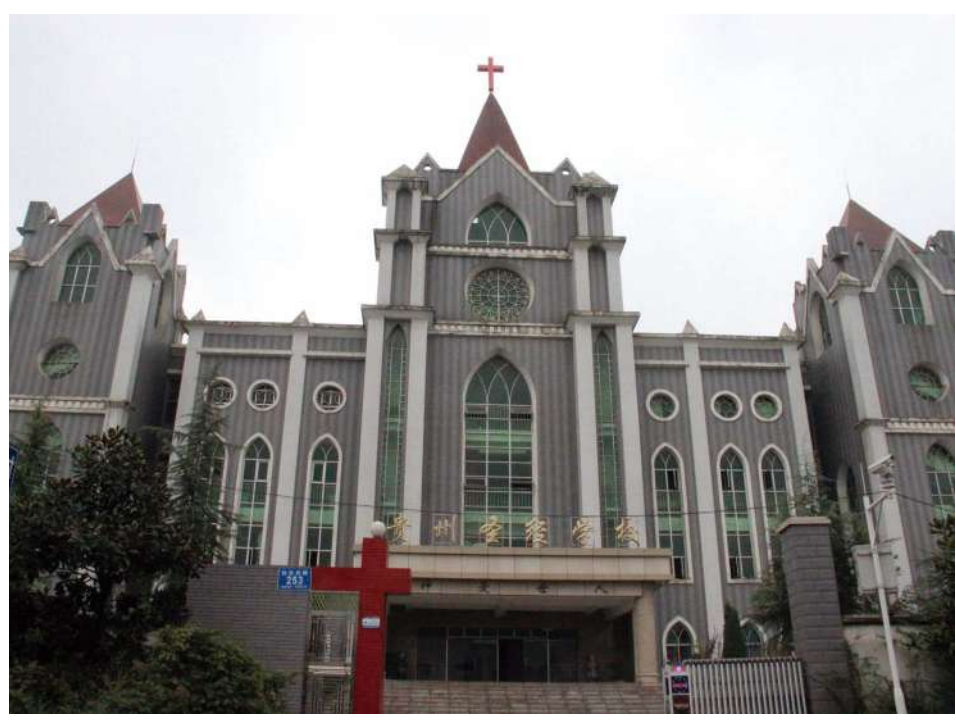
Guizhou Bible School

Established in 1993, Guizhou Bible School is the base for theological education in Guizhou. Most of the students are from ethnic minority groups. The majority Han Chinese only account for 15% while 50% of the students are from Miao, 30% from Yi, and 5% from other ethnic groups.