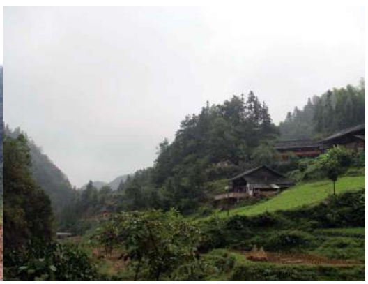
Wooden house dwellers now have access to tap water enabled by Amity-funded drinking water project in Sansui County