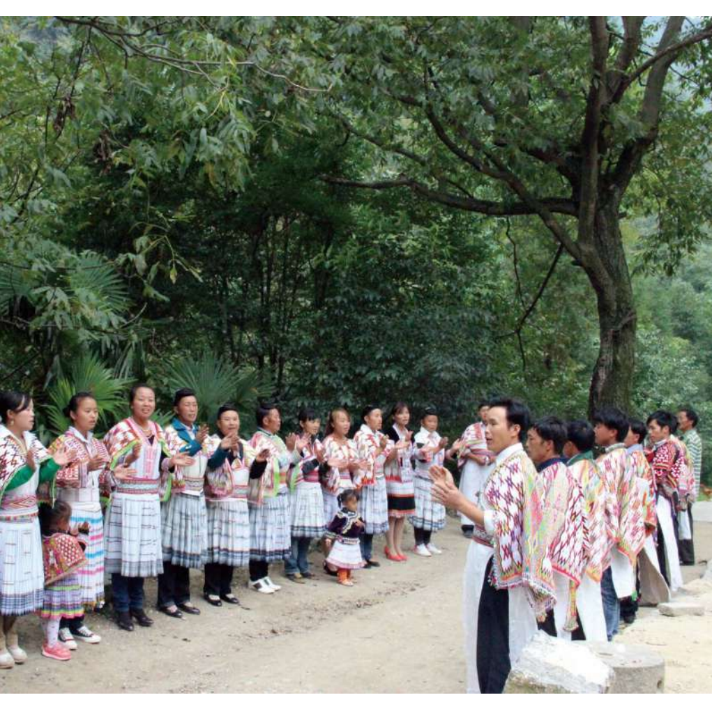
Miao Christians singing songs to welcome guests visiting Xianma Church

In the late 19th century, the Gospel was brought to Guizhou. Missionaries came to Puding County, establishing churches,