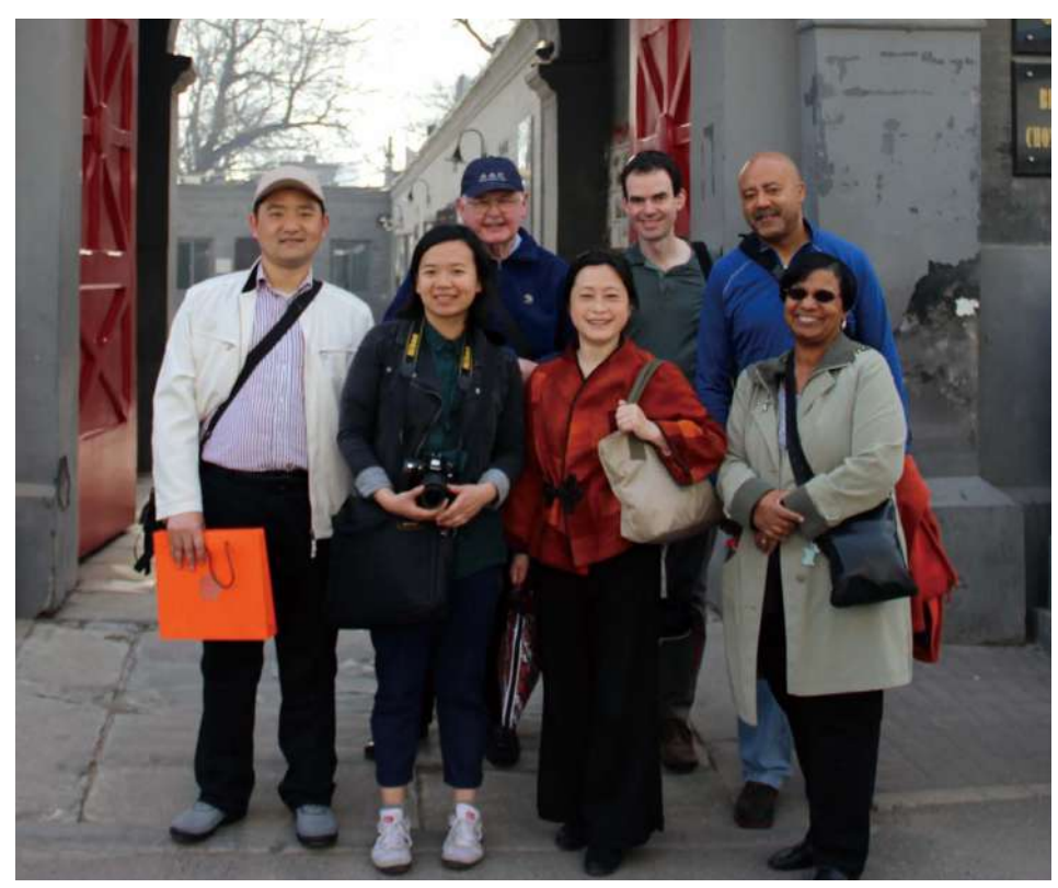
A group picture of the tour team at the gate of Chongwenmen Church in Beijing

Visiting the church is no doubt a highlight of the tour. In Beijing, on a bright sunny spring day, we visited Chongwenmen Church in Beijing. Built in 1870, with the Methodist tradition, Chongwenmen Church was the very first church established in Beijing and even the whole of North China. The main building of the church that has survived the wars and chaos in