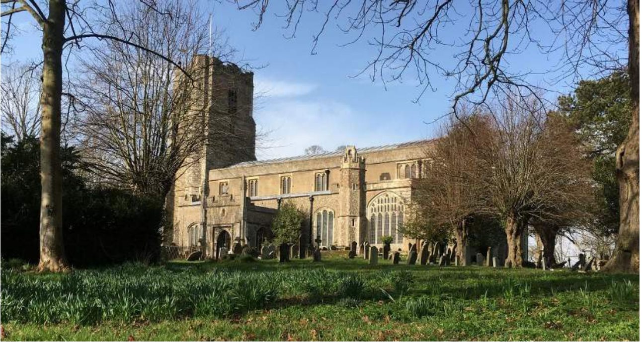
▲ Snowdrops in the breeze during her walk for Living Water

→ A special Walk for Amity's Living Water challenge