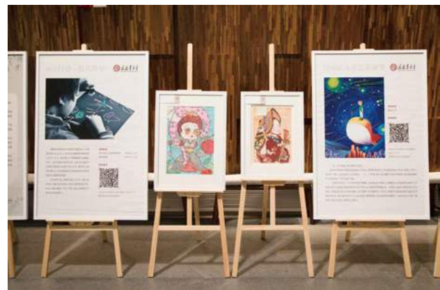
▲ The exhibition exposes Amity's art-related projects