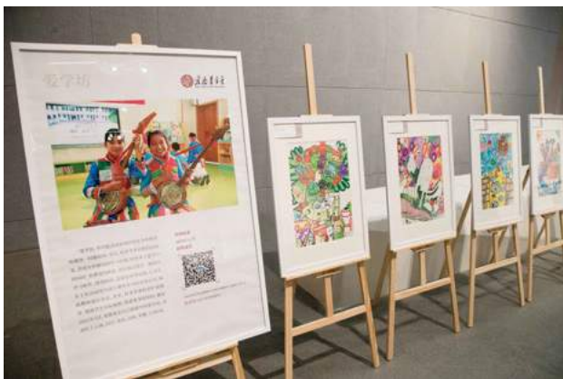
▲ Childrens' paintings from Amity's ethnic minority projects are displayed