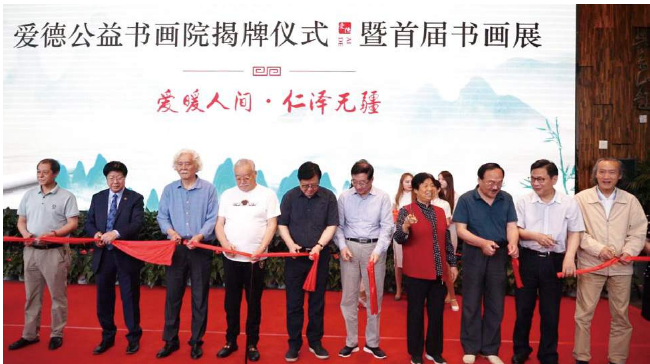
▲ Guests of honor officially launch the Amity Charity Calligraphy and Painting Institute

At present, the Amity Charity Calligraphy and Painting Institute has calligraphers and painters from nine Chinese provinces. In the future, the Institute hopes to attract more artists from all over the country, organize overseas non-governmental exchanges and further promote Chinese traditional art and combine it with Amity's social development projects.