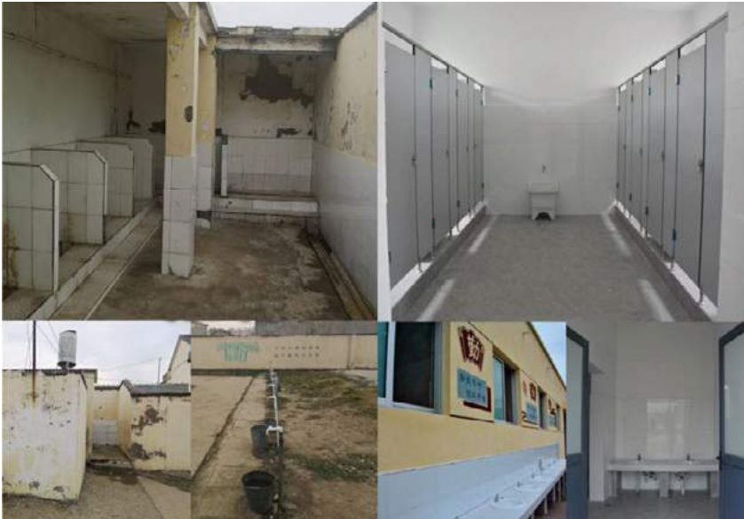
◀ The old toilets and washing facilities (on the left) were replaced with modern toilets and hand basins (on the right) that ensure hygienic modern standards

The ceremony was attended by local officials, Amity representatives and volunteers of tesa enterprise. In order to support the development of good hygiene habits, the volunteers gave training sessions at the school and reminded the kids about the importance of personal hygiene habits and awareness.