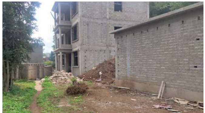
▲ In 2020, Amity Foundation supported Desheng Kindergarten to build a three-story canteen, which can accommodate more than 100 children to eat in the canteen at the same time