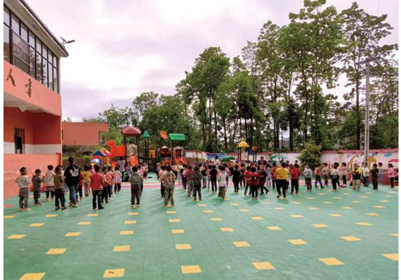
▲ New playground