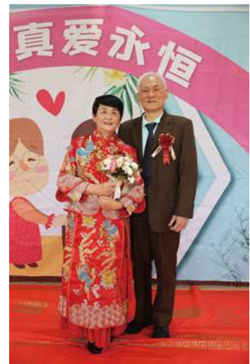
▲ The wedding picture of the couple, 42 years later