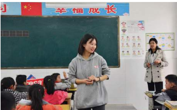
▲ Volunteers of tesa company teach the students about hygiene

Amity's program enhances general health awareness and education among children in rural areas and rebuilds and renovates sanitation facilities, which include modern toilets, hand basins, toilets, and septic tanks.