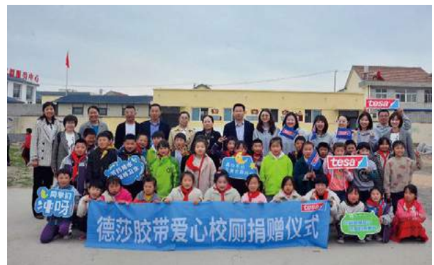
▲ Group photo of the participants of the inauguration ceremony in front of the newly built sanitation facility