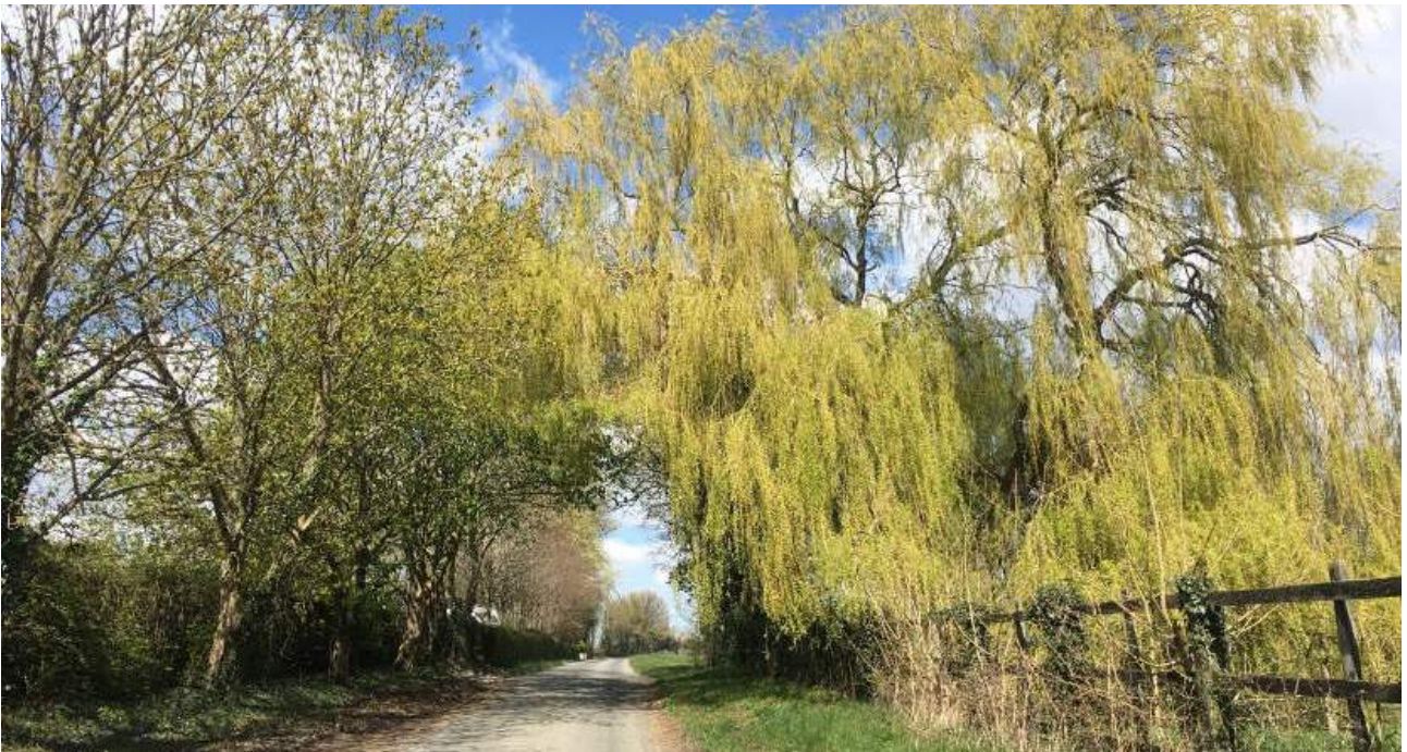
▲ Country road takes me home