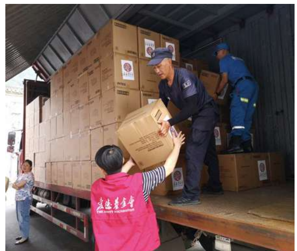
▲ Amity's staff was distributing materials in She County