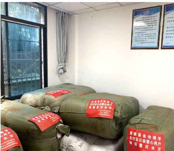
▲ Amity's aid materials reached the disaster-affected areas timely

Since July 7, Amity Foundation has distributed 1,500 blankets and 1,500 sheets in Sanjiang Street, Qijiang District, Chongqing.