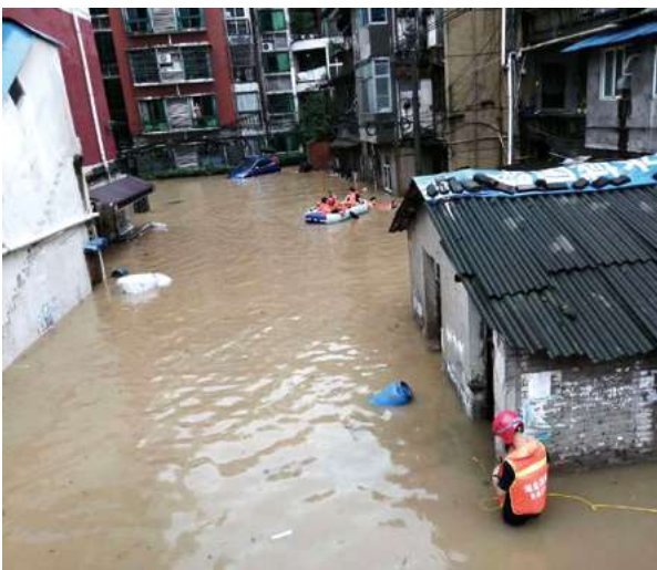
▲ Rooms soaked in water

On July 15, Amity Foundation distributed 600 sets of sanitary supplies and other relief materials to Wufeng Tujia Autonomous County in Hubei.