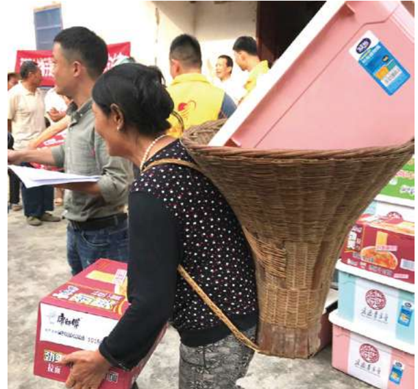
▲ Local people received Amity's supplies