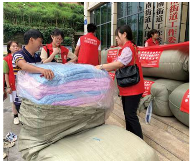
▲ Amity's local partners were coordinating the distribution of materials