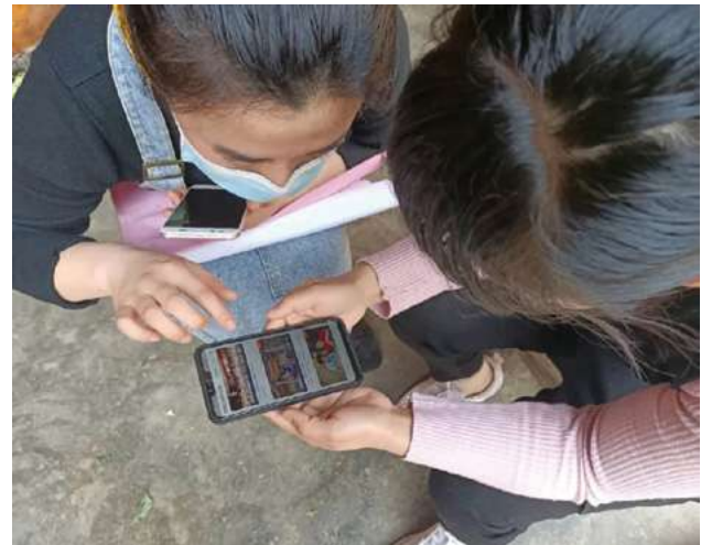
▲ Home visiting of Amity Sprouts on Earth Project in Cengong County, Guizhou Province in March 2020

A fter seeing the two pictures, you may ask: “What? Are they teaching the beneficiaries to play with mobile phones?”