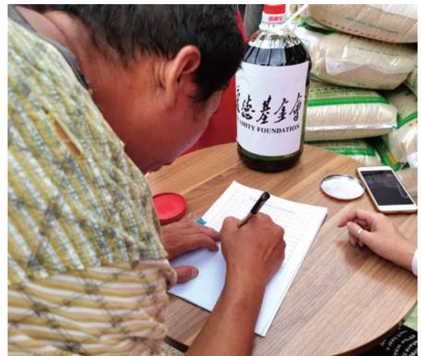
▲ Local people were signing names on the supplies receiving forms