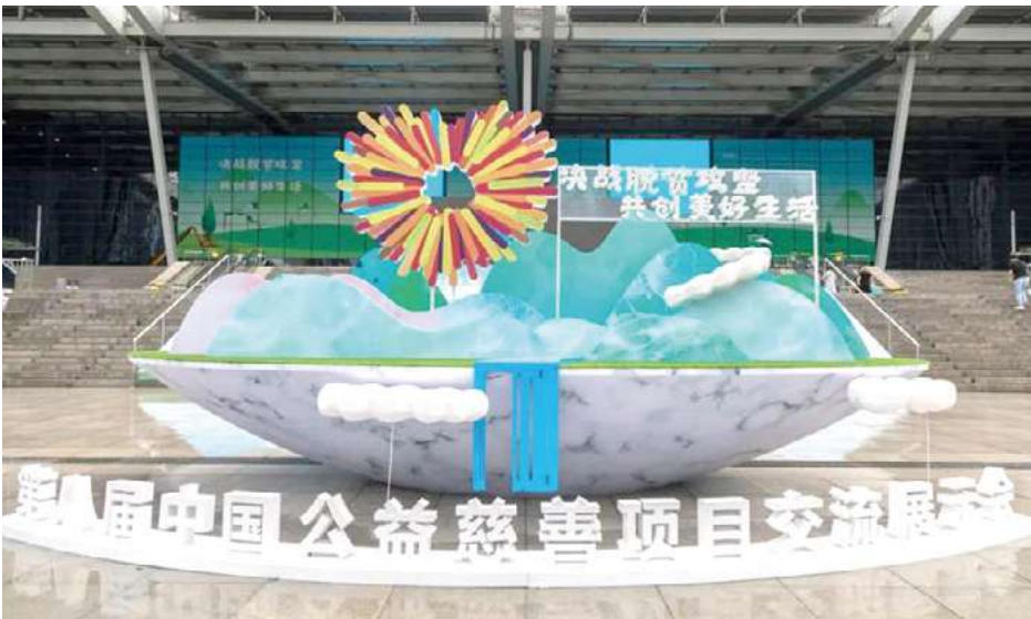
◀ The 8th China Charity Fair