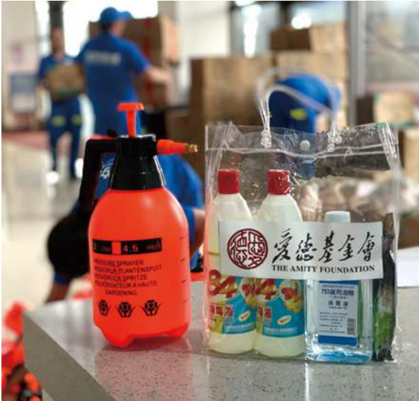
▲ The disinfection supplies provided by Amity provided a strong guarantee for local personal and environmental hygiene