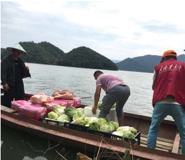
▲ A few days ago, the bridge leading to the outside world in Henghe Village, Jiangxi Province, was destroyed by floods. Villagers could not leave the village and could only eat preserved rice and pickles. After local need assessment, Amity Foundation started to ship about 115 kilograms of pork and 250 kilograms of vegetables to the village every day since July 18. Villagers welcomed the action enthusiastically