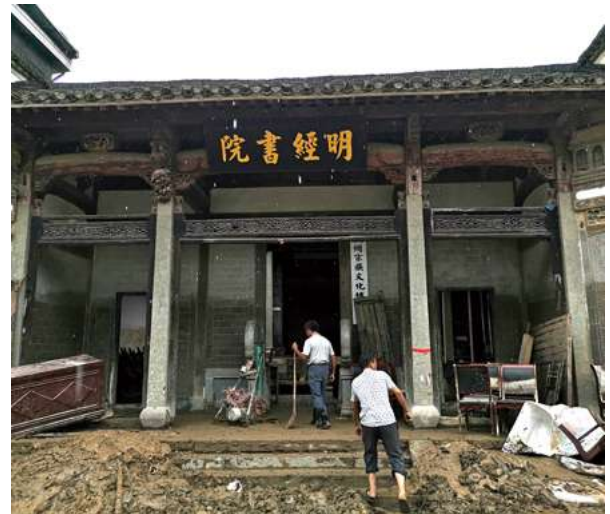
▲ The heavy rain in the past few days caused severe damage to the old buildings in some villages and seriously affected local people's daily lives.