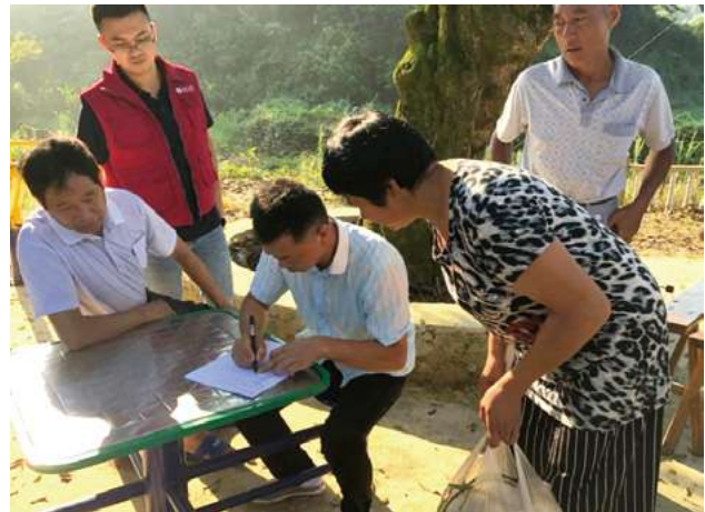
▲ The villagers were signing their names upon receiving supplies