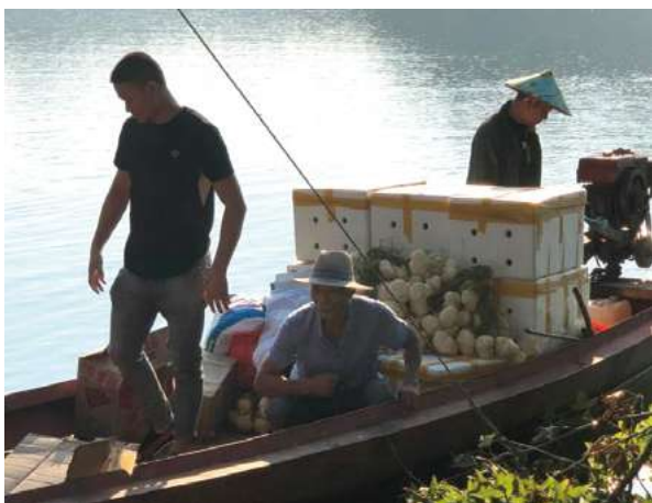
▲ Villagers were transporting relief supplies with a boat