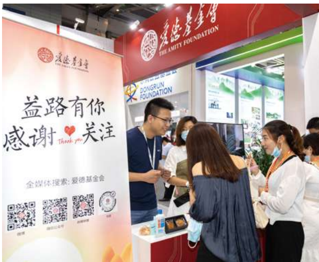
▲ Many guests came to Amity's booth to consult