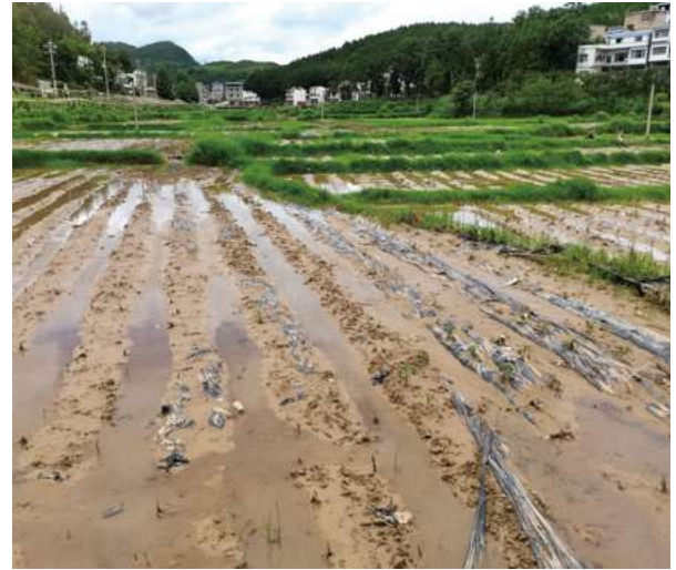
▲ The flood destroyed the farmlands and houses