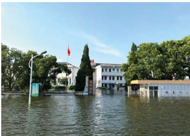
▲ A school in the water in Poyang County