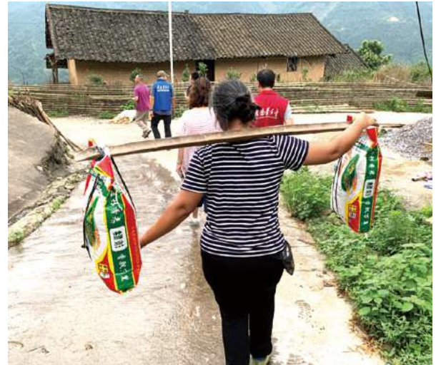
▲ Amity's supplies' timely arrival provided emergency support to the local people and eased their urgent need