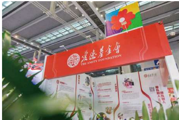
▲ The booth of the Amity Foundation

Amity Foundation and Guangzhou Amity Philanthropy Development Center participated in the exhibition.