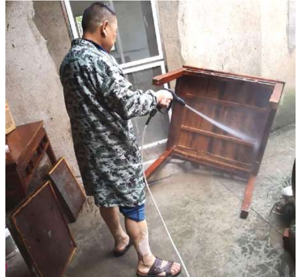
▲ Amity's high-pressure water cannons has dramatically increased the speed of local post-disaster dredging work and earned local people's praises