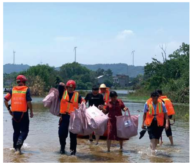
▲ The local firemen were delivering charity supplies to the victims