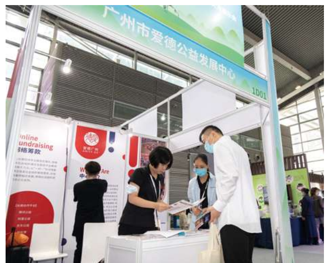
▲ The booth of Guangzhou Amity Philanthropy Development Center