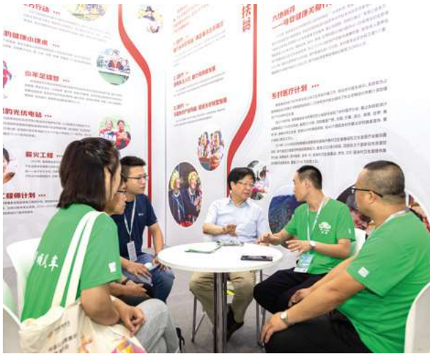
▲ Many guests came to Amity's booth to consult