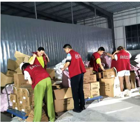
▲ Amity local partners and volunteers were sorting Amity's supplies

Since July 10, Amity Foundation has successively distributed daily necessities including 26,800 kilograms of rice, 425 moisture-proof mats, 425 bottles of toilet water, 425 sulfur soaps, 2550 transparent soaps, 425 blankets, 2,680 barrels of edible oil, 425 mosquito nets, 86,400 bottles of drinking water, and 1,825 kilograms of fresh food to Poyang and Duchang County in Jiangxi Province.