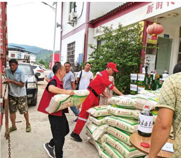
▲ Amity staff was coordinating the distribution of materials