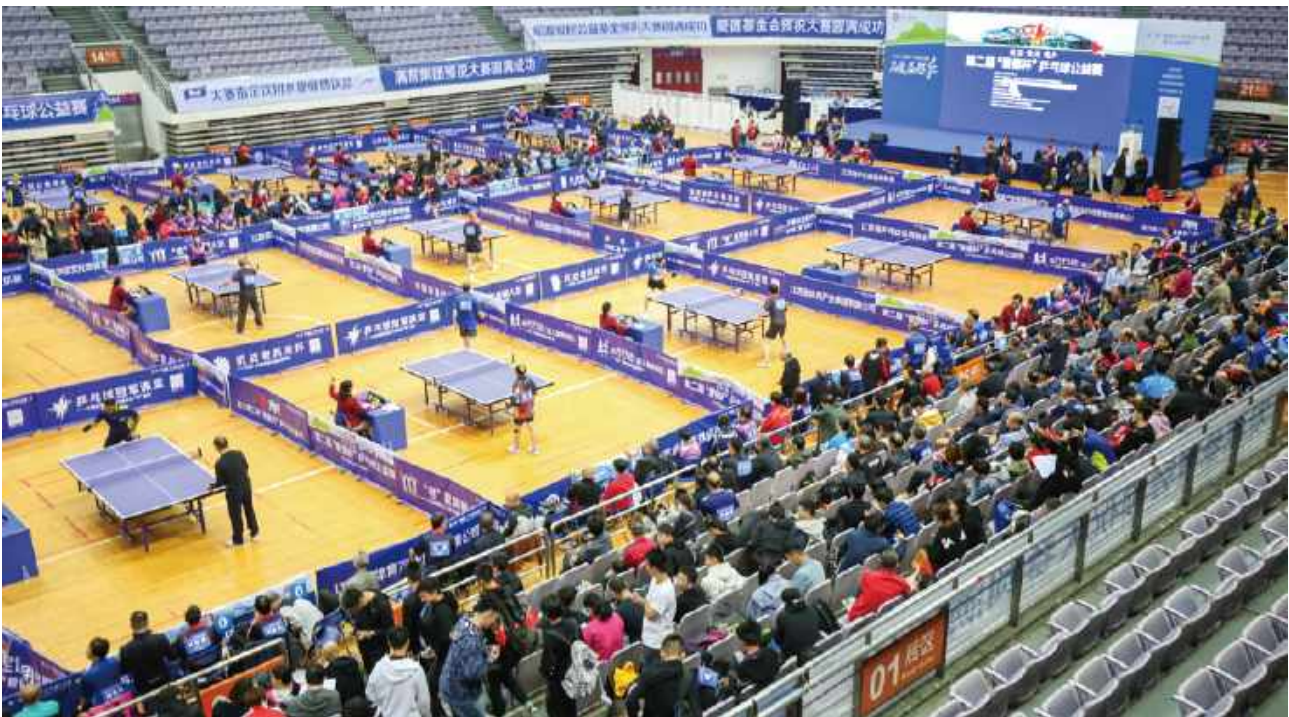
▲ About 700 participants attended the second Amity Cup Table Tennis Game

From October 19 to 20, the Amity Foundation organized the second Amity Cup Table Tennis Game in Nanjing. Located at the Nanjing Olympic Sports Stadium, the event was supported by Jiangsu Table Tennis Association as well as local businesses. It combines sports for public health awareness with charity activities to encourage the public to pay attention and to participate in philanthropy. Proceeds of the event will be used for Amity's projects, supporting orphans, rural children, mentally challenged people and elderly.