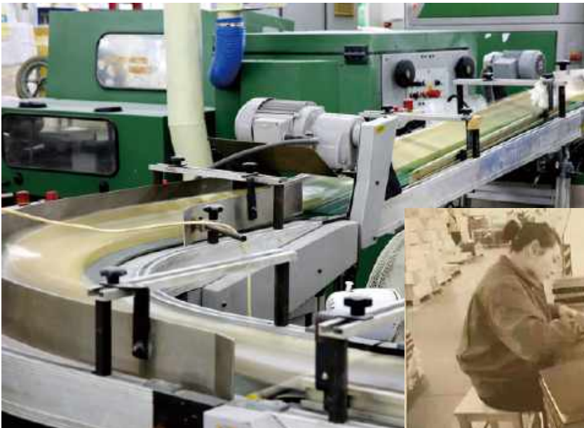
▲ Bibles under production

Amity Printing Ltd. has printed 200 million copies in more than 130 languages, including 85.48 million for the Chinese church. The other 114.52 million Bibles were printed for 147 countries around the world, accounting for 58% of the total copies. Moreover, Amity Printing registered two branches in Ethiopia and Kenya.