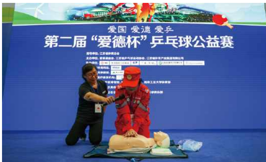
▲ Raising awareness for CPR among the attendees

During the event, there were also CPR exposure and demonstrations to raise awareness and capacity for first aid among the public.