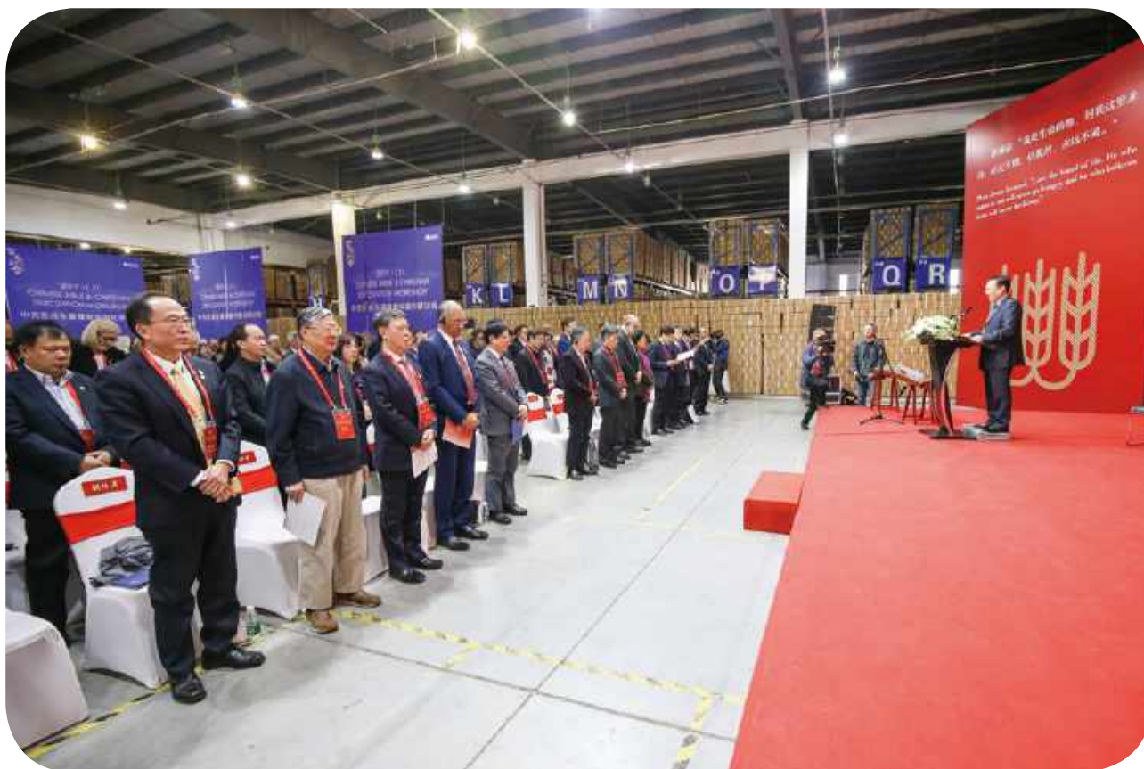
▲ Morning Devotion

In the morning, after a Morning Devotion and a Bible Exhibition, a workshop on the theme of Chinese Bible and Sinicization of Christianity was held in the warehouse of Amity Printing factory.