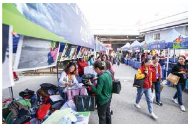
▲ Winter clothing donation

During the event, there were also CPR exposure and demonstrations to raise awareness and capacity for first aid among the public.