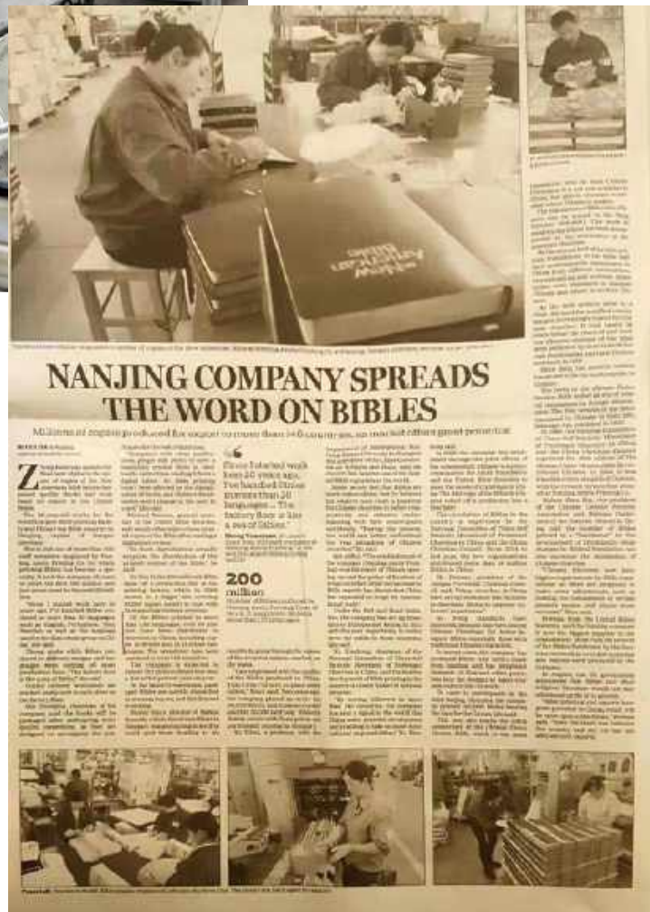
▲ News report by China Daily, a national mainstream media of China