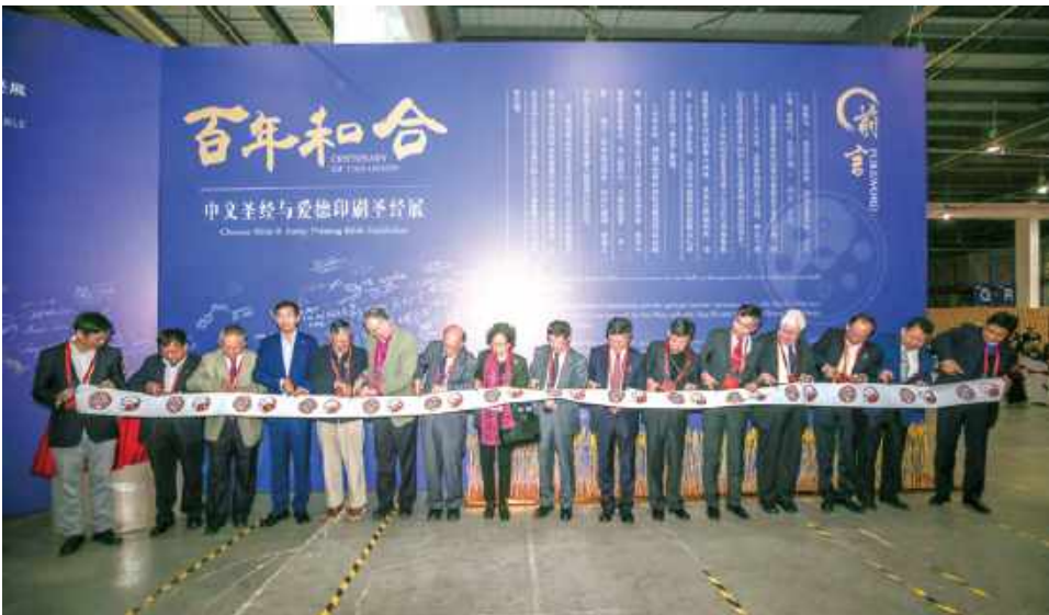
◀ Honorary guests opening the Chinese Bible & Amity Printing Bible Exhibition with a ribbon cutting ceremony

The celebrations also included the Bible exhibition and a workshop on the theme of Chinese Bible and Christian Sinicization. In the exhibition more than 300 Bibles, including Catholic translations from the late Ming Dynasty and many extraordinary Bibles printed by the Amity Printing Company were displayed.