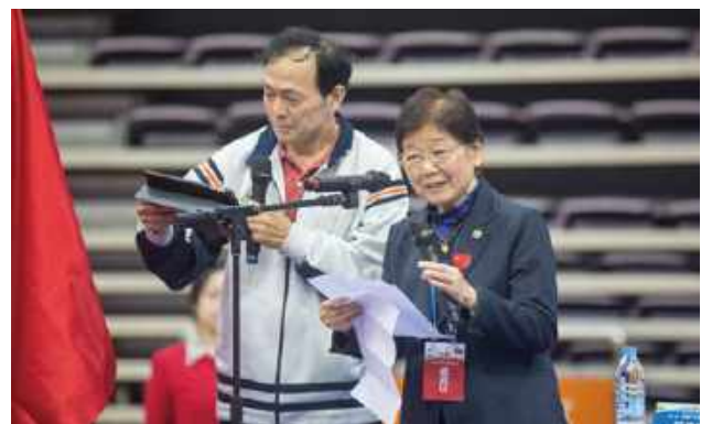
▲ Speech by the Chinese and Japanese friendship ambassador and former Japanese table tennis champion Kimiyo Matsuzaki

From October 19 to 20, the Amity Foundation organized the second Amity Cup Table Tennis Game in Nanjing. Located at the Nanjing Olympic Sports Stadium, the event was supported by Jiangsu Table Tennis Association as well as local businesses. It combines sports for public health awareness with charity activities to encourage the public to pay attention and to participate in philanthropy. Proceeds of the event will be used for Amity's projects, supporting orphans, rural children, mentally challenged people and elderly.