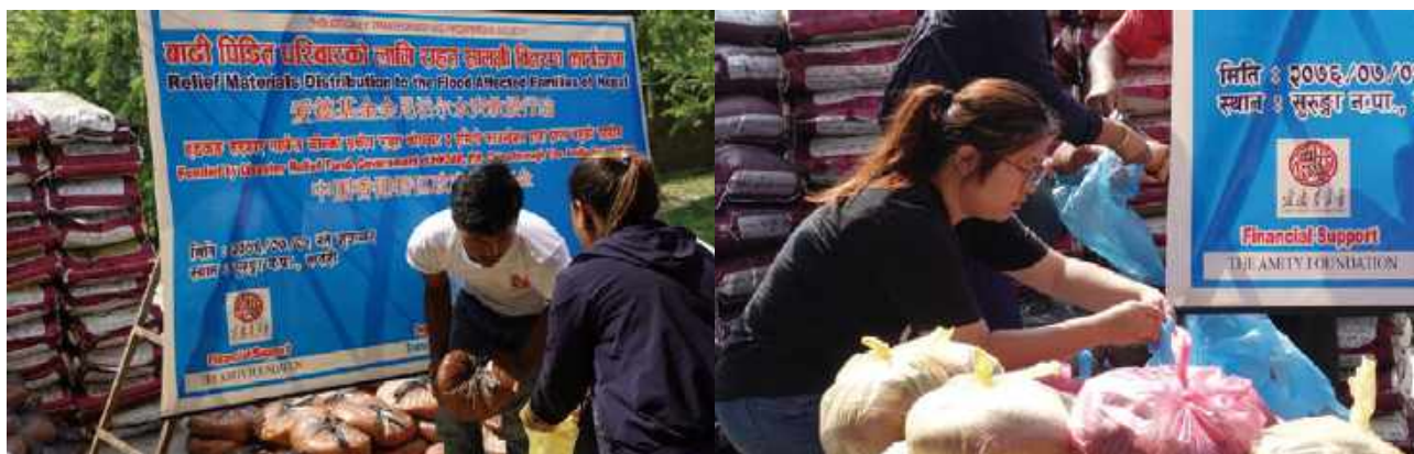
▲ Amity staff and local volunteers preparing relief packages for distribution