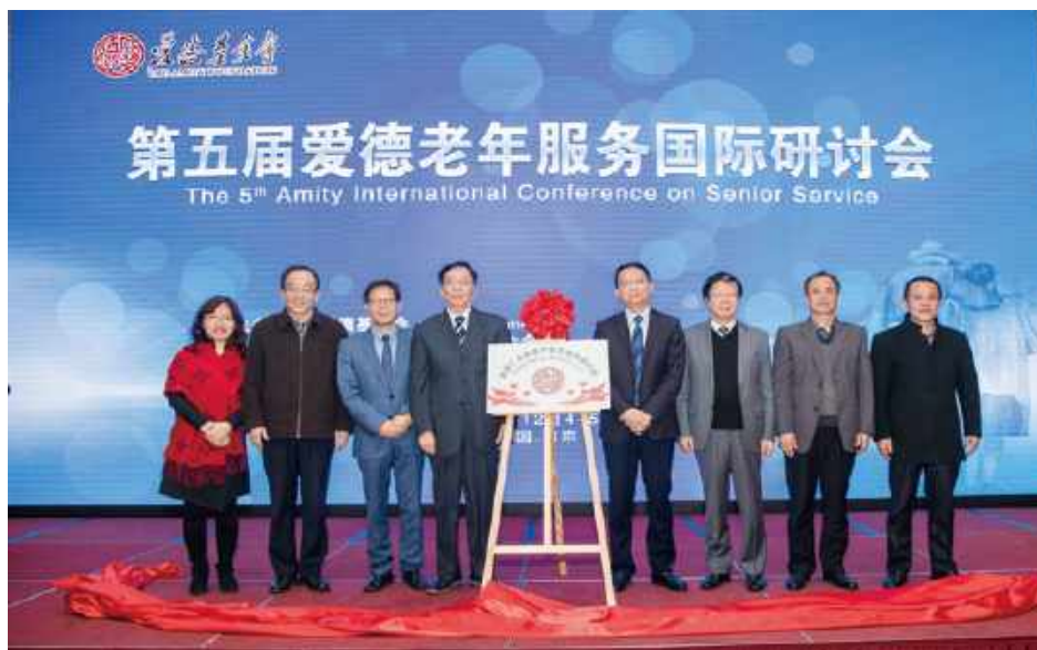
▲ During the conference participants unveiled the plaque of the newly founded Amity Rengu Elderly Care Industry Development Co., Ltd., which will help to improve Amity's service provision