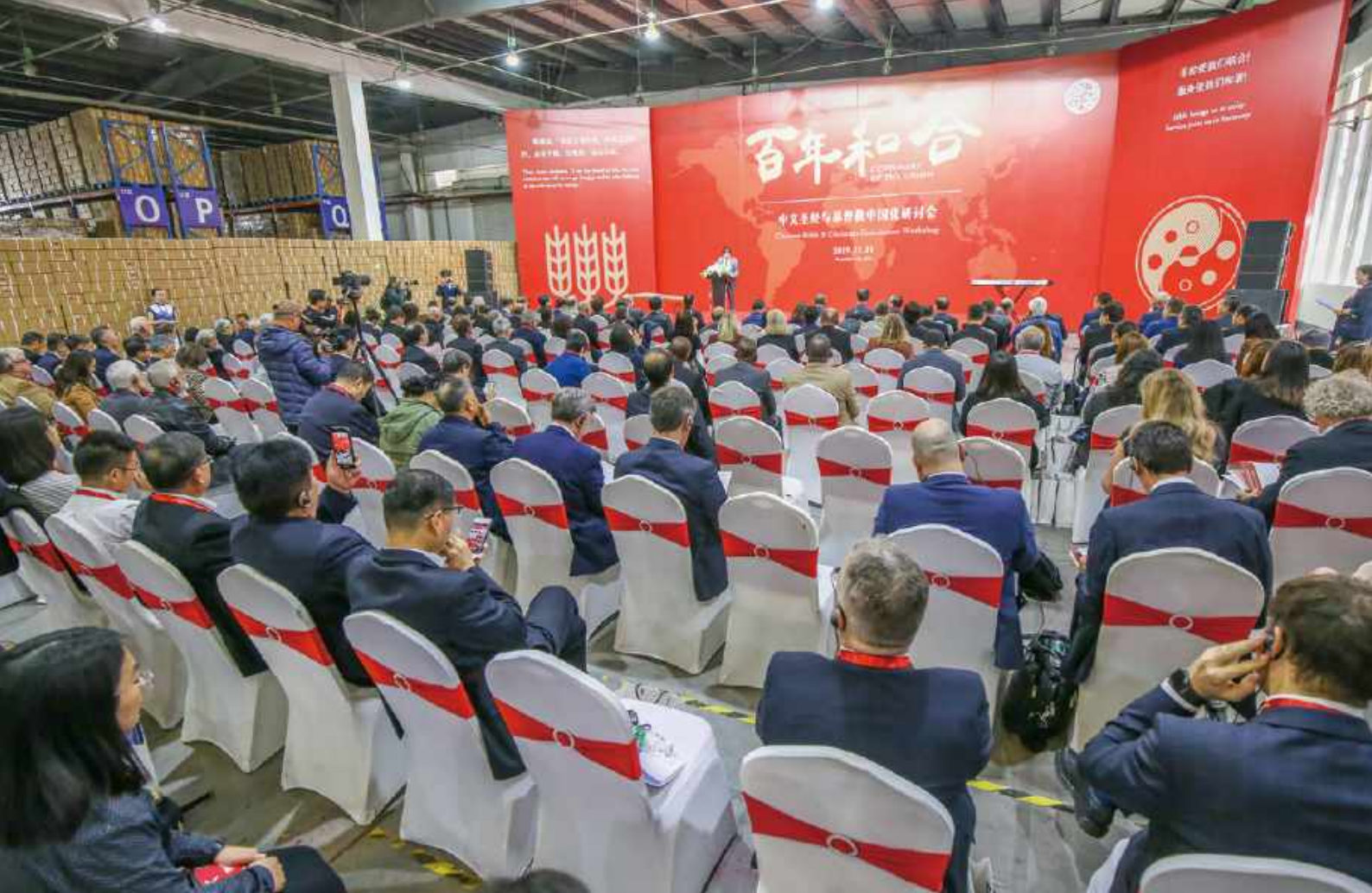
◆ The events took place in the warehouse of the Amity Printing Factory