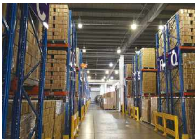
▲ Bibles stored in the Amity Printing storage halls

The first part exhibited the Catholic Bibles, which mainly included important Catholic translations from the end of the Ming Dynasty. The second part was the Christian Bible Exhibition. By centering on the birth of the Chinese Union Version (CUV) Bible, this part displayed important Chinese Bible translations since Christianity re-entered China in the 19th century, and some major Bible products of Amity Printing since its founding. The exhibition served as a testimony to the development of the Chinese Bible and its significant value for the sinicization of Christianity.