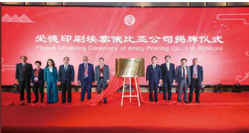
A plaque unveiling ceremony ► of the Amity Printing Ethiopian company took place.