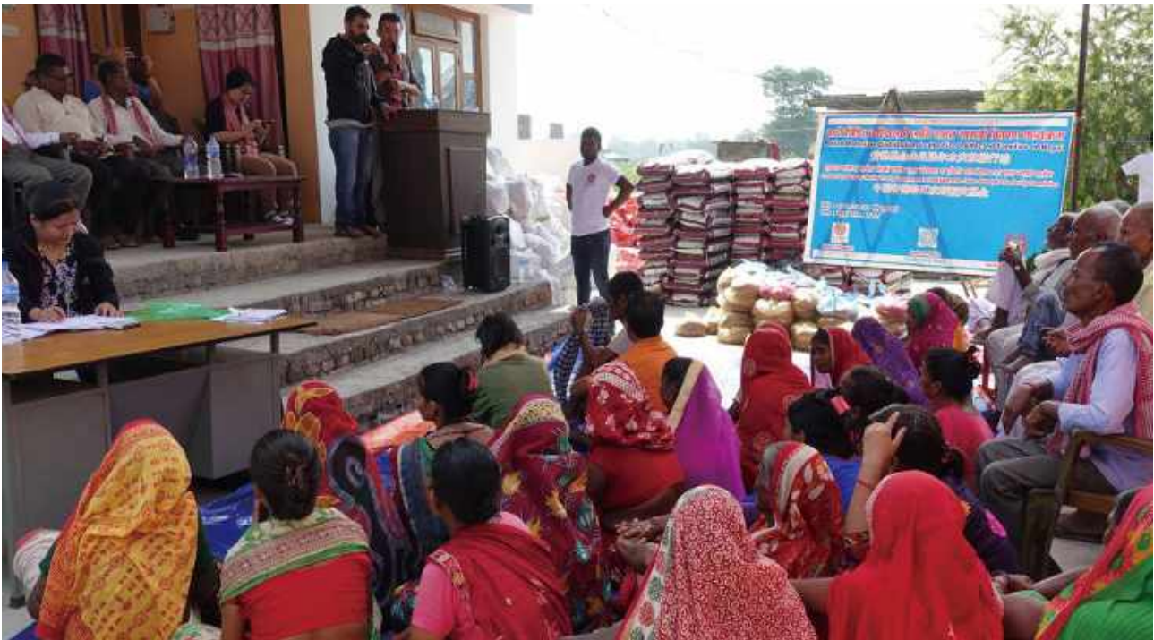
▲ Villagers are waiting for the distribution of relief supplies to start

Over the past months, the Amity Foundation provided disaster relief supplies to approximately 19,400 people in Nepal affected by the floods earlier this year. Amity worked with the long-term local partner organizations Transformation Nepal and Transform Nepal distributed in total 97000 Kg of rice, 15520 kg of lentils, 7760 pieces of tarpaulins, 3880 solar lights, 3880 hygiene kits, including soaps for washing and bathing, towels, toothpaste, toothbrushes, sanitary pads, chlorine liquid, and mosquito nets. About 3880 families in 5 municipalities benefited from the disaster relief emergency project.