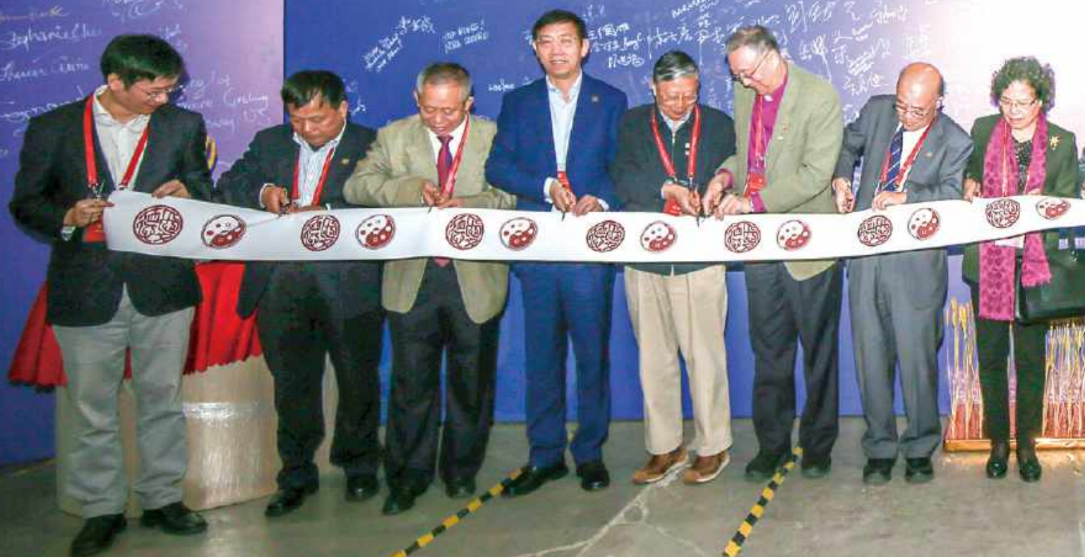
▲ Honorary guests opening the Chinese Bible & Amity Printing Bible Exhibition with a ribbon cutting ceremony

Chinese Bible & Amity Printing Bible Exhibition