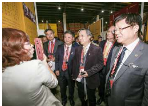
▲ Gao Feng, the President of the Chinese Christian Council (CCC) and Xu Xiaohong, chairman of the National Committee of the Three-Self Patriotic Movement (TSPM) viewing the over 300 Bible exhibits