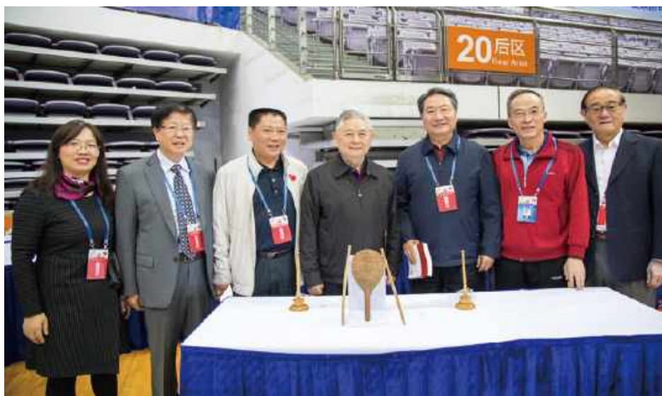
▲ Unveiling of table tennis relics