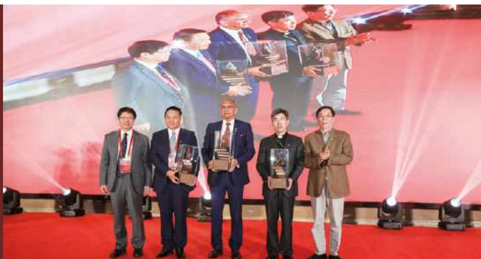
► Special gratitude awards