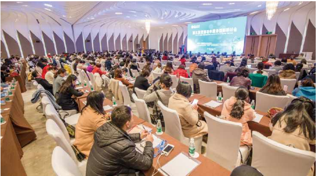
▲ 5th International Conference on Senior Service

On 4 th and 5 th of December, Amity organized “The 5 th Amity International Conference on Senior Service” in Nanjing, Jiangsu Province. The conference, co-organized by the Shenzhen Aging Development Foundation, attracted almost 400 professionals from the sector and related government departments. Speakers came from Mainland China, Taiwan, Hong Kong, USA and Japan.