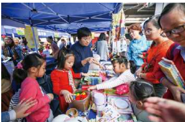
▲ Charity market outside the Olympic Stadium

In addition to corporate social responsibility, this year's event also emphasized public awareness on philanthropic concepts. By advocating for public donations, Amity organized a Charity Market outside the venue. Besides 62 booths selling second-hand goods and organic food, Amity also set up a platform receiving winter clothing suitable for primary school students, which will bring warmth to the children in poverty-stricken areas.