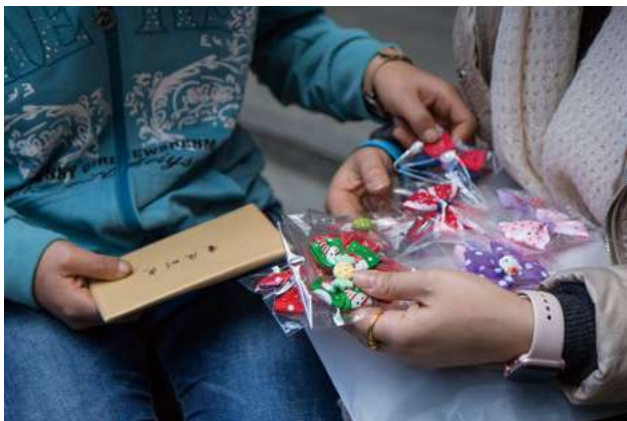
△ Handmade hair ornaments