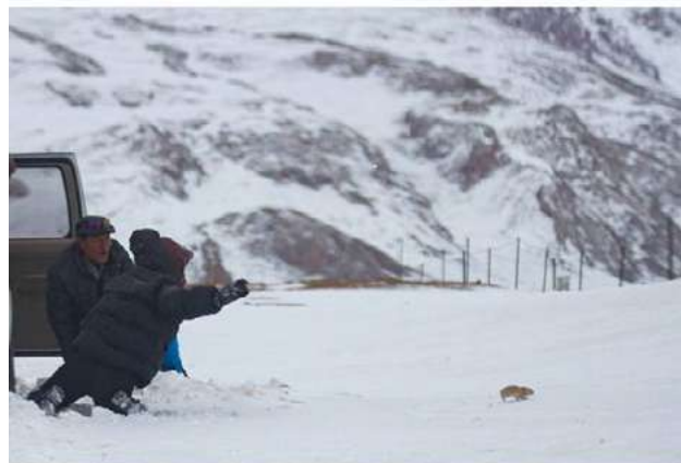
△ Volunteers helping a mountain pika