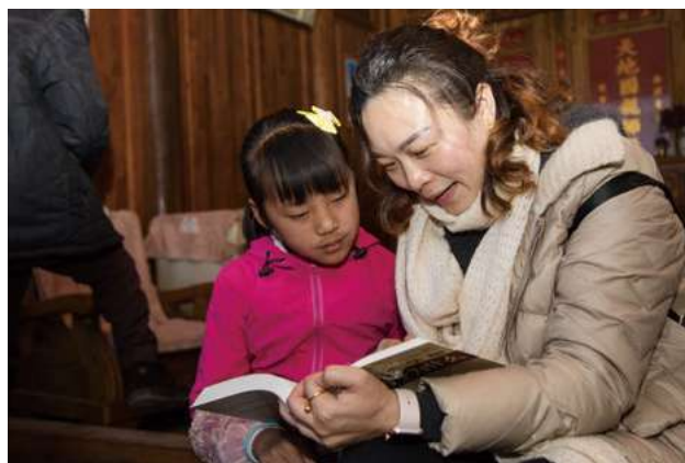
△ This kid is a little shy. Telling a story is a good start of relation