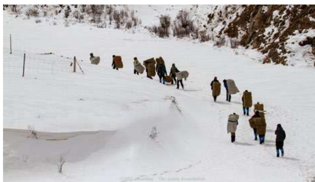
△ Delivering foraging grass to families on foot

The herdsmen wanted to give back to the land that had raised them, and Amity was there to assist the local villagers in coping with the challenges. Amity brought social awareness and took on great efforts towards disaster relief and fundraising. Amity hopes the 18 days' effort would promote greater awareness of the area to the outside world. As Jane Goodall once said: Only if we understand, can we care. Only if we care, will we help. Only if we help, shall they be saved”.