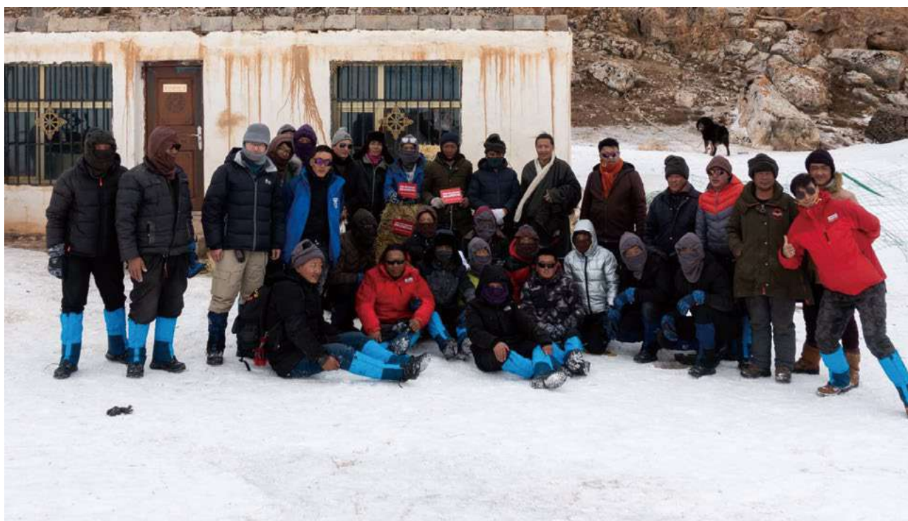
△ Local partners and volunteers with Amity staff

“They are superheroes!” exclaimed Junsong and Yazhou.