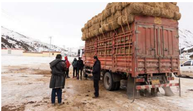
△ Loading foraging grass