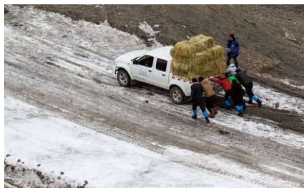
△ Moving forward by pushing the pickup in poor road conditions

Throughout the entire trip, Amity staff, local partners, and volunteers helped each other to overcome the challenges. Even though some volunteers' own communities were influenced by the storm, they still insisted on helping with the relief. “And we also have ‘iron women’. These respectable female volunteers, though less strong, also carried 20kg of foraging grass and walked 10km each day.”