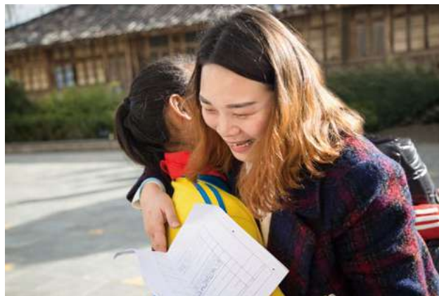
△ A hug represents a lot