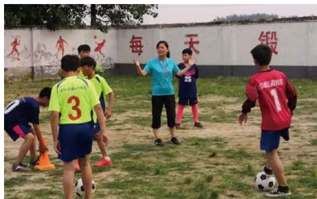
△ Under “Football 1+1” program, the kids have better facilities and site for football training