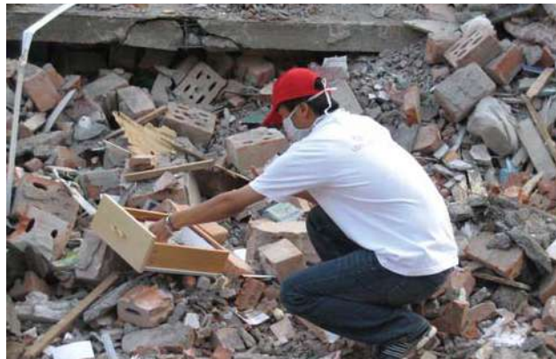
△ Amity staff doing need assessment after the earthquake