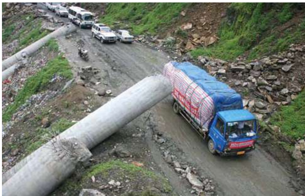
△ Amity relief truck after the earthquake