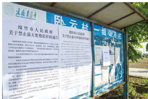
△ Amity bulletin boards still in use

“In addition to funds granted by the government, Amity also provided financial support to the villages according to