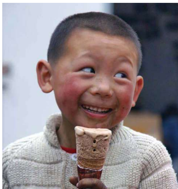
△ Child in Woyun Village

"In the newly planned Woyun Village, because of the concentration, the interaction between the villagers has been increased. Villagers share their biogas pools and share the places to dry crops... The whole Woyun Village is very harmonious."