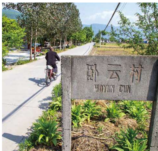
△ Woyun Village

Ten years are so short that we can still see those Amity water towers and granaries in the village. But ten years are also long enough for Amity ideas and spirits to penetrate the hearts of the villagers. We hope this homeland that is reborn by love will become more dynamic. Let's wish a prosperous rebirth and development of this small village.