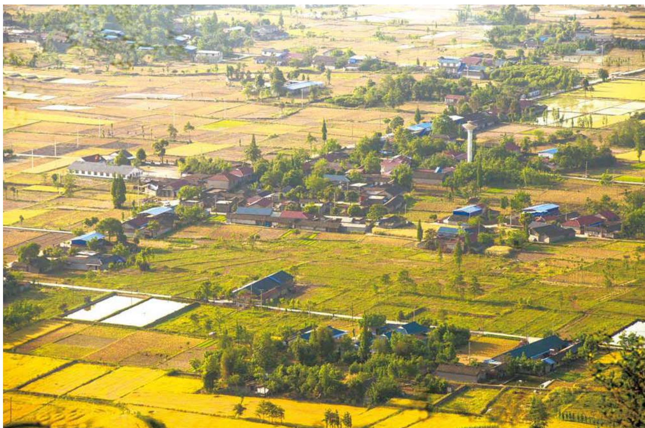
△ Woyun Village

Ten years after the 5.12 earthquake, when Amity staff came back to this Village of Woyun again, the light clouds, the fields of crops and the peaceful view make people linger.