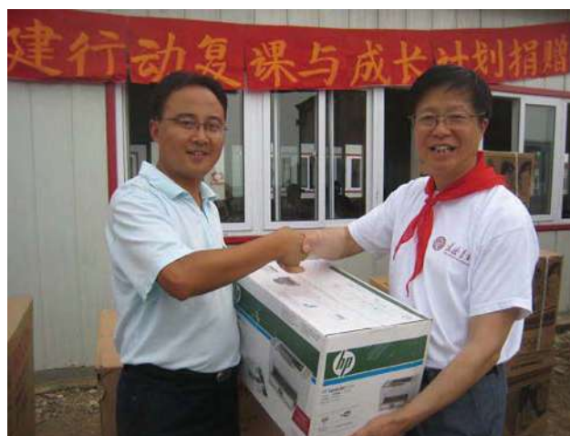
△ Amity class resumption and growth program signed

Apart from the above, Amity Team also helped the villagers to restore their lives and production through provision of daily necessities, promotion of organic fertilizers, restoration of water conservancy and design of “Amity granaries”.