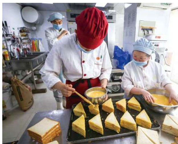
△ Brushing egg to the bread

May 20, 2018 is the 28th National Help-the-disabled Day in China. This year’s topic is “To complete the building of a moderately prosperous society, and never leave any people with disabilities behind”. This topic aligns with what the Amity Bakery always pursue – to encourage the society to care for the people with disabilities, create a loving atmosphere, provide job training and opportunities for them, so that they are able to make a living, have a job equally, and enjoy a meaningful life with dignity.