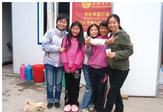
△ Amity staff together with village children

The earthquake separated countless families and people, and shattered the information communication mechanism of social life. In order to make the villagers well informed of relevant information and policies of the post-disaster reconstruction work, Amity set up bulletin boards for information disclosure.