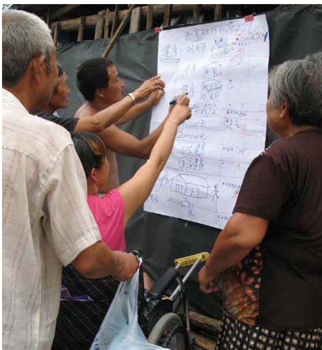
△ Villagers participating in the reconstruction process

Apart from the above, Amity Team also helped the villagers to restore their lives and production through provision of daily necessities, promotion of organic fertilizers, restoration of water conservancy and design of “Amity granaries”.