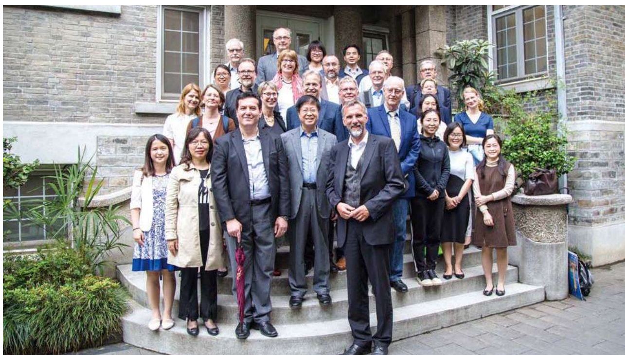
△ The German delegation is visiting Amity headquarters in Nanjing