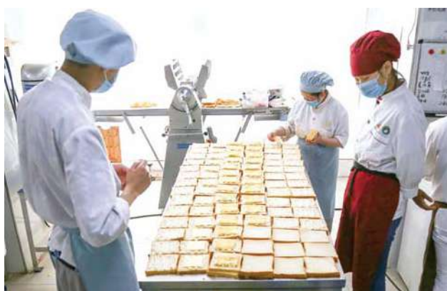
△ daily work of the Happy Naives

After finishing their half-day work, our special baking assistants can enjoy their lunchtime. Today the canteen serves shrimps, pork soup, as well as mangoes, which are their favorites.