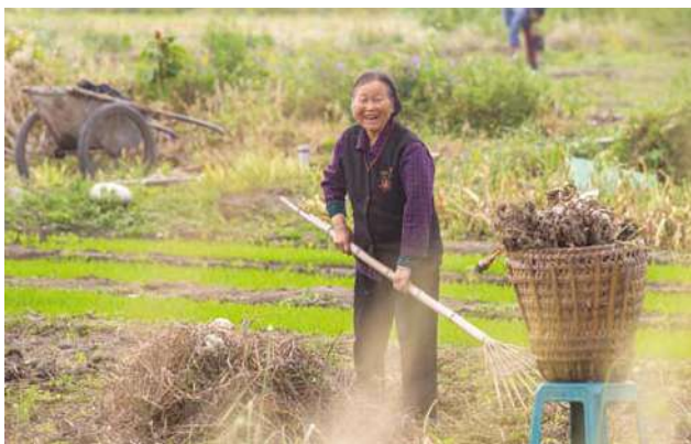
△ Villager working in the field