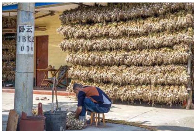
△ Woyun, the "hometown of garlic"