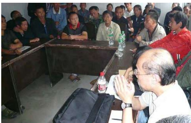
△ HK volunteers discussing reconstruction details with villagers after the earthquake