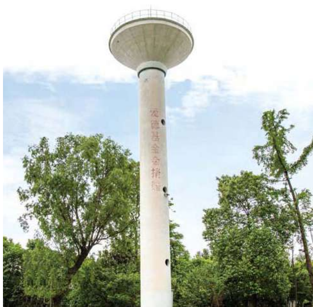
△ Amity water tower