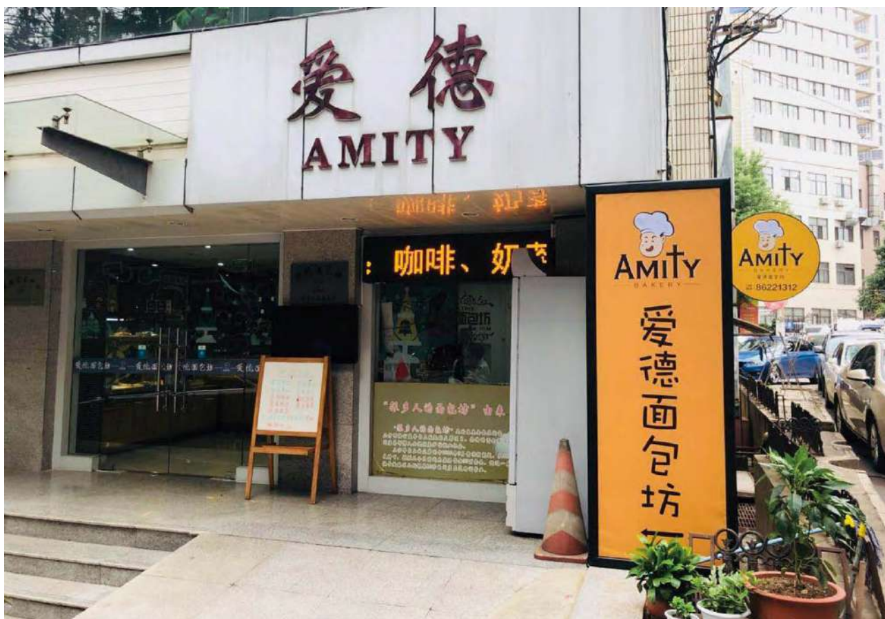
△ Amity Bakery

For 11 years, Amity Bakery has been training “The Happy Naives” (“The Happy Naive” refers to people who are mentally and physically challenged because of certain mental disorders) on baking skills, so that they can make a living with a job here. As the Help-the-disabled Day of 2018 is approaching, we would like to invite you to take a closer look on this special social enterprise, and listen to the wishes of those “Happy Naives”.