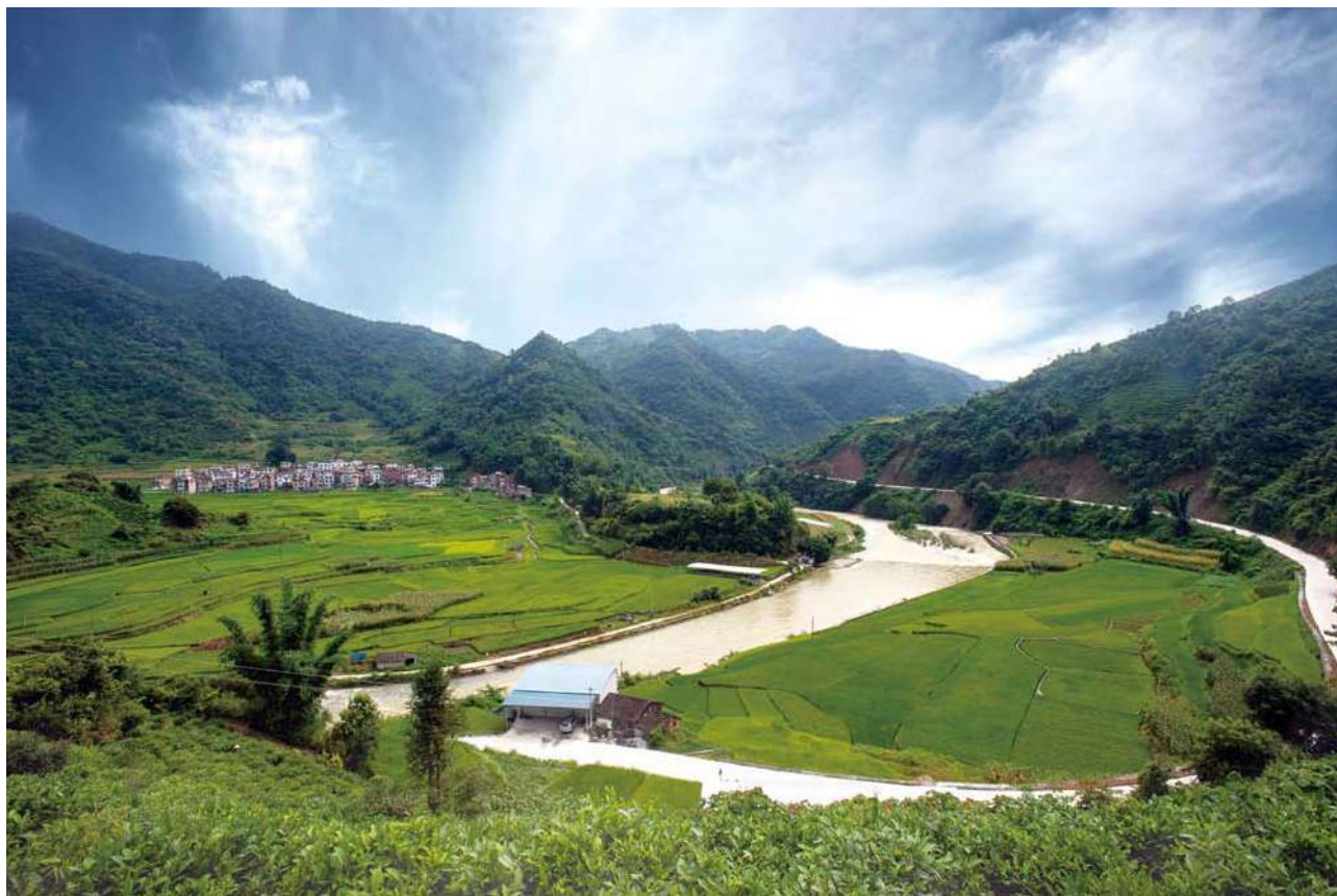
△ Hope growing out of Woyun Village

However, Amity staff feel that new blood may not be generated by only external forces. Amity is only a catalyst. It is this land that has nurtured these strong and tenacious people, allowing open-mindedness, courage, perseverance and wisdom of villages in the catastrophe with limited resources and guidance.