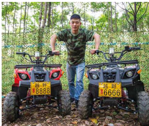
△ The boy surviving the earthquake is now starting his own business