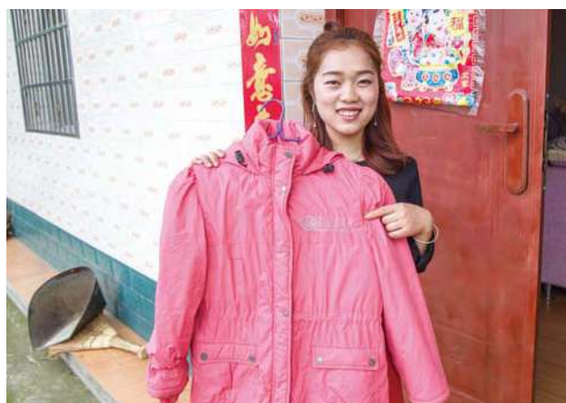
△ Villager still keeping the coat distributed by Amity ten years ago