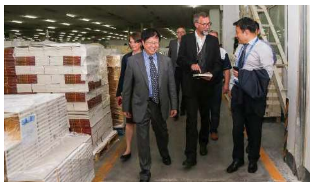
△ The German delegation during a visit at the Amity Printing Ltd.