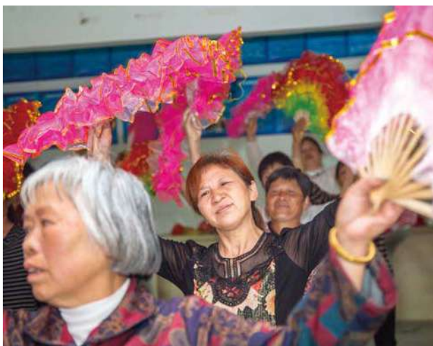
△ Woyun Singing and Dancing Team