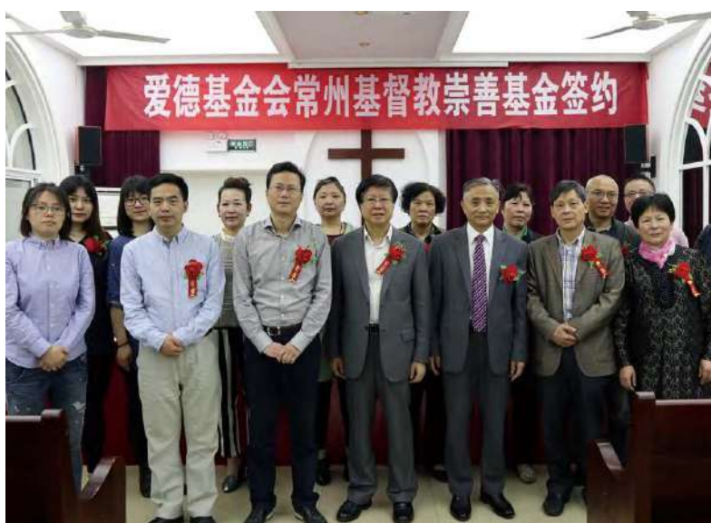
△ Participants of the inauguration ceremony of the 'Amity Changzhou Christian Chongshan Fund'