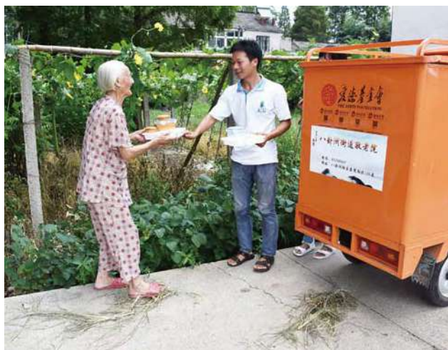
△ Amity staff distributing food to the elderly

Papa and Mama's Canteen is a community-based program initiated by Amity Foundation jointly with Alibaba Group and implemented by Qixia District Virtual Nursing Home (one of Amity's service entities). The project, through online fundraising process, provides funds and project guidance on community-based lunch support for the elderly. Based on professional social work, it aims to provide help for over 1,000 senior citizens in Nanjing, starting from a single lunch.