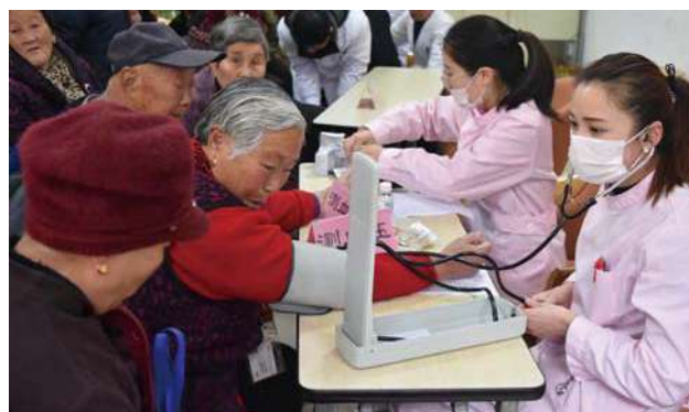
△ Free medical service