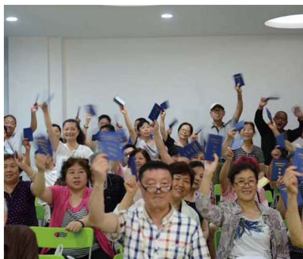
△ "I graduate from the college!"

A mity established a college for the elderly in Maigaoqiao Shanshui Park Community in Nanjing. The college is a community-based education space created especially for those empty-nest elderly. Once enrolled in the college, empty-nest elderly are encouraged to walk out of their lonely hut to learn something, do something and achieve something. In addition, the college also set up a platform for the elderly, women and children living in the community to share life experience and study materials. Volunteers are involved a lot in the program to provide service and professional skills. Interactions, happiness, knowledge... whatever you want, you can find it here in the Amity College for the Elderly!