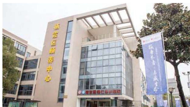
△ Nanjing Qixia Home for the elderly

Amity International Philanthropy Valley operates two