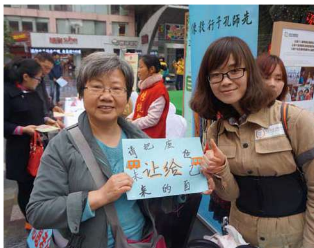
△ Words on the paper: "Please leave the seats to your future self" (this slogan raises awareness offering seats to the elderly)

Established in 2013, “Days of Love – Experience the Life of Being Old” Center is the first center in Nanjing for the public to experience aging. The theme of the design was “To: My Future Self”. Through the use of specially designed equipment, visitors experience a sample of what it is like physically to be aged. Specifically, the equipment restricts movements in order to help young people understand vicariously the physical and mental conditions of the elderly. In addition, multimedia, virtual dialogue, puzzle games and other forms of engagement were created to enhance public awareness, understanding and thinking on dementia.