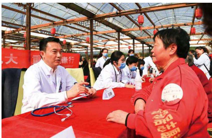
△ Free medical service