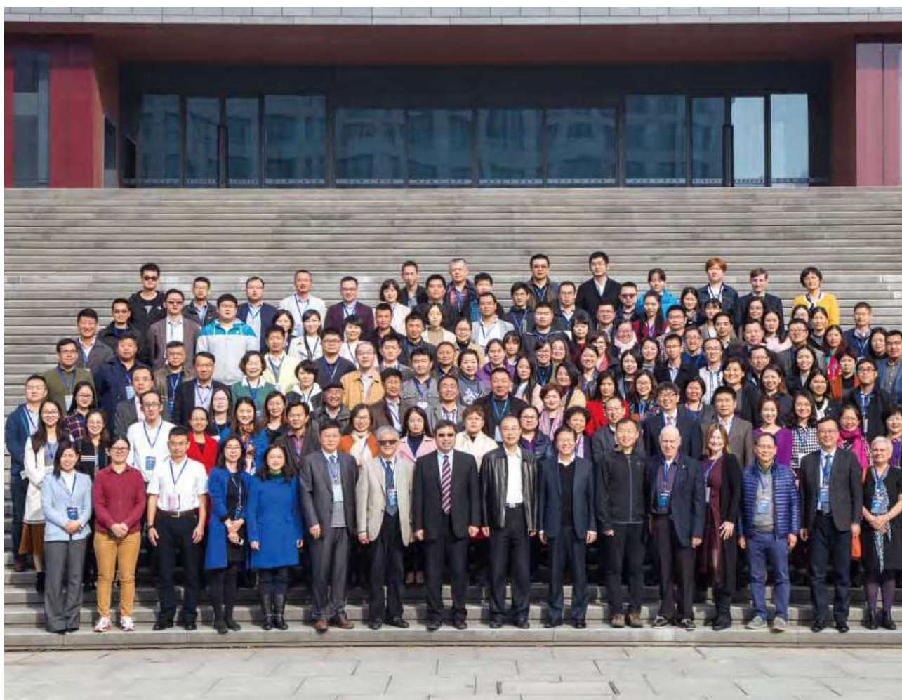
△ Group photo of participants of the Amity-Heren International Philanthropy Forum