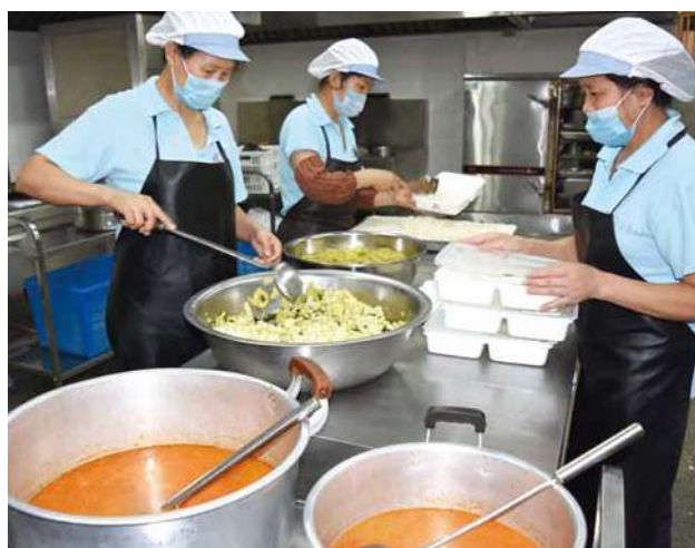
△ Staff packaging meals in the kitchen

C entral Kitchen is a project created and driven by needs from the elderly. Before, Amity only offered meals for organization-based elderly service in Qixia Home for the Elderly and Amity Care Home and provided meal support for home-based elderly service in Xigang community. Now, as we constantly receive catering requests, the existing service has been expanded to meal delivery in the two surrounding areas. In addition, our meal delivery service for our Virtual Home for the Elderly and Dingjiazhuang Shanshui Park brought convenience to all the staff, elderly, family members, volunteers and construction workers.