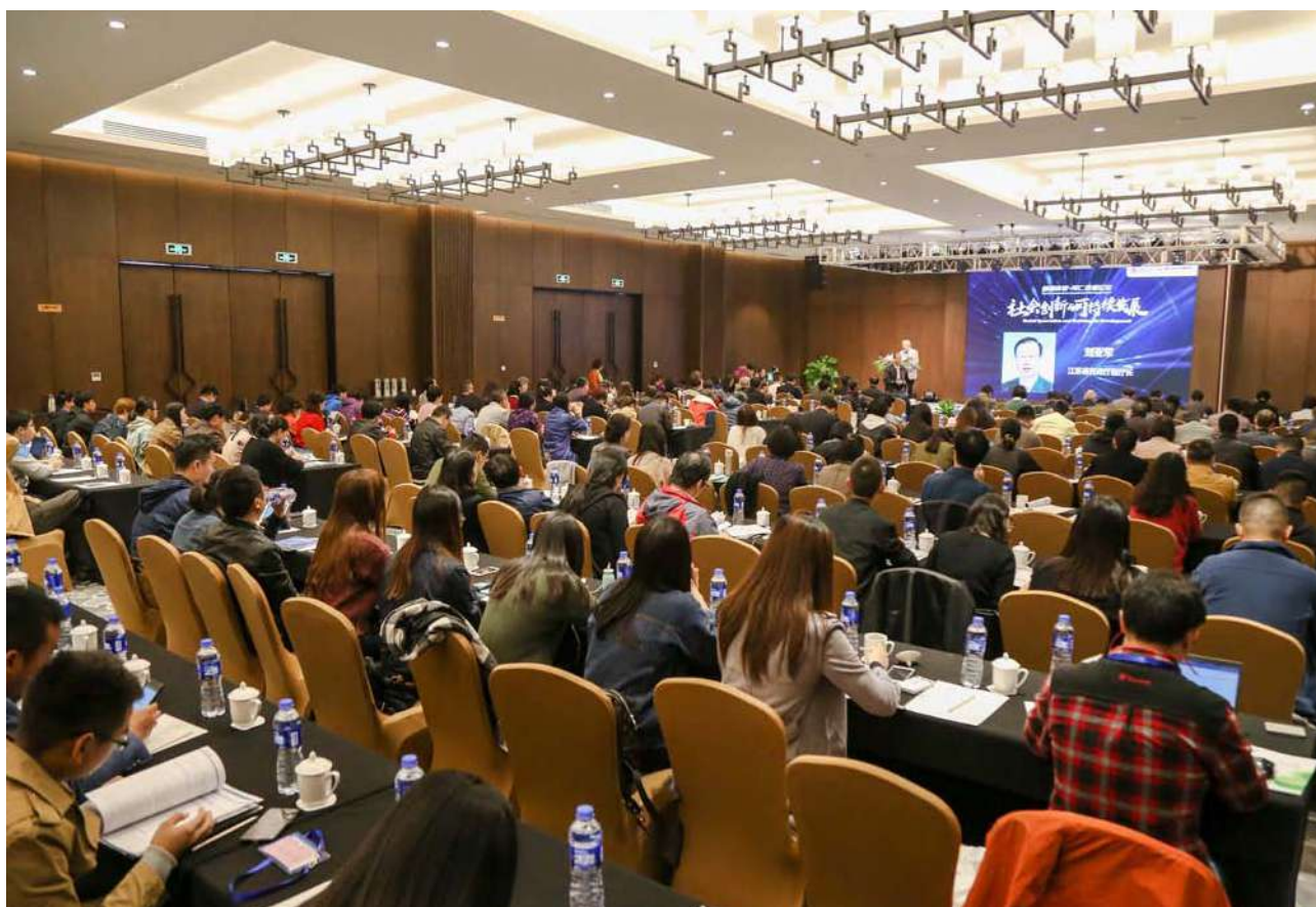
△ About 200 experts and practitioners attended the first Amity-Heren International Philanthropy Forum

On 7 to 8 of November, the first Amity-Heren International Philanthropy Forum was held in Nanjing. More than 50 practitioners and scholars from seven countries and regions presented, discussed and exchanged ideas on China's advancing public welfare and charity sector. The forum was jointly organized by the Amity Foundation and the Heren Charity Academy of Nanjing University. About 200 participants attended the main-forum on Social Innovation and Sustainable Development and the six related sub-forums.