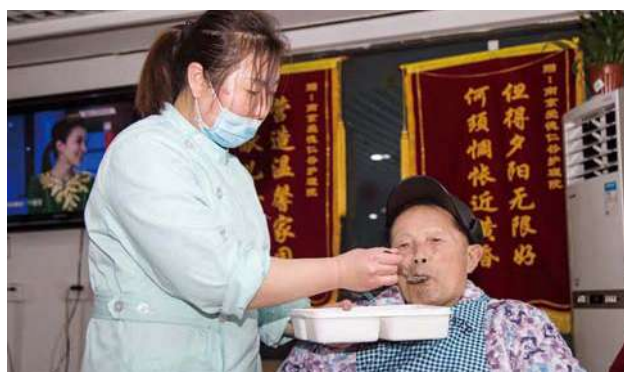
△ Staff feeding the elderly

Advocacy is another focus of Amity's work. Amity has held three international seminars for elderly service. By inviting professionals from both home and abroad, Amity held