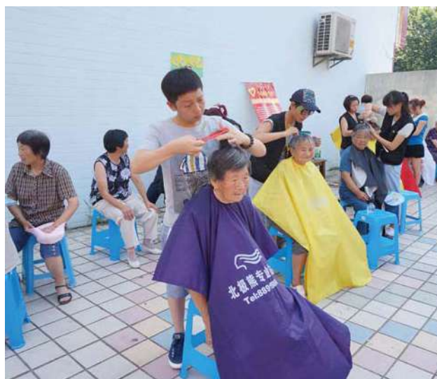
△ Haircut service

Services under the project are divided into packages while companies will purchase such packages as they wish. Based on the food provision network, Amity social workers extends professional services for the elderly and set up mutual support system for those elderly who live by themselves. On the other hand, companies also contribute to the project by providing financial support and involving staff in service. In this respect, employee awareness on social service is enhanced and public images of those companies are improved.