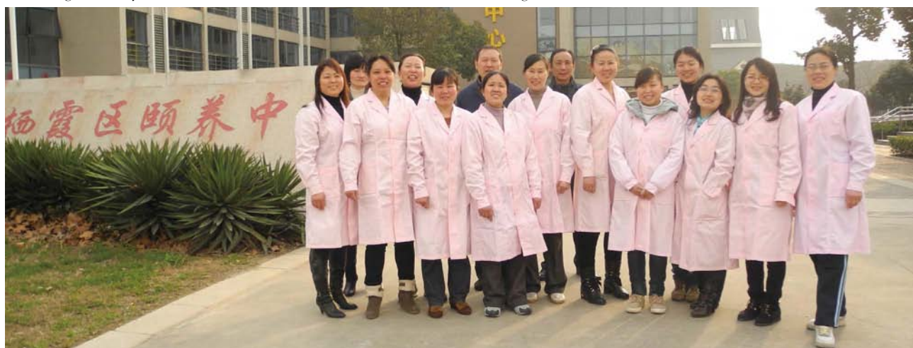
△ Talented team