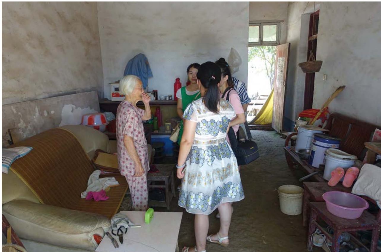
△ Home visit for need assessment

As China has stepped into an aging society, elderly service becomes more important than ever. It is the responsibility of the whole society to take good care of the elderly, improve their quality of life, enable them to live in a harmonious family with friendly neighborhood. Under the guidance and support from the government, Amity, through its brand project Amity International Philanthropy Valley, encourages individuals and enterprises to support and help 1,000 elderly people, including those living alone, losing spouse, with disabilities or with incapacities, to raise public awareness and to create an elderly-friendly society.