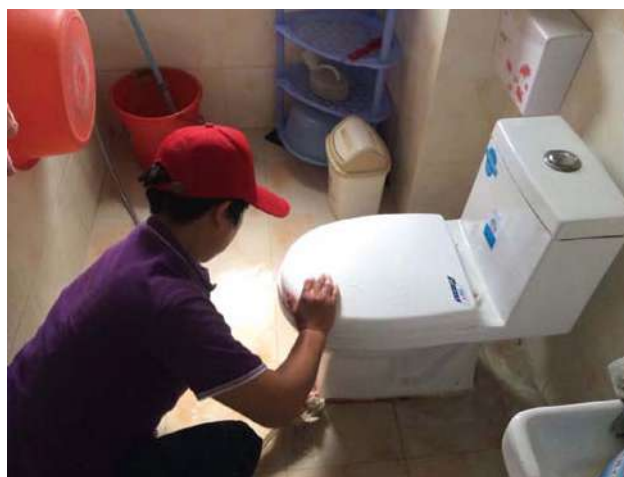
△ Careful service

There is no shortcut for serving the elderly, only by love can we make a better future.