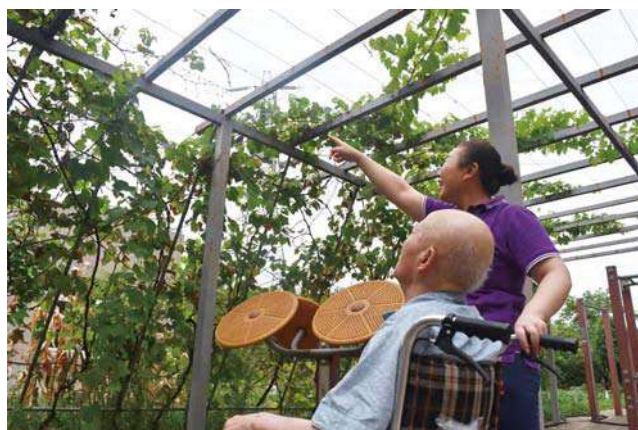
△ Taking a walk after lunch