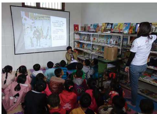
△ Watching videos