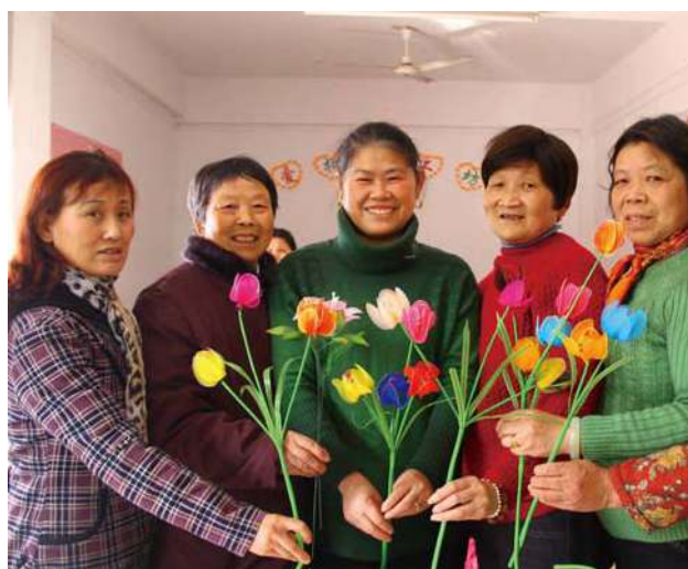
△ Handwork workshop