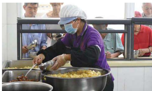
△ Serving meals

No matter what occupation people are holding, working under heat is always difficult, especially for those who engage in front-line work. We hereby, on behalf of the Amity Philanthropic Valley Nanjing Caring Home, salute to all working staff who stick to their posts! You are the most beautiful people in the heat!