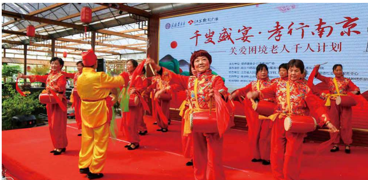
△ Performance during the feast

dialogues on the conditions, trends, policies and practice of elderly service, and relevant education and innovation. This kind of dialogue has received wide support and attention from the government, professional associations, and institutions, and provided an open and equal platform for all participants to exchange ideas and in-depth thinking. This, in turn, will improve the capacity of social organizations fundamentally.