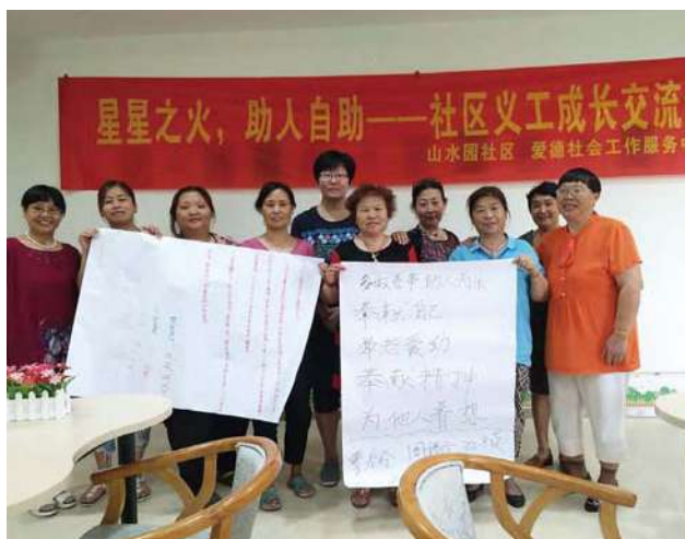
△ Community volunteers exchanging work experience and practices

I n 2016, Amity received a district fund of RMB 80,000 to initiate the "Knocking Knocking at the Door" Community Support Program. The program aims to care for those elderly who live alone and in difficulties. In implementing the program, Amity formed a volunteer team, who, together with Amity JollyHome staff, visit those elderly regularly and provide necessary help, including spiritual consolation, safety check, medical aid, shopping support, emergency assistance and meal support. Over time, the volunteers improved their professionalism and the idea of mutual help and self-governance is spread across communities.