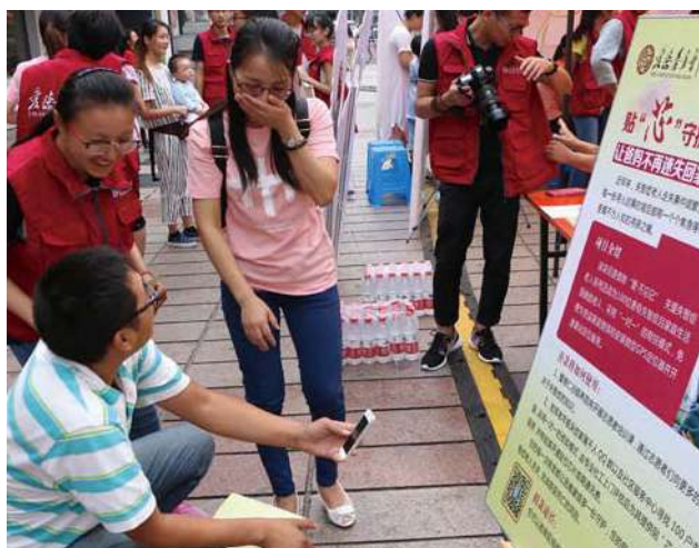
△ Street exhibition

T he project aims to create an inclusive, friendly, convenient and safe living or travelling environment for people with dementia and their families through the development of individual or group of volunteers to help them and their families to live a better life in the communities. We aim to build a dementia-friendly city in the long-run.