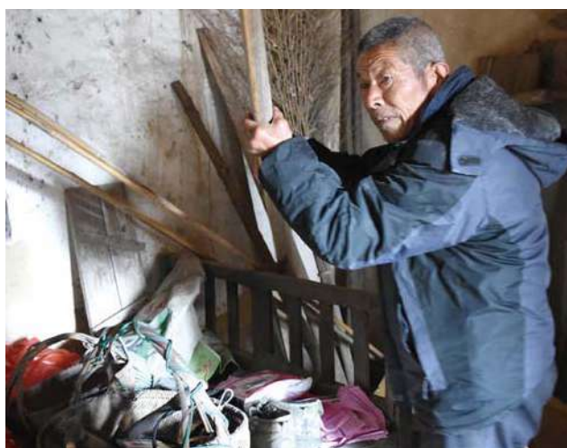
△ Poor living conditions

As China has stepped into an aging society, elderly service becomes more important than ever. It is the responsibility of the whole society to take good care of the elderly, improve their quality of life, enable them to live in a harmonious family with friendly neighborhood. Under the guidance and support from the government, Amity, through its brand project Amity International Philanthropy Valley, encourages individuals and enterprises to support and help 1,000 elderly people, including those living alone, losing spouse, with disabilities or with incapacities, to raise public awareness and to create an elderly-friendly society.