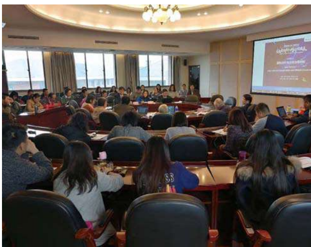
△ Social Innovation was one of the main topics discussed in simultaneous sub-forums

He Wen pointed out the important contribution of grassroots NGOs. Unfortunately, they are often lack of funding. Most funds that are raised in affluent regions are then again used in the same regions. Projects often receive the most exposure when they are emotionally attaching and the mass media is causing fragmentation of information that leads to a lack of deeper understanding of social issues. This brings the danger of an overemphasis of marketization and a neglect of providing quality service. Especially grassroots organizations are confronted with the disparity between quality of service and commercialization, the dilemma between doing good and marketization. Consequently, professionalism and distribution in China are still insufficient.