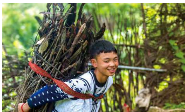
Boy picking firewood for his grandma