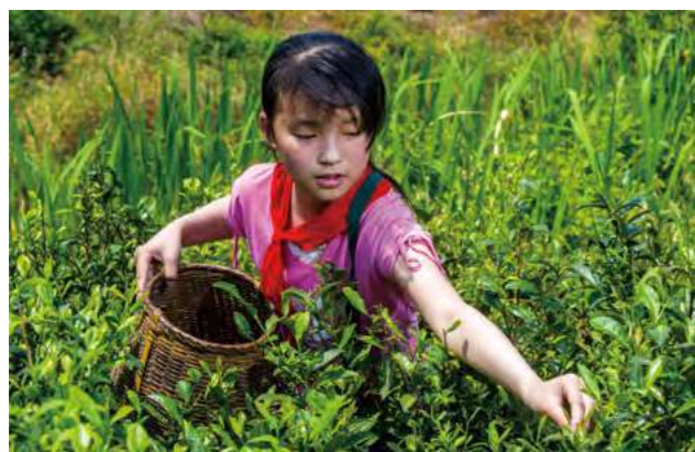
Girl picking tea leaves for her family

Therefore, there are too many places that urban and rural areas are supposed to complement each other: big cities have lost their tradition, their individuality, and the blue sky; on the other hand, underdeveloped areas lack quality life guarantee and basic dignity of life while a vast tradition, essence or trash, are kept there. Anyway, I will continue to use my scanty and limited power to support the "E-action" program and strive to support those orphans who need help. At this moment, I want to gently ask all of the readers: would you like to help them? No matter what your answer is, at least I will!