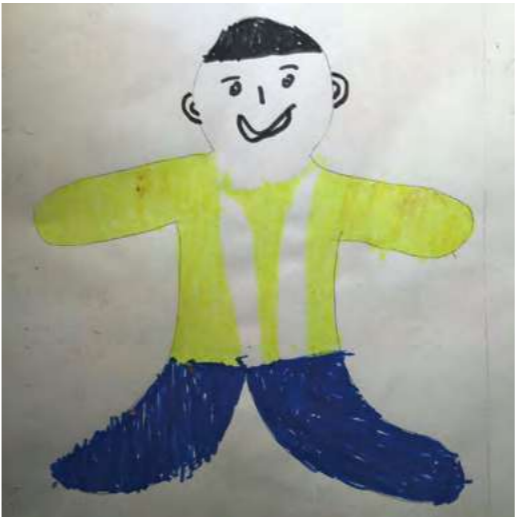
Painting by a boy, 10 years old

In addition to speaking and writing, emotional guidance can also be portrayed in color. As adults, the best we can do is to be a listener. You may remind them of an impressive thing or event and ask them their emotions and feelings of the event. Then ask them to choose colors to represent their own emotions and describe in pictures. This method is used to guide the emotion for children in difficult circumstances. We can take the following work as an example: