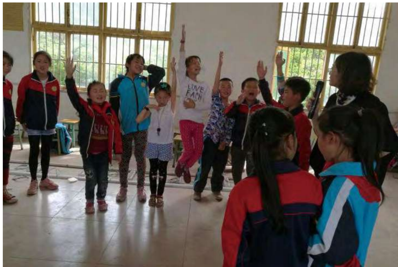
Trainer from Nanjing playing with a group of at-risk children recorded with a camera for demonstration purpose

Furthermore, trainers from Hong Kong and the Mainland trained the participants how to acknowledge and manage children's emotions and how to communicate with children in need of psychological help. "My son said he felt warmth and love like never before after our talk last night", told one teacher excitedly, when she shared how she used the new communication method. "Now, I have more confidence in understanding needy children in my school through proper dialogues in