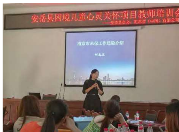
Social worker from Nanjing share about their work

Furthermore, trainers from Hong Kong and the Mainland trained the participants how to acknowledge and manage children's emotions and how to communicate with children in need of psychological help. "My son said he felt warmth and love like never before after our talk last night", told one teacher excitedly, when she shared how she used the new communication method. "Now, I have more confidence in understanding needy children in my school through proper dialogues in