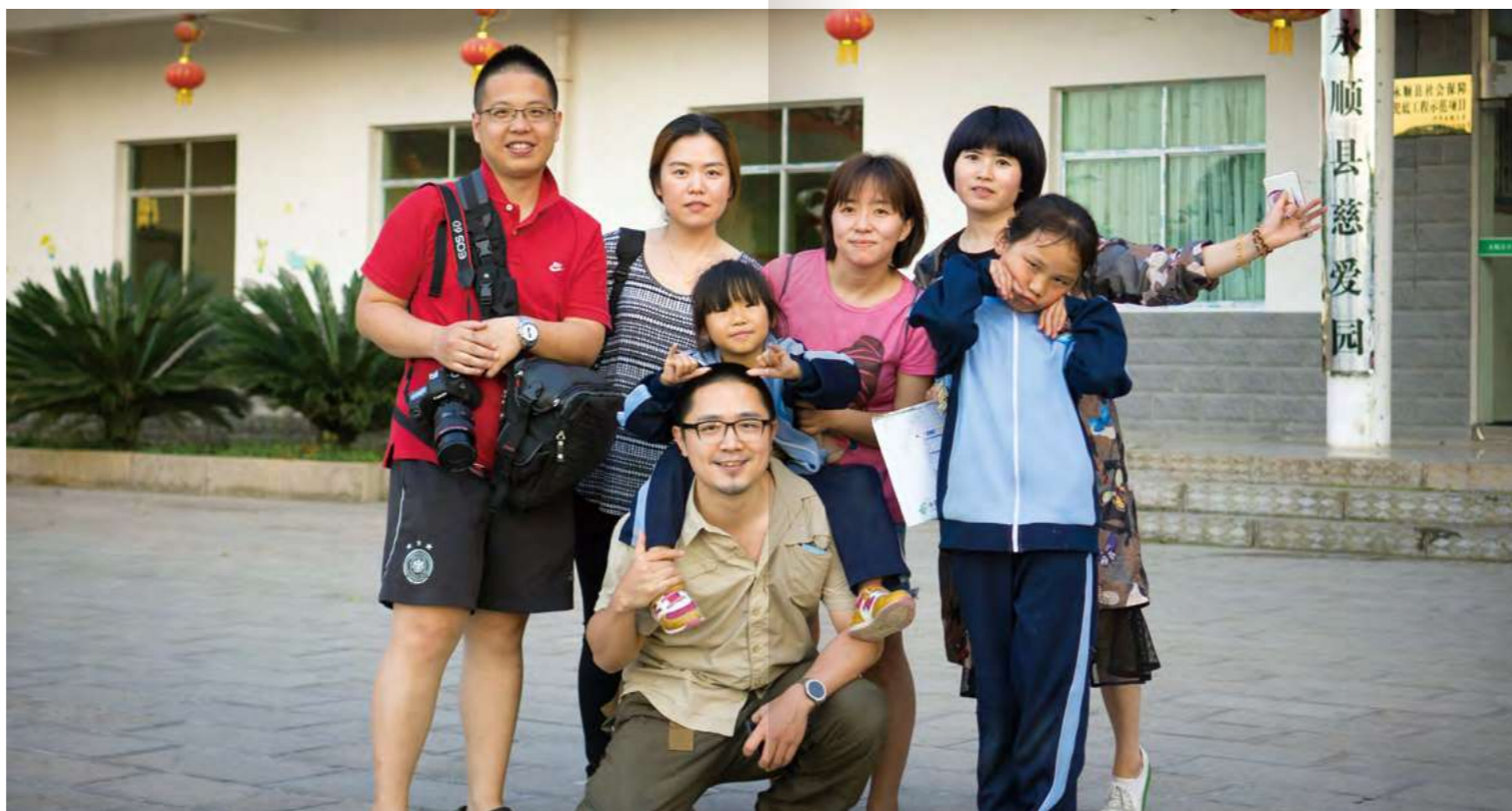
Amity staff, volunteers, local partners and kids