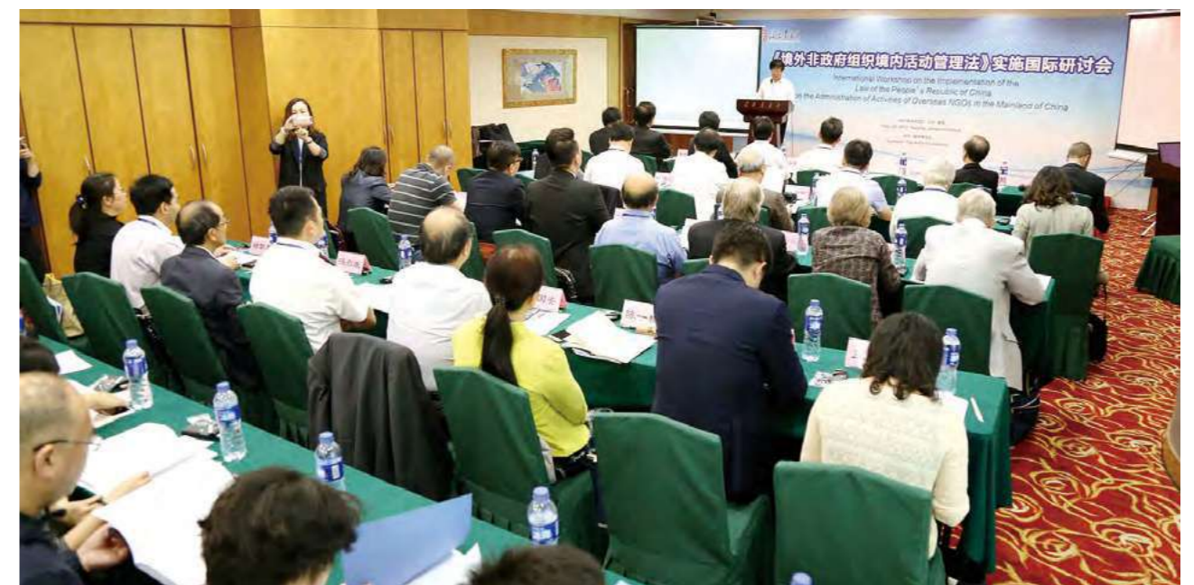
Representatives and practitioners of the third sector and authorities discussing issues of China's new Overseas NGO law.