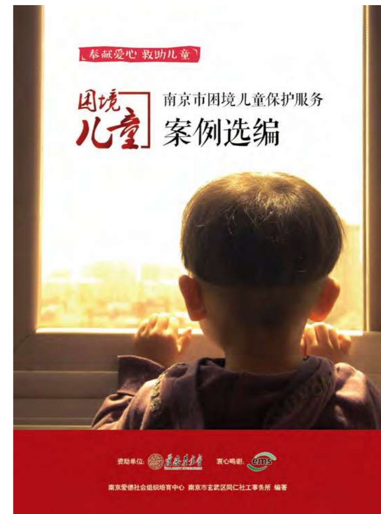
Amity's case study booklet for at-risk children in China

Supported by the Evangelical Mission in Solidarity (EMS), the Amity Foundation published a booklet with