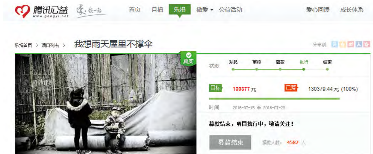
Interface of on-line crowd-funding for a new dwelling for the grandpa and his two grandchildren

a dilapidated old hut. The only income is made by the grandpa who is nearly ninety years old – he works on a small cropland with the help from the villagers to get some food. For years, his grandchildren had not had any piece of new clothing. They rely solely on relatives and neighbors for their daily necessities. Although life is so difficult, the grandpa insists that two grandchildren go to school. The two children, even with tattered schoolbags and broken stationery, keep their dream of continuing school.