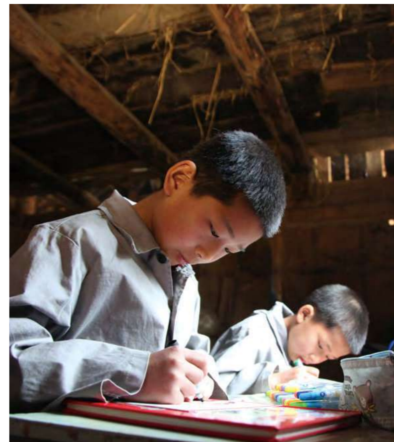
Children of E-action Program

Amity's "E-action" was conceived in late 2006. A group of Nanjing contributors of IT, sports, law, media and business profession spontaneously formed a volunteering team at the headquarters of Amity Foundation. The volunteering team consists of a few members with social influence including several celebrities, such as Sun Yue, a famous athlete and former captain of national women's volleyball team.