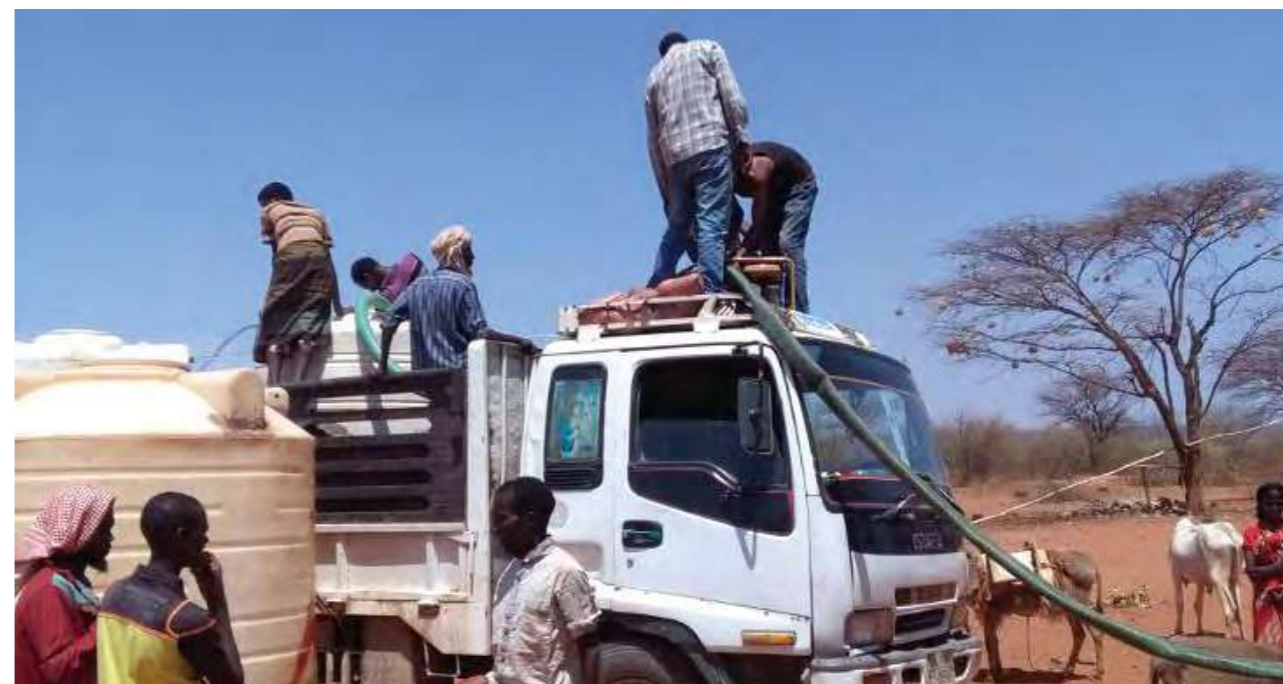
Trucks deliver water to regions heavily affected by the drought

Amity appeals to our friends for donations so that the much needed emergency supplies and services could be provided through the hands of Amity for people affected by the droughts in Ethiopia.