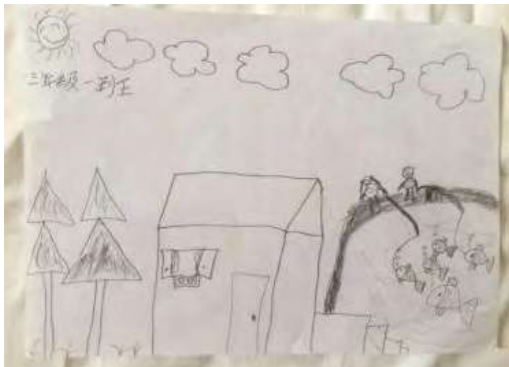
Painting by a boy, 9 years old

A quarter of sun on the upper left corner shows the painter's yearning for the warmth from mother which is difficult to obtain in reality. The pine tree on the left bottom reflects the struggle of the painter despite all the obstacles during growing process. The straight truck shows the character of the painter, who is a little bit stubborn and lacking flexibility. The house depicted by ruler shows the painter's inner desire for some support. Both the house and the tree are cut down, which show the insufficient security inside the painter's heart. A carefully painted roof indicates a tendency of the painter to pursue perfection and the demand on himself/herself. The clock on the side wall indicates that the painter is eager for some success. The door of the house is small and closed in the lower right corner, which reflects a lack of interpersonal communication. The door has a black button, which indicates a defensive and anxious inside of the painter. The smoke on the roof demonstrates conflicts in the family.