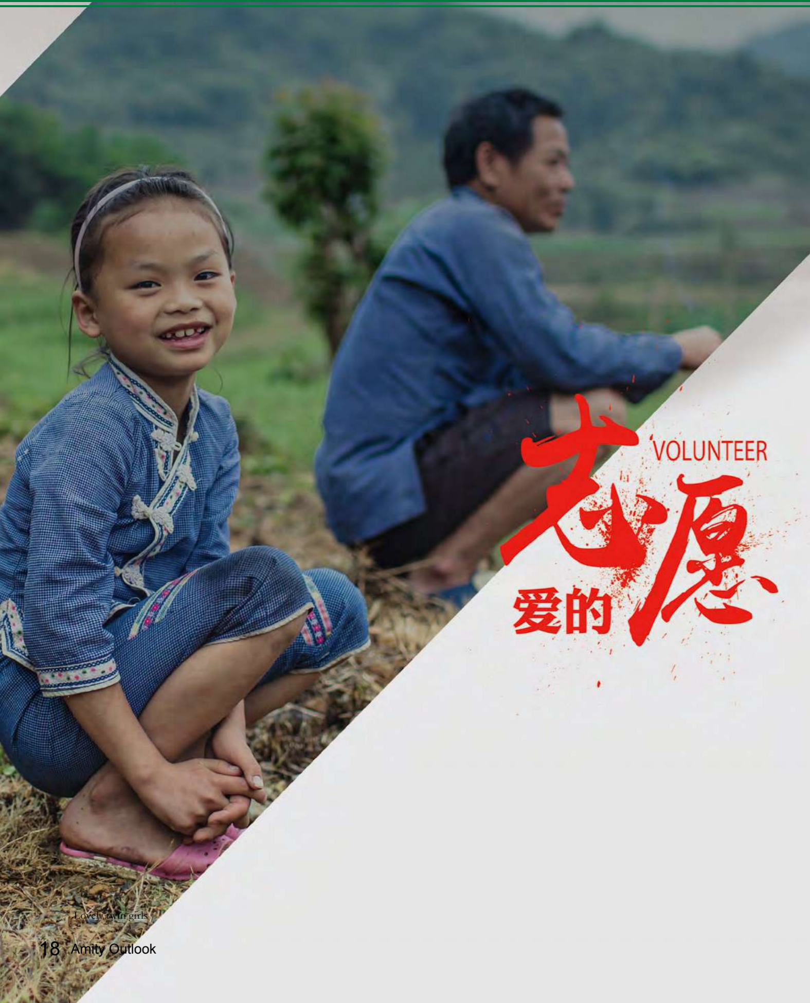
Lovely twin girls