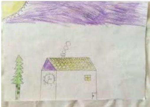
Painting from a girl, 11 years old

A quarter of sun on the upper left corner shows the painter's yearning for the warmth from mother which is difficult to obtain in reality. The pine tree on the left bottom reflects the struggle of the painter despite all the obstacles during growing process. The straight truck shows the character of the painter, who is a little bit stubborn and lacking flexibility. The house depicted by ruler shows the painter's inner desire for some support. Both the house and the tree are cut down, which show the insufficient security inside the painter's heart. A carefully painted roof indicates a tendency of the painter to pursue perfection and the demand on himself/herself. The clock on the side wall indicates that the painter is eager for some success. The door of the house is small and closed in the lower right corner, which reflects a lack of interpersonal communication. The door has a black button, which indicates a defensive and anxious inside of the painter. The smoke on the roof demonstrates conflicts in the family.