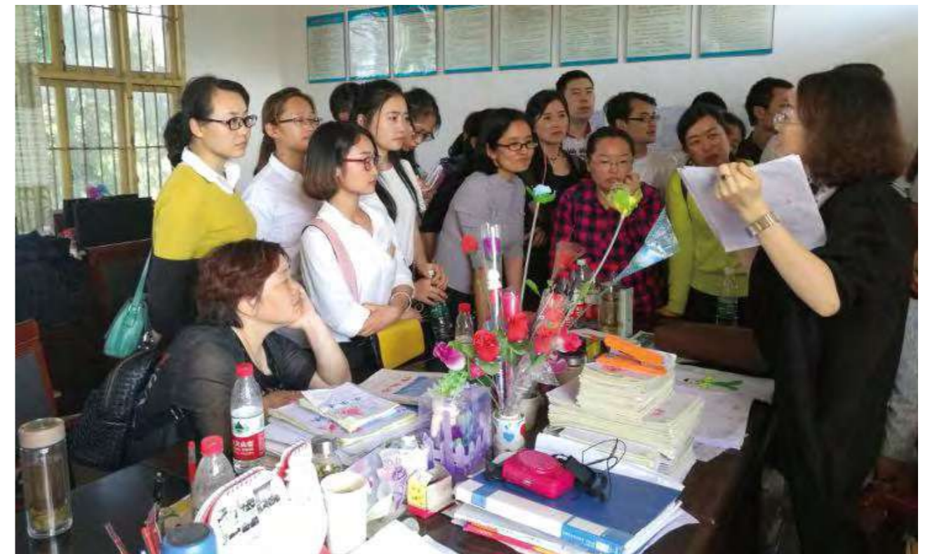
Participants are interpreting pictures drawn by at-risk children to grasp an idea about their psychological well-being

In March and May Amity conducted two training sessions for village school teachers in Sichuan Province. These workshops marked the beginning of a 3-year project funded by Versace. The project aims to provide sustainable and comprehensive support for at-risk children in the local communities of Anyue.