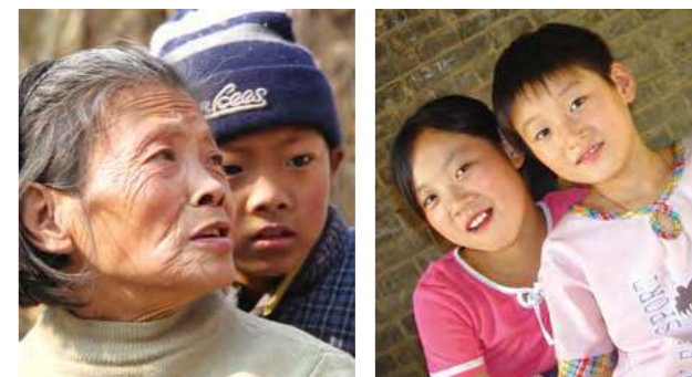
Children and their guardians supported by E-action Program

To be more transparent and open, Amity organizes regular visits to the project areas by donors. A combination of online and offline interaction has brought better experience to the donors.