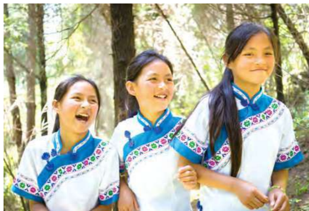
The triplet sisters

On our way to the corn field, when the second sister saw the honeysuckles on the road, she became happy. She rushed to the flowers, took off the vines, quickly made a garland and proudly put it onto her head. The other two sisters were encouraged. They joined her by taking a few roses outside the neighboring garden and added to the garland. The garland was colorful as the sisters added more flowers on it. They were happy making the garland, took turns to wear and teased each other. The atmosphere turned to be lovely and relaxed. I lifted my camera to record the moments of nature and beauty that belonged to the mountains and also the three sisters.