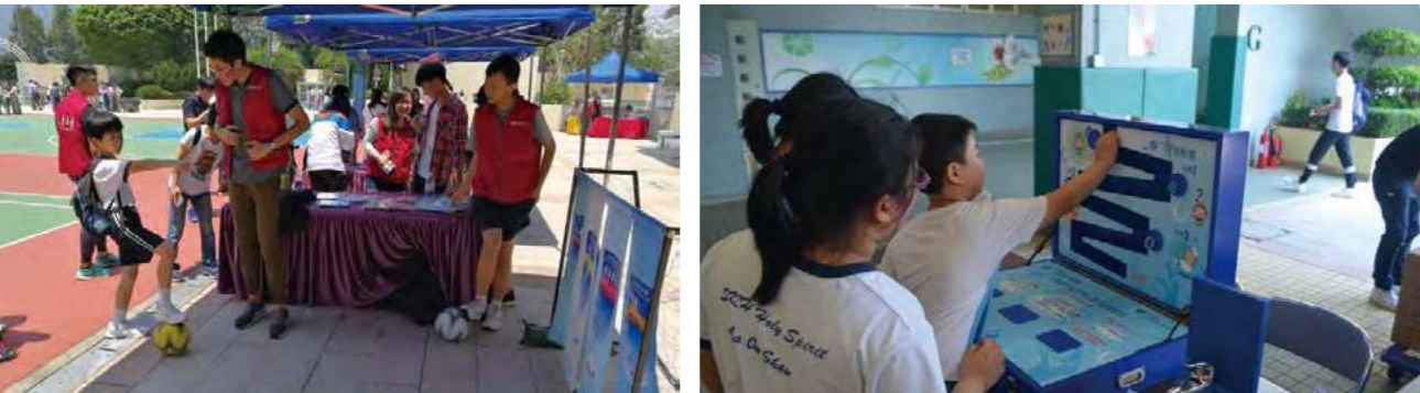
The Hong Kong Water Department, an enduring supporter of the Walk for Living Water provides entertaining and educational game booths for the participants