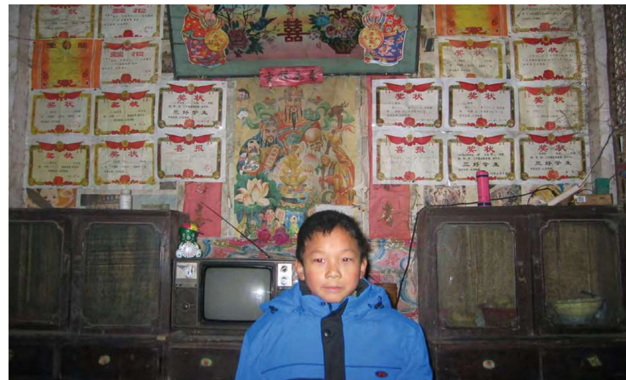
A hard-working E-action Child with all kinds of awards on his wall

In Shuanglong Town, Huayuan County of Hunan Province, there is a family living in extreme poverty. Once upon a time, the family had seven members across three generations. Now, only the grandpa and two young grandchildren lived together in