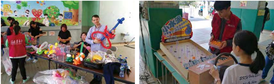
Volunteers and participants enjoy balloon twisting and gaming activities before and after the Walk