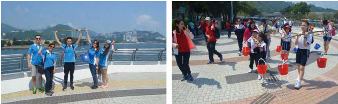
At the promenade of Ma On Shan, the participants are carrying buckets of water and advocate for SDG 6: Access to Water and Sanitation