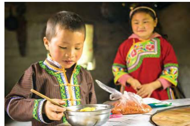
A sister watching her brother eating