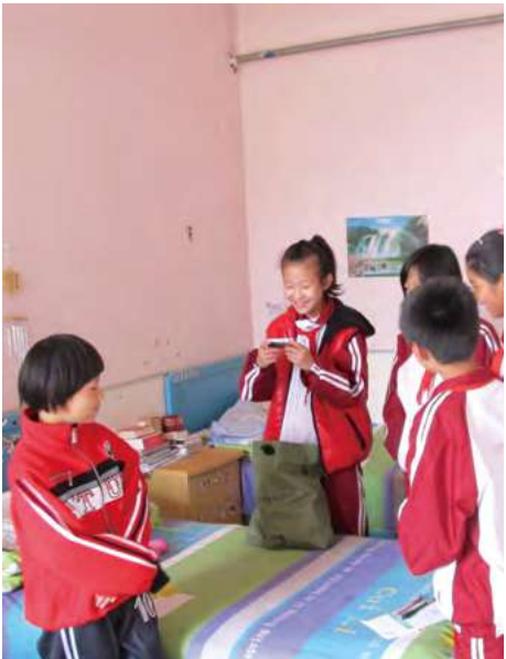
A shy girl living in the Dongzhou Children's Home chatting with visiting children from an urban school