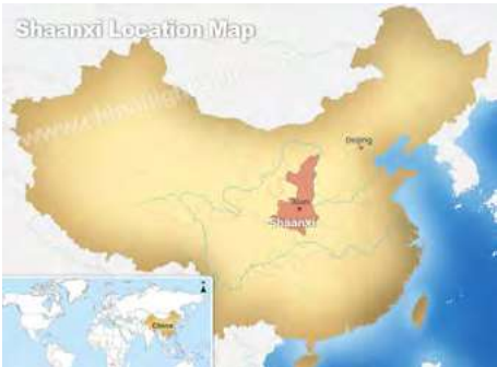
The map shows the location of Shaanxi province in China