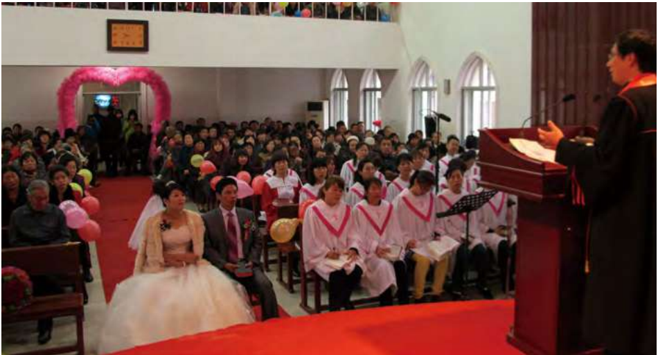
A Christian wedding at a local church in Shaanxi Province

Arrival in Xi'an, reception by the Shaanxi Christian Council, and joining in worship at a local church in Xi'an