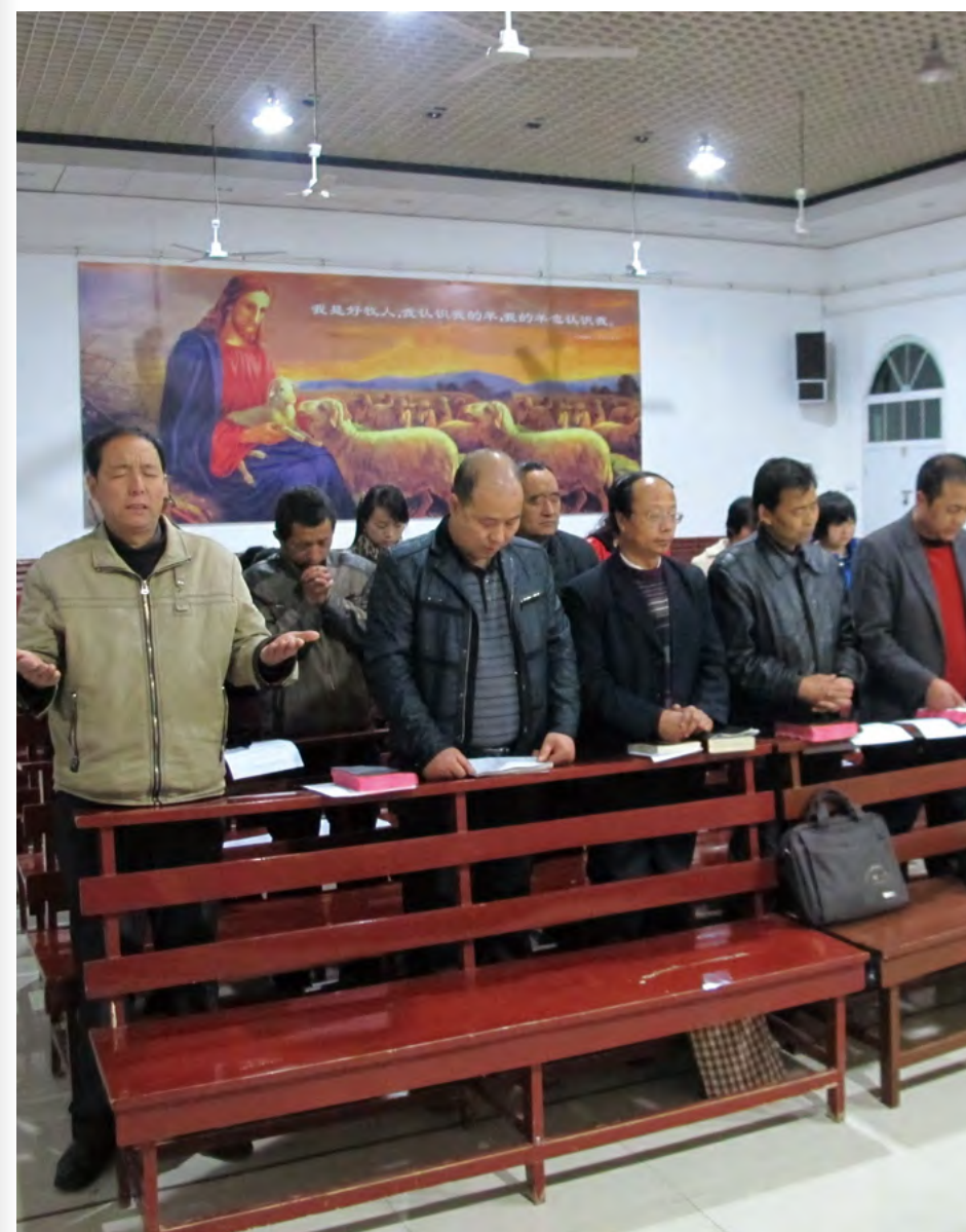
A night worship service at the Qishan County Church, where the aspiring pastor and believers are making great efforts in building a diaconia center.

Visiting the Qishan County Church and return to Xi'an