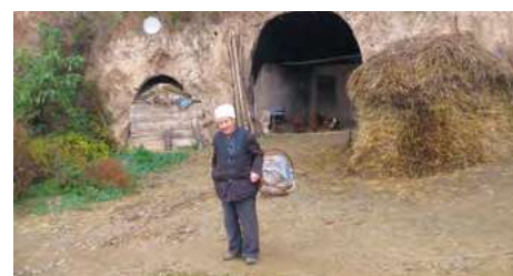
A loess cave residence

Kangjiahe Village is located on the top of a loess hill. The villagers of the Hui Ethnic group suffered a lot from the village's altitude. The water in a reservoir down the hill was not easy accessible to hilltop dwellers. Their farms also suffered the lack of water. Poverty prevailed in the village. To facilitate the integrated development of the village, Amity provided RMB 100,000 for building the drinking water supply system, RMB 200,000 for building villagers' houses, and RMB 250,000 for planting drought-tolerant walnut trees in 2009 and 2010.