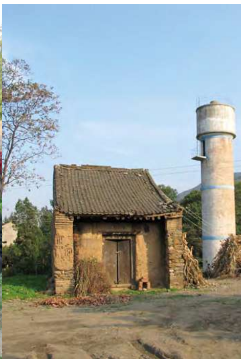
The Amity-funded water tower behind a deserted temple housing the god of earth