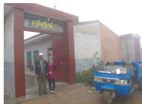
A happy couple of the Hui ethnic group at the gate of their new house built with Amity's aid