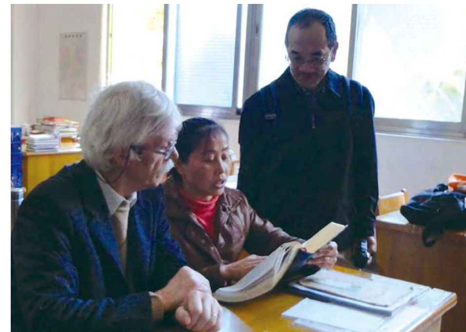
I was very moved when she read the famous verses of Matthew 25, 34-40 in Chinese