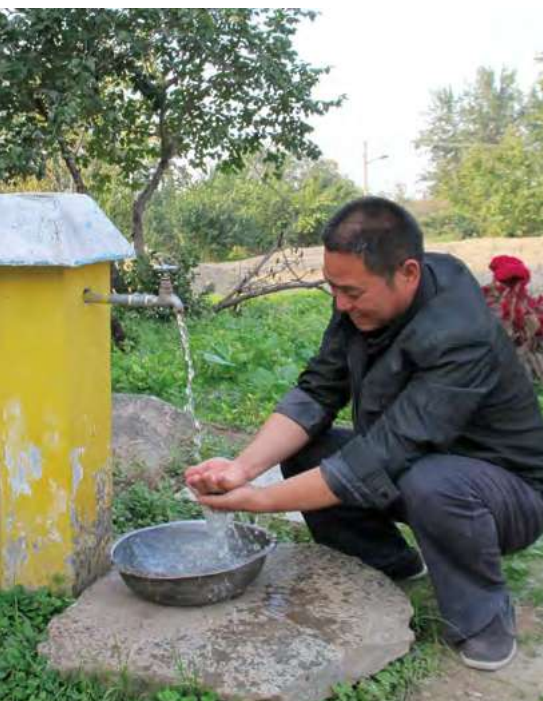
A villager washing his hands with tap water from the Amity-funded water supply system