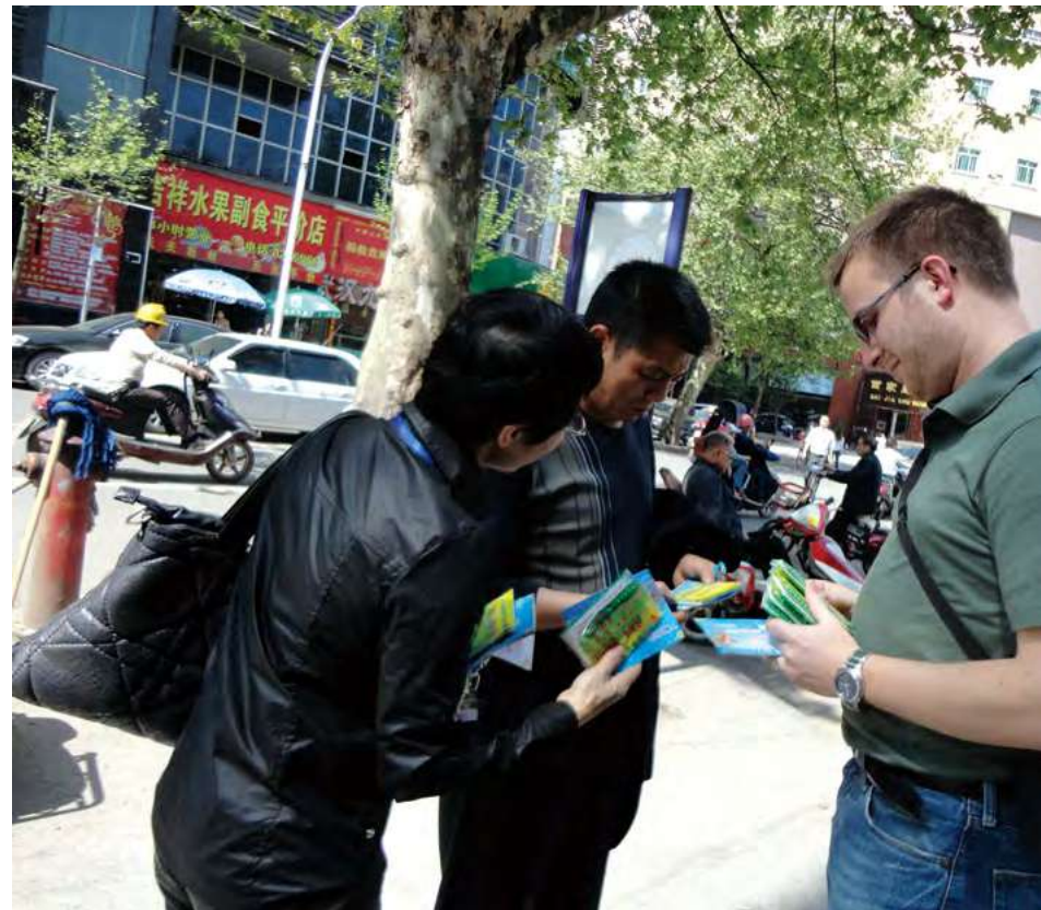
Distributing leaflets on HIV/AIDS prevention in Hengyang City

Back in Longshan, we had an interesting exchange with teachers who participated in the Rural English Teacher Training Project. I must admit, I was shocked by the size of the English classes – at least 70 pupils in one class! How can there be successful learning? In front of the Longshan church, the largest Christian church in the Tujia and Miao Autonomous Prefecture of Hunan Province, we were welcomed by powerful