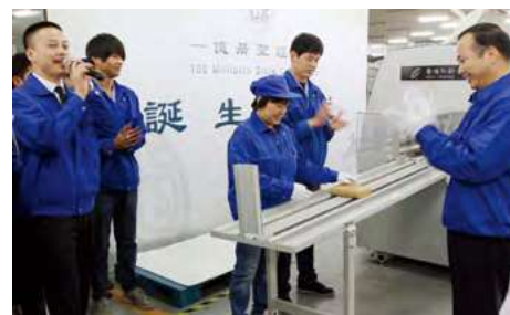
Applauding the birth of the 100 millionth Bible.

The Bible celebration took place at the new, hi-tech printing works and the actual moment of seeing that 100 millionth Bible - which we all did on a video screen - was very moving. The book was passed in turn to several of the workers who told their story of working at Amity - some of them for