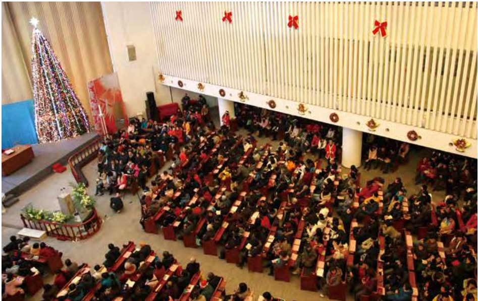
One of the "overflowing churches" in Beijing