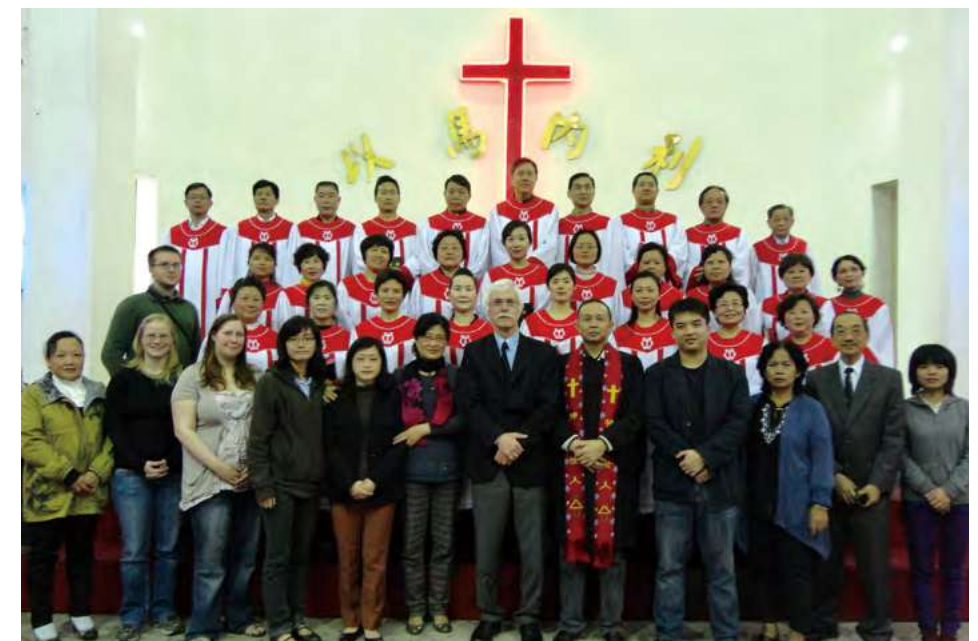
A group picture taken after Sunday service at Hengyang City Church