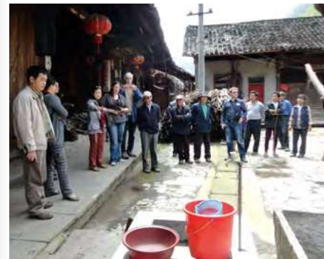
Visiting a drinking water system in Xibi Village, Longshan

On our way to the airport of Zhangjiajie we stopped at the Yongding Christian Church. There I had a chance to see batiks which showed biblical stories in a "Chinese" interpretation.