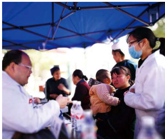
Free healthcare for one of Lalan's communities

knowledge is necessary for disease prevention and control among local people. Lastly, further trainings are to be provided for primary-level doctors to improve diagnosing and medical treatment skills.