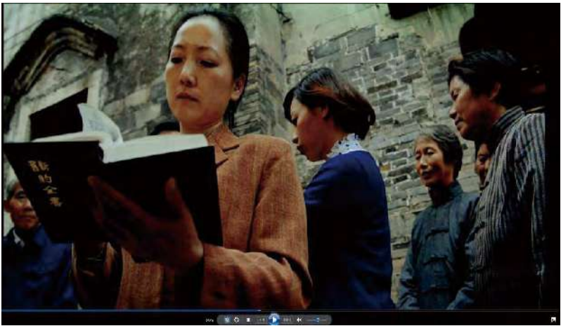
Screenshot of "The Fountain of Life"