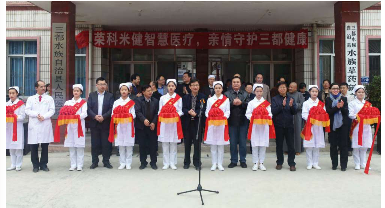
Launch of an online health diagnosis platform for remote regions without access to proper health care

and provided one-week free healthcare service for disadvantaged people in local communities. During the event, the team also provided on-site guidance for medical staff from the local hospital, the People's Hospital of Sandu County.