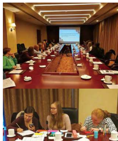
The volunteers introducing their work (up) and preparing for teaching sessions at a village school in Yongshun County (down).

On the first day the staff of Amity's International Exchange and Education Division gave presentations about the department's latest developments. Over the last years, the department could extend its activities and programs. Meanwhile the number of programs has increased to eight and the exchange goes not only from north to south, but also vice versa and south-south exchange. In 2016, Amity's international education programs benefitted more than 8,000 people directly.