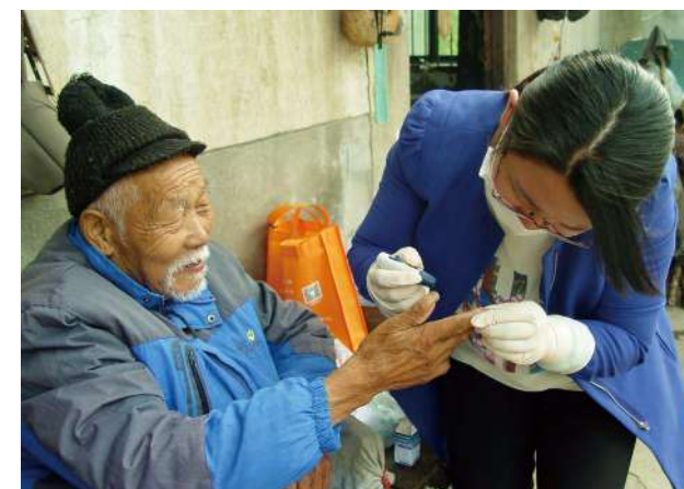
Care worker is providing manicuring service for the elderly

Since November 2016, the contact center has integrated resources from three 4A social organizations and 30 AAA social organizations, as well as four housekeeping and appliance-repair companies to provide 24/7 services for the elderly. This service program has expanded and is now