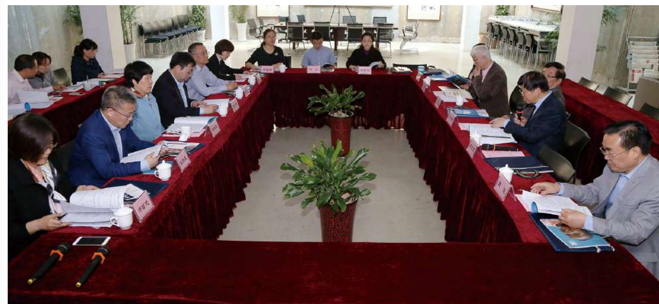
More than 20 people attended Amity's second Board Meeting of the Third Board