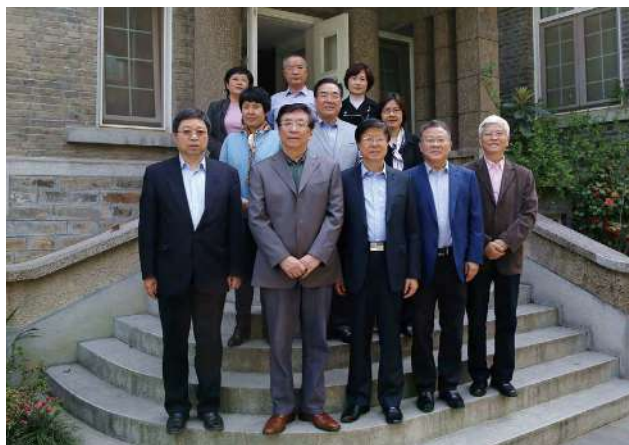
Group photo of Amity Foundation's Third Board in front of Amity's headquarters in Nanjing