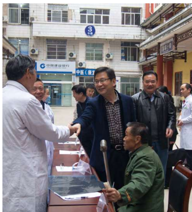
The delegation is visiting projects that provide free healthcare for disadvantaged people in local communities