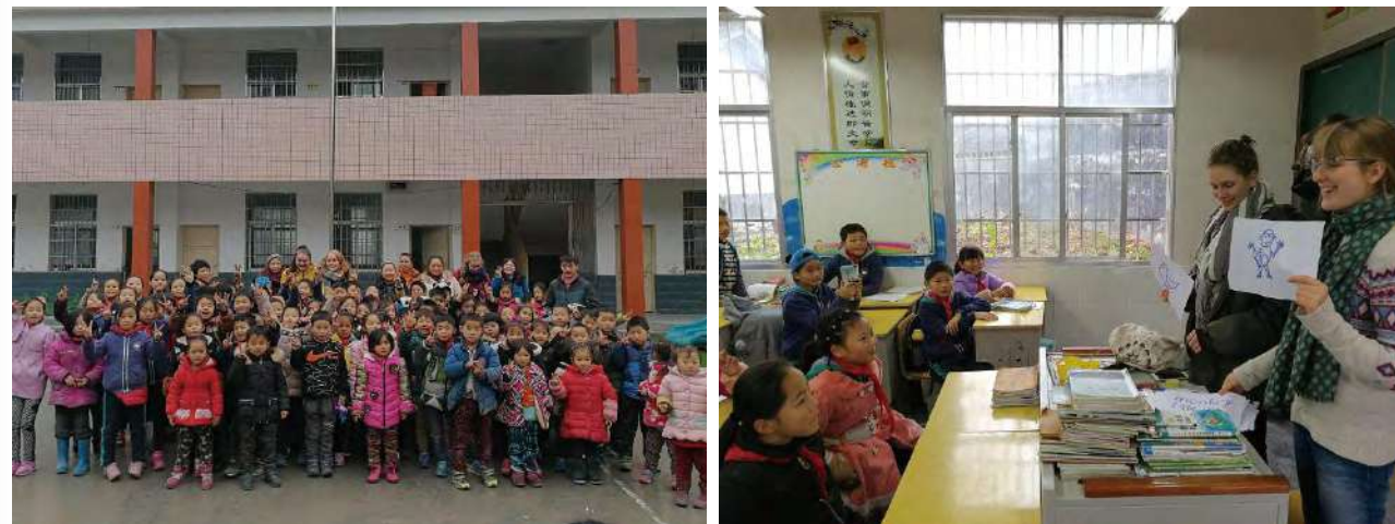
Volunteers teaching English at a village school supported by Amity.