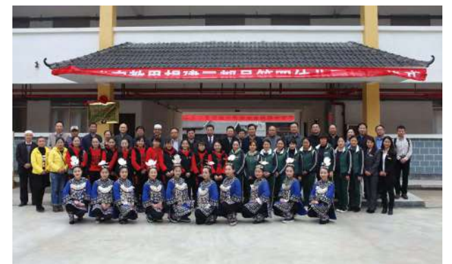
Opening ceremony of The Fourth Kindergarten of Sandu County

Apart from free medical care, team members also provided suggestions to improve local medical conditions. Doctors from the team found that the number of patients with high blood pressure was close to 10% of the total