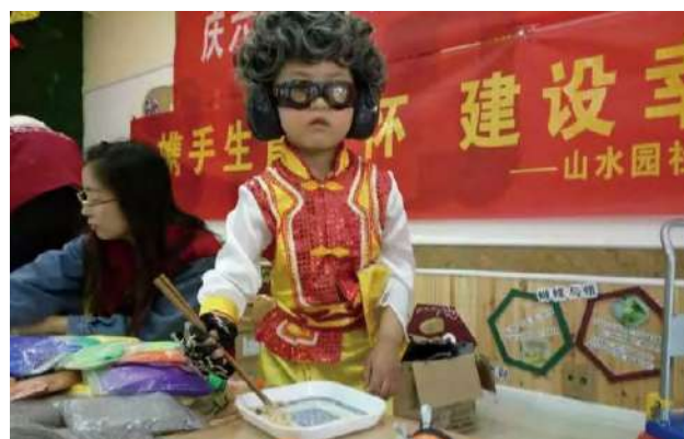
The "Days of Love - Experience the Life of Being Old" program by Amity Jolly Home Service Center