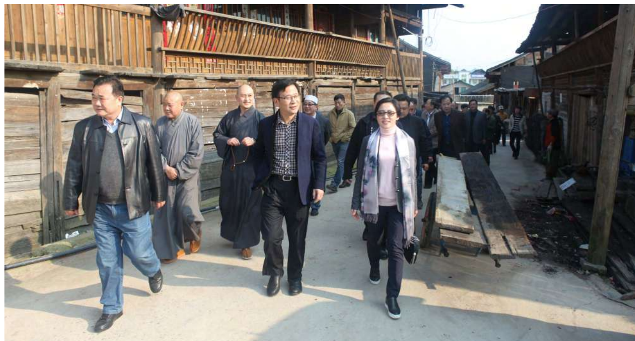
The delegation is visiting villages in Sandu County

From March 24 to 30, the Amity Mobile Medical Team, consisting of nine medical professionals, went to Sandu Shui Ethnic Autonomous County in Guizhou Province