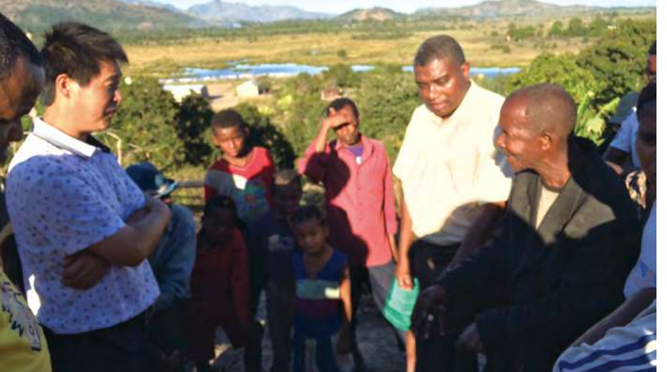
Madagascar bio-gas program