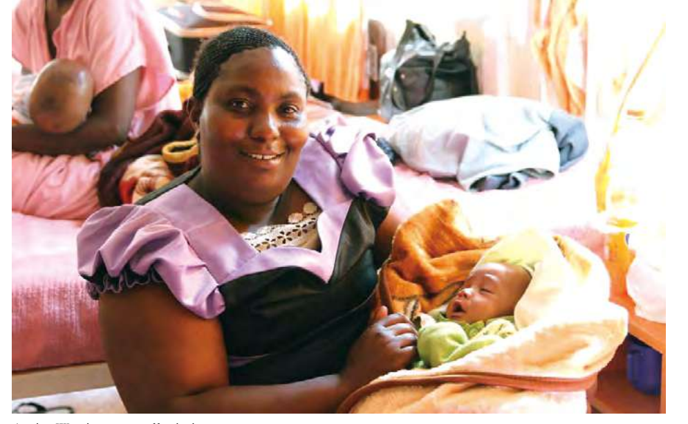
Amity-Watsi poverty alleviation program