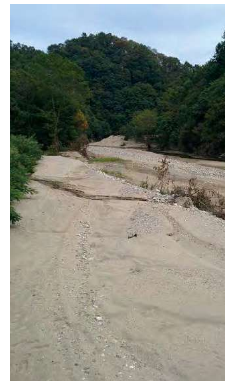
The flooding turned former rice fields into sandbanks, destroying the livelihood of many farmers