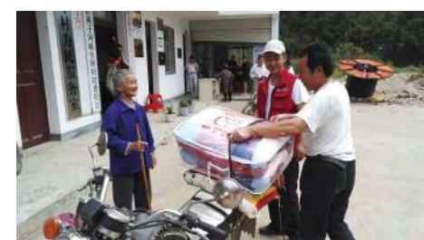
Local partners organizing the transport of the relief supplies of those who need help