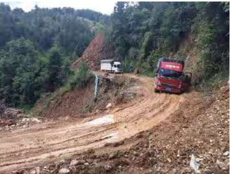
Trucks with supplies for the flood victims struggling with muddy and destroyed roads