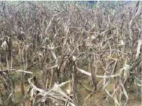
The floods caused huge economic damage. The future of many people affected by the floods is endangered