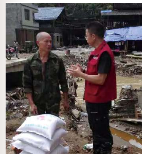
Amity staff is inspecting the situation and distributing rice