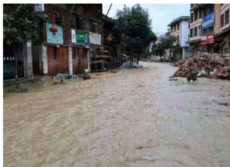
Ongoing heavy rainstorms are causing casualties and flooding