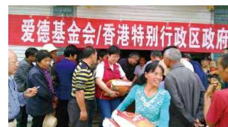
People in Anhui, who are affected by the flooding over the last months, are lining up to receive food supplies and blankets