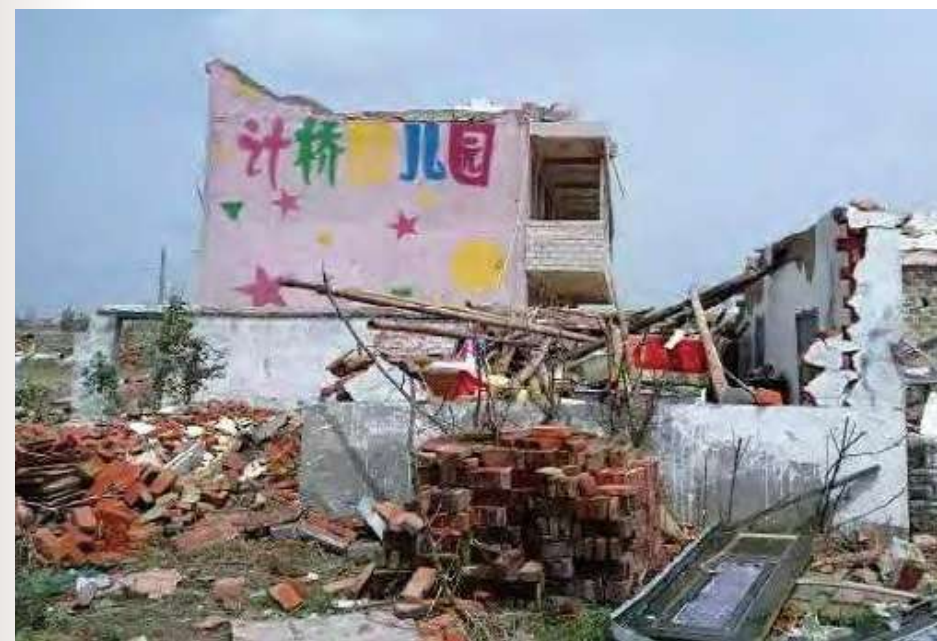
The tornado caused huge devastation