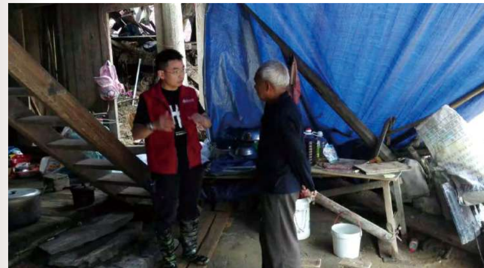
The Amity Foundation is on site to provide rice for the suffering people

This year's rainfalls have been particularly heavy. Since March floods, mud- and landslides caused casualties again and again. After this week's rainstorms the situation has exacerbated into states of emergency around the Yangtze River and many other basins. On June 23 the worst tornado in half a century killed 98 people and injured almost 800 more in Jiangsu Province.