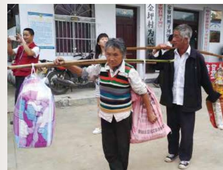
Villagers showing the supplies that help them to make ends meet over the next months