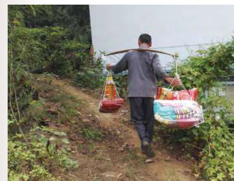
Villager is carrying received relief goods home