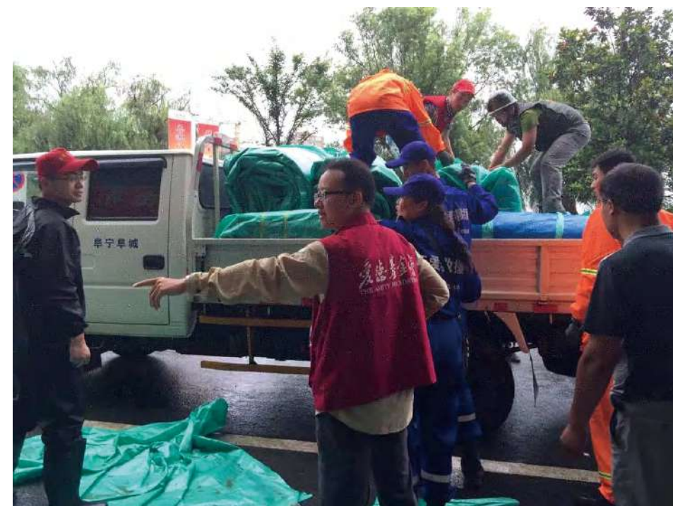
Amity staff check the delivery and coordination of relief supplies