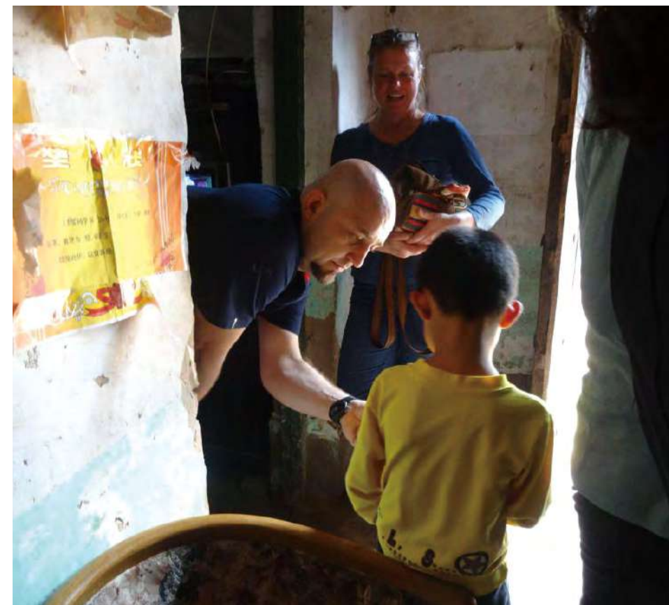
Participants and the students enjoy the visit

The delegation was welcomed by a student's family during the visit. Leading the delegation to his home, the boy introduced his family members: his mother, little brother and grandmother in the eighties. The mother proudly showed her kid's honorary school credentials, the grandmother warmly showed us around their house and his little brother was very happy to see his elder brother coming home early. The visitors felt relieved the student lives in such a harmonious atmosphere, although he is living in a poverty-stricken family.