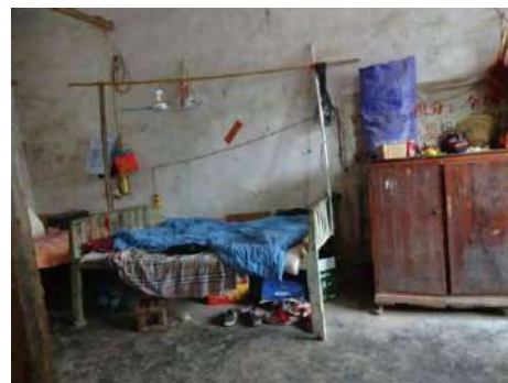
The sponsored students are living in poverty

Once a year in spring, a joint group of Amity staff, Pfrang members and local authorities visit underprivileged students of impoverished families that receive sponsorships. Afterwards, the Pfrang Gala is held in Nanjing to raise funds for new and continuing sponsorships.