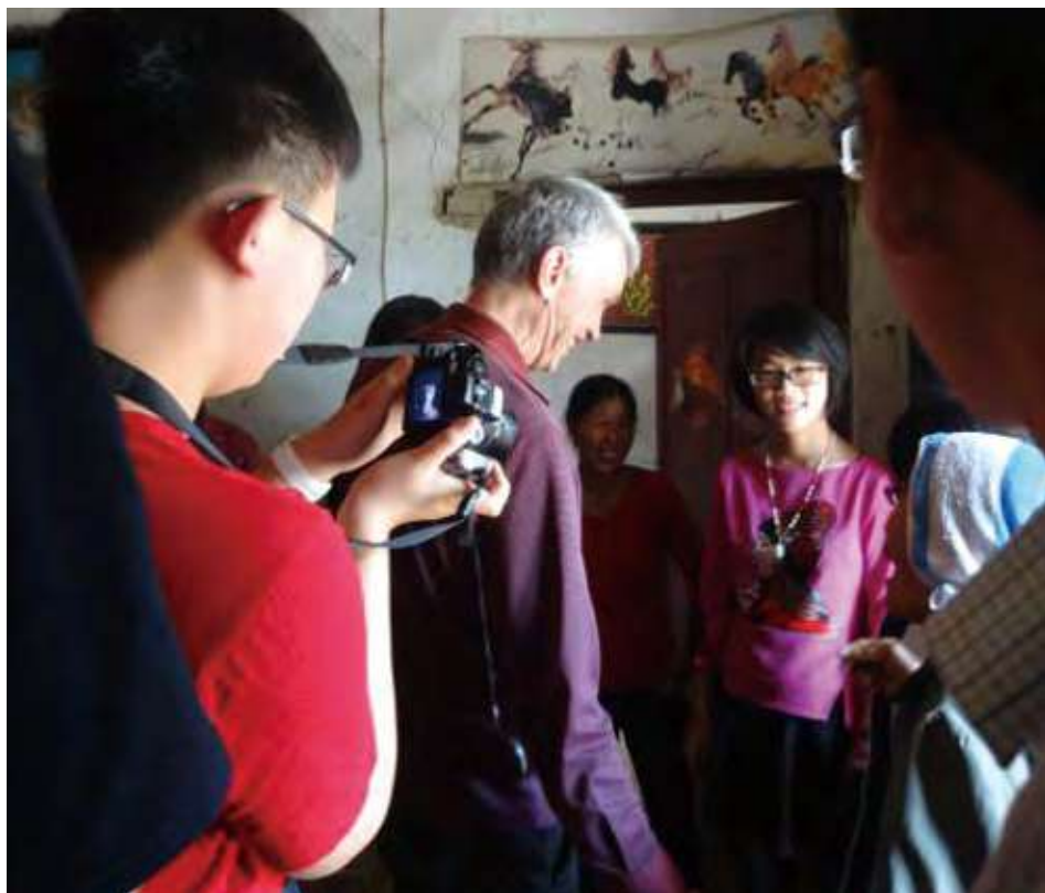
Participants from Nanjing learn about the living circumstances of the students

Face-to-face communication with the sponsored students and families is an important part during the visit. It offers an opportunity to talk with students and to learn more about their school life and dreams. Some wanted to become nurses to help people, software engineers to develop their own software products or lawyers to protect social justice.