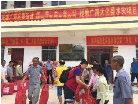
Amity staff and local partners are distributing relief supplies

On Saturday July 9, the Typhoon Nepartark made landfall in Fujian Province. Heavy rainfall and strong winds caused widespread flooding and landslides, leaving 6 people dead and 8 missing. The situation across various provinces remain severe.