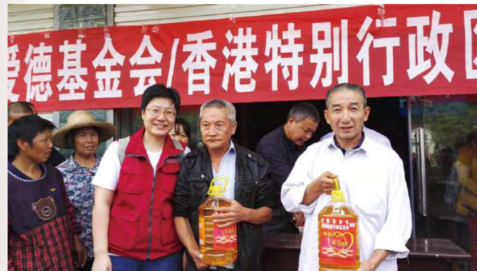
The banner states that the relief supplies are provided by the people of Hong Kong through the Amity Foundation