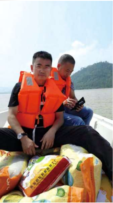
Latest pictures of Amity's flood relief project show Amity staff delivering bags of rice by boat to areas cut off by flooding

During the last week, the Amity Foundation continued to distribute relief goods to people affected by the floods. Thereby, Amity is supported by the Tencent and Alibaba Foundation that respectively donated 1,000,000 Yuan to Amity's 2016 China flood relief projects and launched donation appeals on their internet platforms.