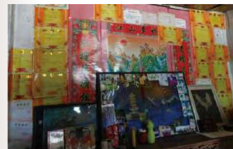
A wall full of honorary school credentials of a sponsored student

get recovered: "I still want to be a doctor to improve my father's situation and help more people." The determined expression of this little girl proved that the hardships of life had never defeated her, but made her more courageous and optimistic toward the future.