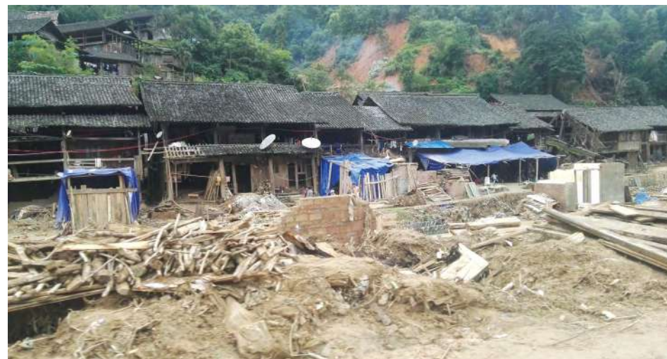
There is huge economic devastation and the loss of many people's existence