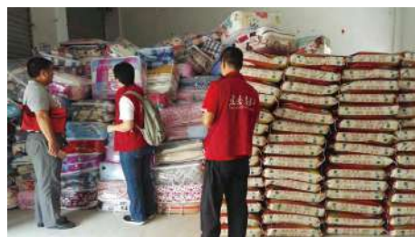
Amity staff is inspecting the disaster relief supply stocks and accounts

estimated 18 million acres of cropland. The economic damages are estimated to exceed 33 billion US Dollars. Only 2% of the economic losses are thought to be covered by insurance. The following pictures show Amity staff working on the front line, distributing relief goods and support the people in need in Anhui Province over the last weeks.