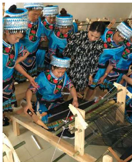
Tujia Ethnic Brocade weaving practice

This "Tujia Ethnic Brocade Craftsmanship Inheritors" training class was developed under the three-year "Suining and Yongshun community water resources management and development project in Hunan Province" launched in 2014. The total scale of the project was RMB12.37 million, of which financial support from Amity amounted to RMB 4.69 million and the rest amount was granted by the local government and contributed by residents living in the project area through funds and labor. An important part of the project was the development of the association and capacity building of villagers, on which a platform was established by this training class for practice.