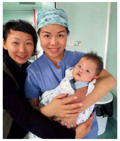
An Amity volunteer and a nurse holding a baby saved by Amity's Hopeful Heart Project for babies with congenital heart disease

Here I would like to propose that we look at the role of religions in development so that interfaith dialogue and cooperation is incorporated in our conversations;