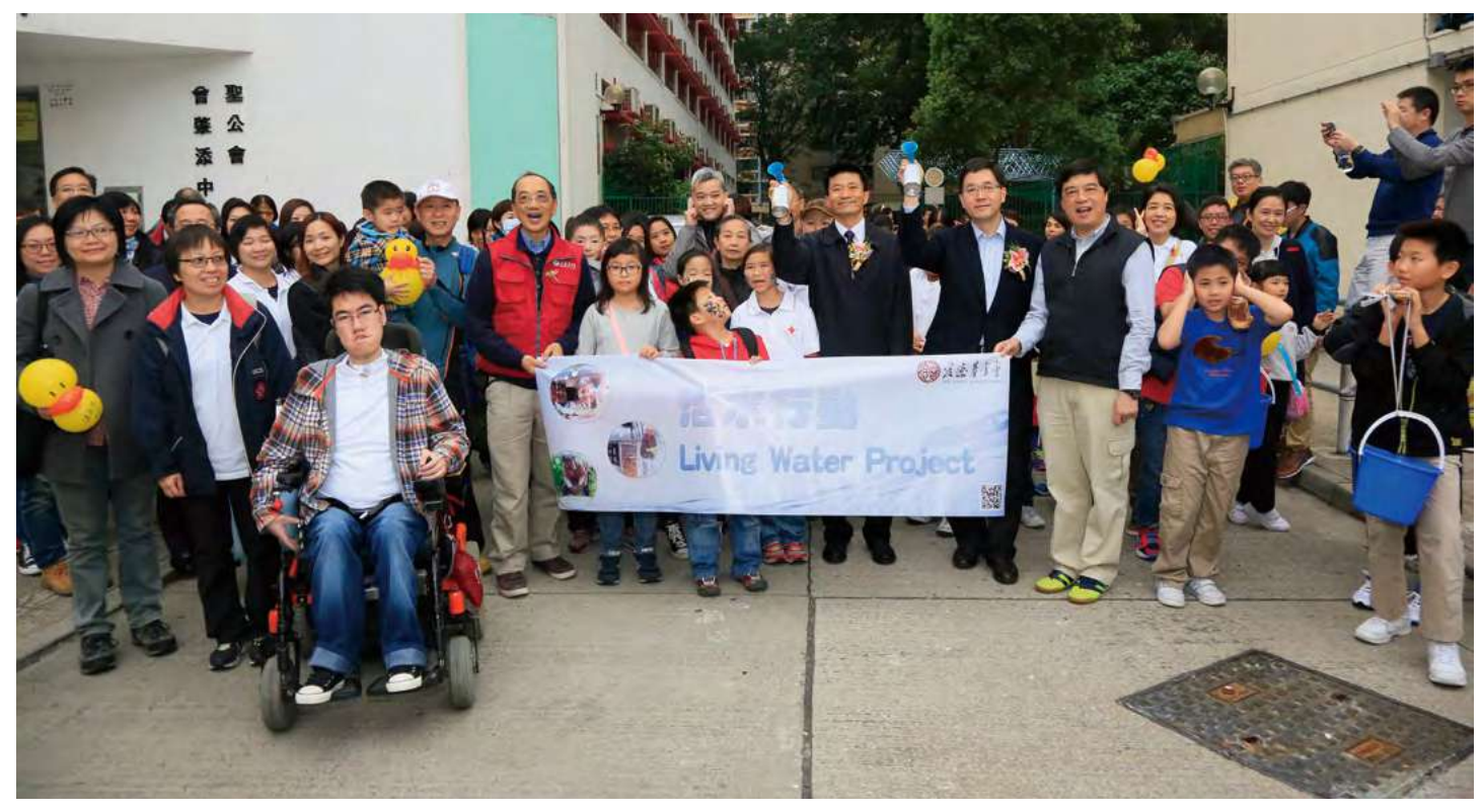
Political and church representatives and organisations attending the event

they were carrying around the river in order to make it back with at least some still in the bucket! The load may not have seemed so great to begin with, but the strain of the weight was evident 40 minutes into the Walk. The second impression was of the tireless efforts of the army of volunteers who spent the whole day on site and were still smiling by the end of it! Amongst the most passionate of volunteers were the staff of the Hong Kong Red Cross Hospital Schools, who have supported the Walks for Living Water since they began in 2011. Besides building teams of walkers who are so successful