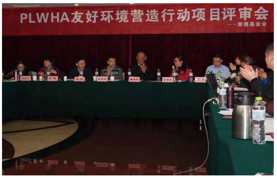
Experts commenting on the projects