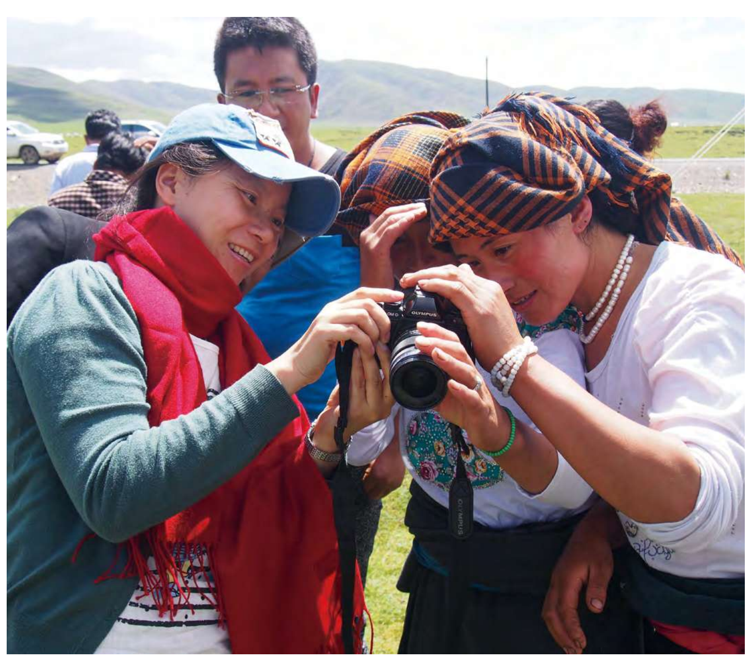
Tibetan residents in Qinhai Province and Amity staffers working on integrated rural development projects there