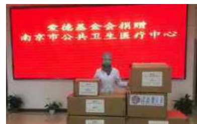
Supplies for local medical institutions in Nanjing