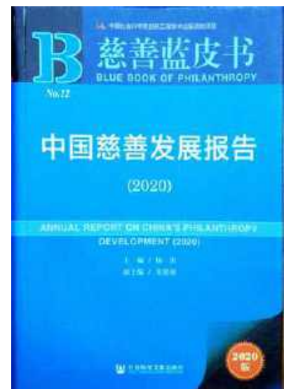
Amity completed "2019 China Religion-based Philanthropy Development Report" for Annual Report on China's Philanthropy

In terms of religion-based philanthropy research, Amity completed the "2019 China Religion-based Philanthropy Development Report" and, by sorting out the history of Christian philanthropy, compiled the "Development Process of Chinese Christian Philanthropy from the Perspective of the Sinicization of Christianity" and provided trainings on this topic in the trainings of local church preachers.