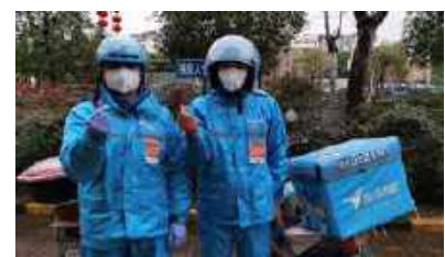
Delivery boys delivering meals of "Guarding Angel" to medical workers