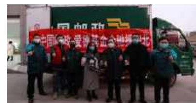
The 5 th Jiangsu medical team leaving for Hubei are receiving face shield and respirators provided by Amity in Nanjing