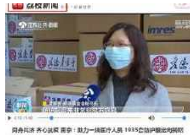
Media interview of the General Secretary about Amity's donation of coveralls

During the epidemic, Amity regularly published Amity's anti-COVID-19 work through WeChat and other platforms, facilitating donors and the public to participate and monitor in real time. Amity's joint operation was widely reported by 12 mainstream media including Xinhua News Agency, China Daily, CPPCC Daily, and China Society News, delivering the voice of Amity in a powerful way. Amity was also awarded the "Firefly Award" for anti-COVID-19 work by Baidu.com.