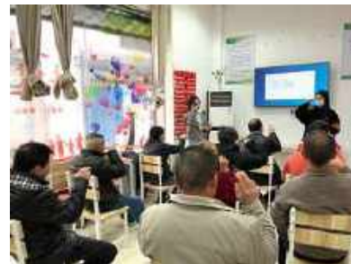
Volunteers are teaching sign language to students in Amity Home of Blessings

Amity serves 82 children aged 0-14 with autism or learning and developmental disabilities. During the epidemic, Amity implemented online teaching with 368 teaching and 2,297 instruction videos being held. The produced videos minimized the impact of the epidemic on the rehabilitation process. At the end of 2020, the new site of Amity Child Development Center was launched.