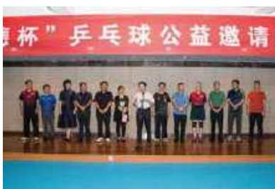
Opening ceremony of 2020 "Amity Cup" Table Tennis Game