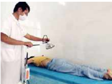
A village doctor is treating a villager with therapeutic equipment provided by Amity in Chengbu County of Hunan Province