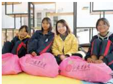
"Spring Willow" program provides village girls with health packs

In terms of sector support, Rende completed an evaluation report for the Little Seedlings Project which provided meals for children in mountainous areas. Rende was also commissioned by the Disaster Relief Coordination Committee to compile the "Case Study Book on Fight against COVID-19 by Social Organizations". Furthermore, Rende held 12 charity salons by live streaming to advocate philanthropy, and the total number of viewers exceeded 12,000.