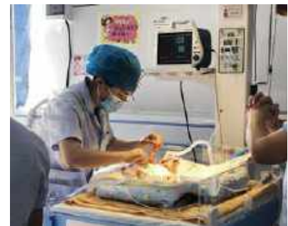
In Mangshi of Yunnan Province, a doctor is diagnosing babies with medical device supported by Amity "Sprouts on Earth" program.

To share a healthy life and to build a healthy China