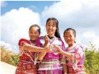
"Spring for Miao Girls" project supports Miao ethnic minority girls for better education

Amity provided 32,724 sets of "Desks in the Mountainous Areas" for 109 rural schools and 2,000 "Photovoltaic Power Stations in Schoolbags" for students in plateau regions. Amity supported 76 rural schools to build multifunctional rooms, benefiting 36,000 teachers and students and helped 1,709 "Future Engineers" to access continuous vocational education. In addition, as of 2020, a total of 458 female college students in Guizhou received funding for higher education, of which 102 girls were new joiners of the program in 2020.