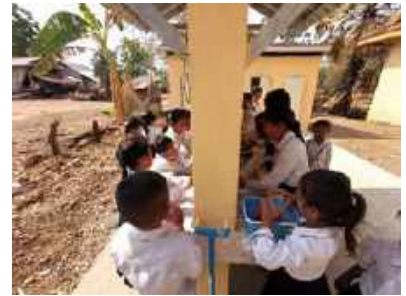
Washing facilities built by Amity at Siem Village Primary School in Battambang province, Cambodia

Amity organized and participated in the "More inclusive coordination from the global South" online meeting of the 2020 Humanitarian Networks and Partnership Week (2020HNPW); invited to participate in the "How NGOs Adjust Humanitarian Relief Work under the New Normal of the Epidemic" online forum.