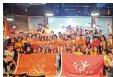
| Charity concert