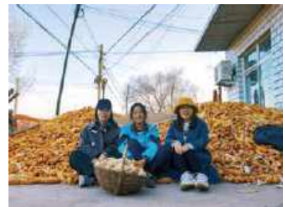
Amity Orphan Fostering Program providing not only financial support, but also psychological support and guide for the kids.