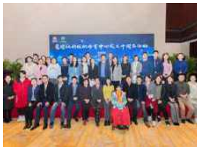
The 10th anniversary of Amity NGO Development Center

Amity NGO development work covers Nanjing, Nantong, Wuxi and Kunshan with construction and operation of the social organization hub platforms: Nanjing Qixia District Center and Jiangbei District Center managed RMB 13.2 million government charity resources and monitored, managed and evaluated 178 district-level charity projects. Nantong Center successfully registered as a city-level NGO development Center and assisted the government in planning over 300 venture philanthropy projects. Wuxi Center cooperated with Huishan Civil Affairs Bureau, Disabled Persons' Federation and Yixing Civil Affairs Bureau to manage nearly 100 projects. Kunshan Center implemented 29 projects throughout the year, directly serving more than 50,000 people, managing nearly RMB 12 million government resources, and operating 4 district and town-level charity workshops by which Amity guided over 60 social organizations on the planning of over 100 projects, and provided more than 300 capacity building trainings.