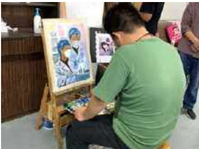
Students with hearing impairment at Amity project school in Bozhou of Anhui Province is painting the story of medical workers during the pandemic

Amity cooperated with over 30 public welfare care centers and special education schools across the country to carry out over 60 projects for the challenged. Under the support of Amity, 219 children stayed with foster families, and some of them were further provided with meals. 27 "Amity Grandmothers" participated in Amity's service for the special children and more than 100 special young people received school learning or vocational training opportunities under Amity programs. Moreover, Amity cooperated with seven special education schools to carry out inclusive education for children with hearing and visual difficulties, as well as provided trainings for teachers of preschool inclusive education and seminars for deaf-related preschool inclusive education. Furthermore, Amity initiated in Jiangxi a cooperative program to construct "Growth Centers for Students with Special Needs" to include students with different difficulties, carried out sign language classes and social inclusive activities among universities and communities in Jiangsu; opened the "Culture Studio for the Hearing Impaired" in Anhui; and cooperated with special education schools in Guizhou and Sichuan to carry out "Vocational Training for Youth with Disabilities".