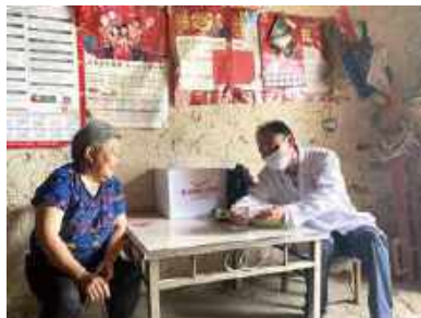
An elderly lady receiving medicine packs distributed by Amity to rural families