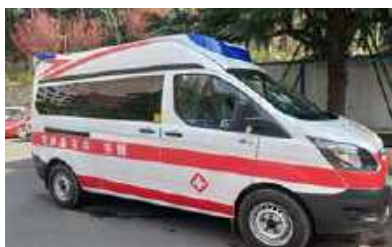
Negative pressure ambulance donated by Amity