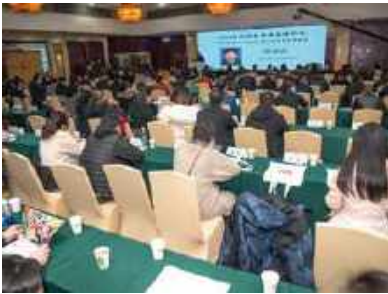
2020 Shannxi Elderly Care Summit