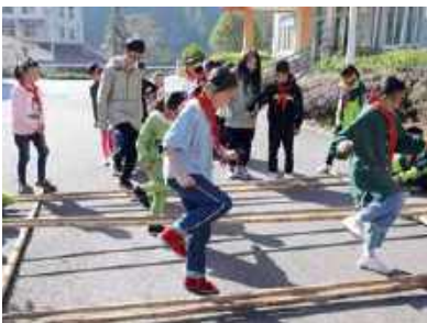
In "Amity Yixin Huatai" project, volunteers visit Amity project sites in Enshi of Hubei Province.