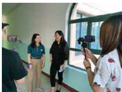
Live streaming for "Talk about Virtue" Charity Interview