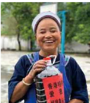
Amity providing drinking water, cooking oil and daily necessities for affected people during the floods in Southern China