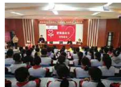
Activity of Amity Rose Charity Fund