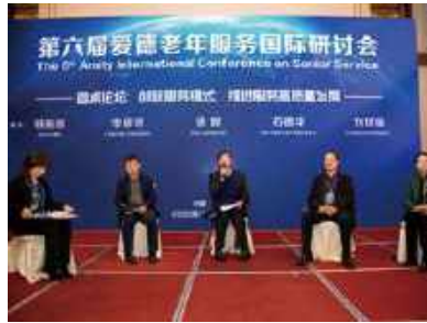
The 6th Amity International Conference on Senior Service