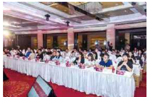
Amity shared "Sprouts on Earth" Maternal and Child Health Care Project on the kickoff meeting of Care for Women's Safety Alliance