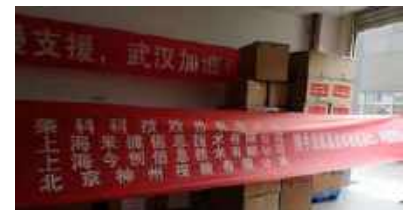
Amity together with companies are donating powered air-purifying respirators to front line medical staff

the combat together with their own advantages. In response, Suning Logistics, China Post, Manbang Group, Allianz Group, and China Merchants Foundation provided logistics and transportation support; and Nanjing COSCO SHIPPING Logistics Co., Ltd., Hongkong Customs Broker Co., Ltd., and Jiangsu Zhongcheng International Logistics Co., Ltd. provided free customs clearance and consulting services. At the same time, Amity cooperated with local social organizations and volunteer groups to carry out packaging, transshipment, and distribution work locally. The all-round coordination achieved timely delivery of supplies.