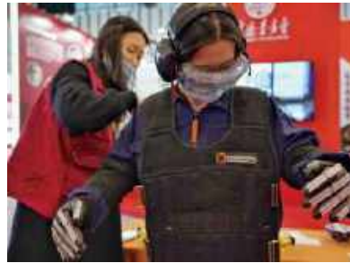
A visitor is experiencing the feeling of "turning old" at the Amity booth during the 2nd Jiangsu Charity Forum

Amity NGO development work covers Nanjing, Nantong, Wuxi and Kunshan with construction and operation of the social organization hub platforms: Nanjing Qixia District Center and Jiangbei District Center managed RMB 13.2 million government charity resources and monitored, managed and evaluated 178 district-level charity projects. Nantong Center successfully registered as a city-level NGO development Center and assisted the government in planning over 300 venture philanthropy projects. Wuxi Center cooperated with Huishan Civil Affairs Bureau, Disabled Persons' Federation and Yixing Civil Affairs Bureau to manage nearly 100 projects. Kunshan Center implemented 29 projects throughout the year, directly serving more than 50,000 people, managing nearly RMB 12 million government resources, and operating 4 district and town-level charity workshops by which Amity guided over 60 social organizations on the planning of over 100 projects, and provided more than 300 capacity building trainings.