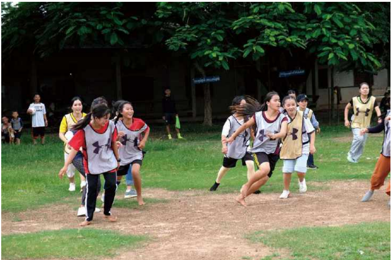
Football game at an Amity project school in Laos