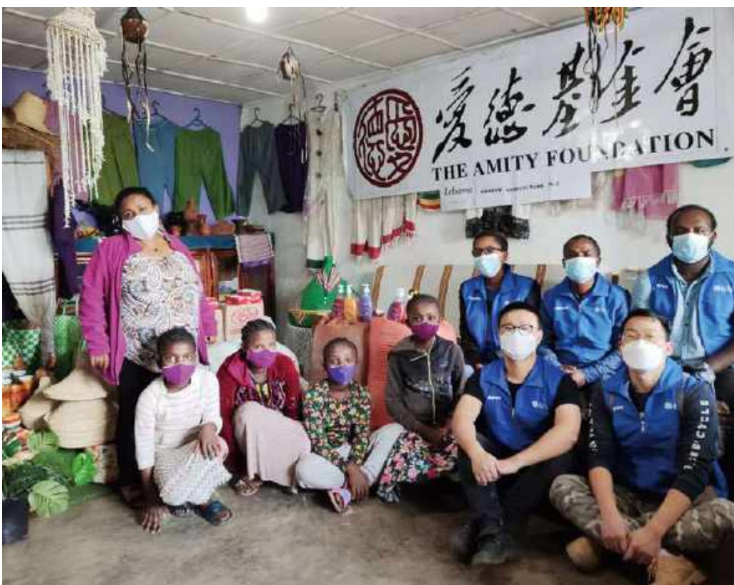
| Amity Food Aid in Ethiopia

The "Love Dream Food Aid" project distributed the flour, teff, soap, hand sanitizer and other supplies to more than 200 Ethiopian children and adolescents during the pandemic to help them maintain basic living and personal protection.