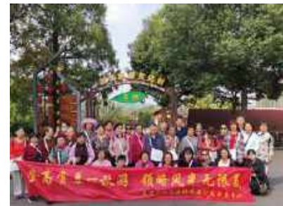
Amity organizes a one-day trip for the university for the elderly

Amity carried out a number of exchange activities including the Shaanxi Elderly Home Dean Training, Amity Elderly Home Dean Training, the Sixth Amity International Elderly Service Seminar, and Shaanxi Health and Elderly Summit, to actively improve the professional level of elderly service practitioners, facilitate the development of elderly care services.