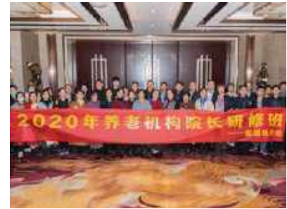
Amity Elderly Home Dean Training

Amity provides nursing, care and supported employment services to 62 people with disabilities in Nanjing. Through Tencent, Gulou District Venture Philanthropy, company donations and other channels, RMB 224,551.34 was raised for service for people with disabilities. In addition, five college volunteer teams were aligned and devoted to the service.