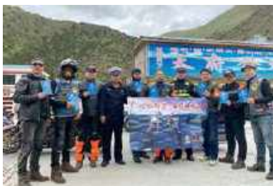
"Hope for the Heart" project supports kids with congenital heart disease in Tibet to have surgeries in Nanjing