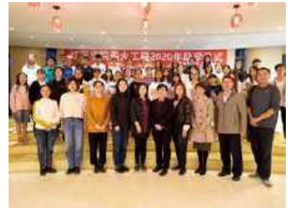
The "Torch Project" helps college students complete their studies and educate them to serve the society. A total of 727 students benefited from the project in 2020.