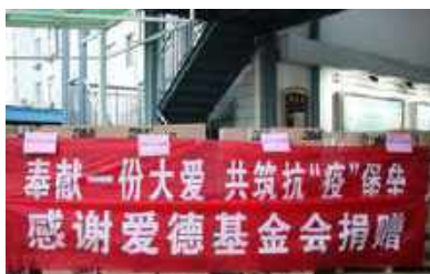
Masks donated by Chinese Nigerian