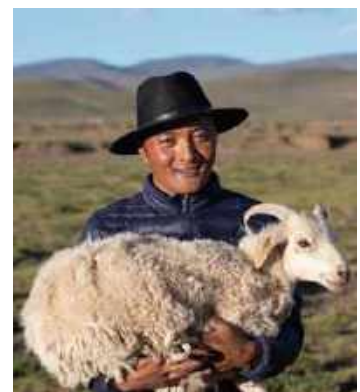
By building warm shed for herds, Amity helping villagers in Yushu of Qinghai to increase income