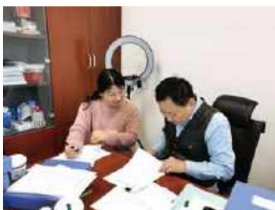
Shanghai Amity Philanthropy Research Center is participating in the consultation of 2020 level evaluation for social organizations