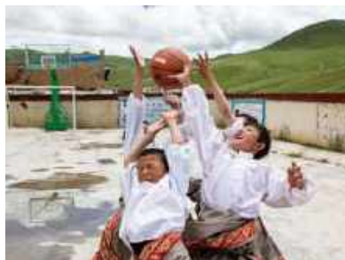
"Dreamed Sports Pack" equips 35 rural schools with sports equipment and facilities.