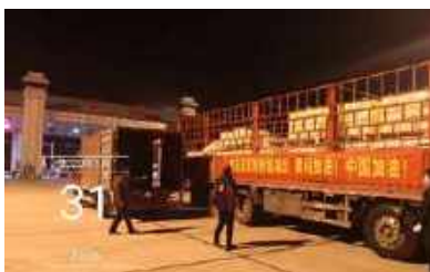
Amity's supplies delivered to Huanggang, Hubei