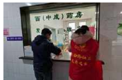
Amity elderly care staff buying medicine for elderly living alone during the outbreak