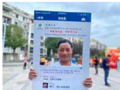
Kunshan Amity NGO Development Center initiates "Elevator Rescue" activity to enhance safety awareness and emergency capacity for the elderly