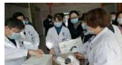
Logistic companies joining Amity's efforts by providing transportation for medical supplies