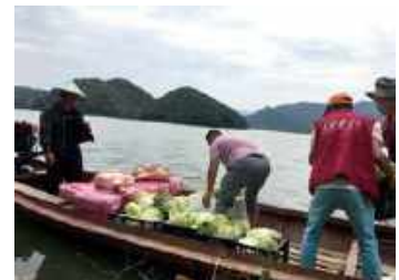
During flood season, based on local needs, Amity for the first time providing fresh food for over 500 villagers in Poyang County, Jiangxi Province

To explore the value of rural culture, to cultivate the power of rural communities and to achieve independent development of rural areas. In humanitarian spirit, to carry out disaster management work by focusing on enhancing the resilience of the affected communities.