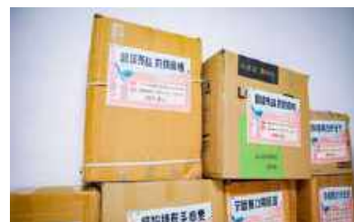
Special action to protect female medical workers