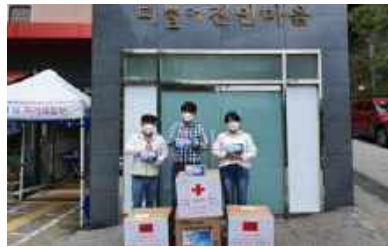
Amity supplies reaching South Korea