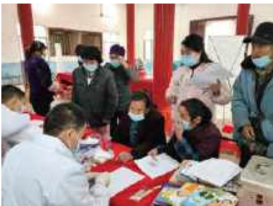
Free medical treatment under "Shaping Rural Medical Care" Project in Changning of Hunan Province