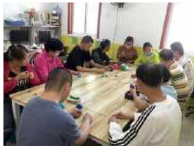
Students in Amity Home of Blessings are making handcraft

Amity provides nursing, care and supported employment services to 62 people with disabilities in Nanjing. Through Tencent, Gulou District Venture Philanthropy, company donations and other channels, RMB 224,551.34 was raised for service for people with disabilities. In addition, five college volunteer teams were aligned and devoted to the service.