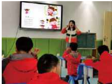
Special education classes