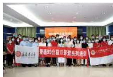
| Tencent "99 Giving Day" fundraising training