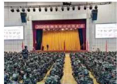
Amity trainings on AIDS prevention among young people in universities