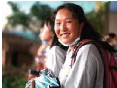
"Hatching Operation" provides scholarship for kids with financial difficulties in western China