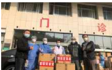
On Feb 23, Wuhan Jinyintan Hospital receiving 50 powered air-purifying respirators from Amity

With the strong support from all walks of life at home and abroad, Amity delivered ambulances, monitors, protective suits, masks and other medical supplies, as well as food, daily necessities and other materials to over 200 hospitals, over 200 public health institutions and community medical centers, 450 communities, rural grassroots organizations and front-line service institutions in Hubei, Jiangsu, Guangdong, Yunnan and other provinces, and provided assistance for 12 medical teams in Hubei.