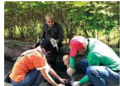
Amity is providing service to repair or install artificial limb