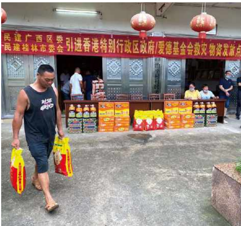
Relief distribution to people suffered from the floods by Amity with funds applied from the Disaster Relief Fund Committee of the Hong Kong SAR

In addition to our loyal fans, AFHK continued to attract new donors in Hong Kong, in an effort to support Orphan Fostering Program, Breakthrough Project, University for Girls Project and other projects on education and orphans.