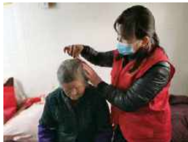
Staff of Amity elderly care service is visiting an elderly and taking care of her