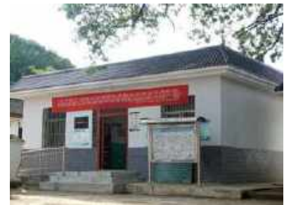
Clinic built by Amity in Zhongji Village of Gansu Province