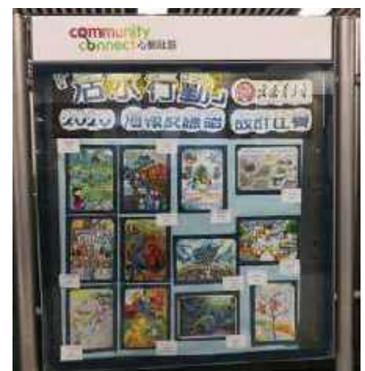
Winners of Poster Competition under Amity's Water advocacy campaign in Hong Kong getting much publicity