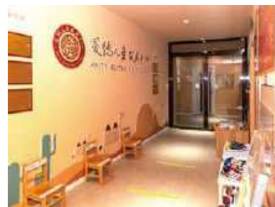
New site of Amity Child Development Center