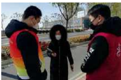
Staff of Amity Kunshan NGO Development Center working as a volunteer in the community during the outbreak