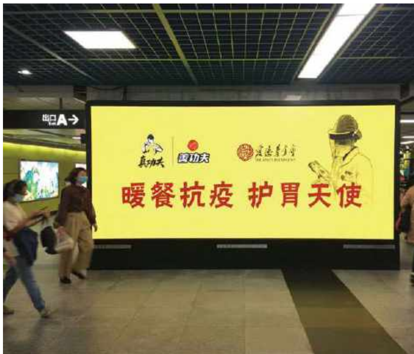
Advertisement of Amity Anti-COVID-19 project in Guangzhou Subway

Throughout the year, Amity provided professional trainings to 1,039 organizations, benefiting 1,799 participants. Amity, together with Lingxi platform, initiated six online monthly donation training courses for 2 weeks to help social organizations build a monthly donation system.