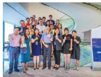
Sub-forum themed "Social Force Participation in Urban Construction" under "Shangshan Forum"