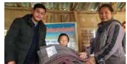
Families in Nepal receiving blankets to fight against the exceptional cold