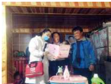
In Rangtang, Sichuan, a village doctor enters the house to distribute maternity family gift packages and conduct health promotion for the beneficiary families of the "Earth Sprout" project