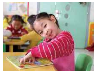
"New Year's Gift for Kids in Difficult Circumstances" project is sending gifts to the kids