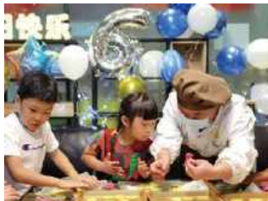
Amity Bakery trainees are teaching kids