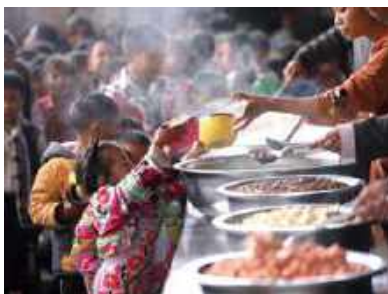
Meals for children in mountainous areas under "'Little Seedlings' project