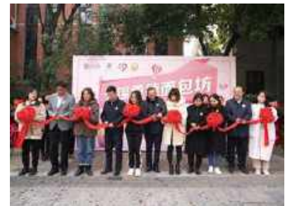
On Dec 3, Amity Bakery opened its new outlet in Kunshan

Amity cooperated with over 30 public welfare care centers and special education schools across the country to carry out over 60 projects for the challenged. Under the support of Amity, 219 children stayed with foster families, and some of them were further provided with meals. 27 "Amity Grandmothers" participated in Amity's service for the special children and more than 100 special young people received school learning or vocational training opportunities under Amity programs. Moreover, Amity cooperated with seven special education schools to carry out inclusive education for children with hearing and visual difficulties, as well as provided trainings for teachers of preschool inclusive education and seminars for deaf-related preschool inclusive education. Furthermore, Amity initiated in Jiangxi a cooperative program to construct "Growth Centers for Students with Special Needs" to include students with different difficulties, carried out sign language classes and social inclusive activities among universities and communities in Jiangsu; opened the "Culture Studio for the Hearing Impaired" in Anhui; and cooperated with special education schools in Guizhou and Sichuan to carry out "Vocational Training for Youth with Disabilities".