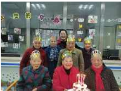
Staff of Amity day care service is holding birthday party for the elderly

Amity continues to improve the quality of elderly care services with an aim for excellent governance, service, and brand. For institution-based elderly care service, 256 elderly people are supported. For home-based elderly care service, our service covers 22 communities of eight streets in Qixia, Gulou and Yuhua districts. With the guidance of "14 assistance + personalized" services, we have 5,465 elderly members, of which 3,708 received visiting service. Amity's "Caring E-Home" APP has been upgraded to improve practical functions such as movement monitoring, health indicator monitoring, order placement, and online payment. The Qixia Home for the Elderly operated by Amity won the title of "Entity of the Year - Respect for the Elderly" in 2020.