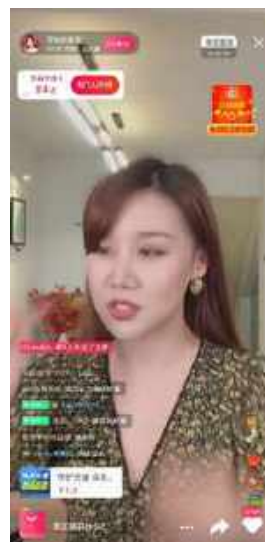
Taobao celebrities supporting Amity "Guarding Angel" project during live streaming