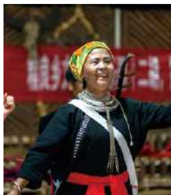
Wa ethnic minority group in Yunnan Province attending dancing courses supported by Amity