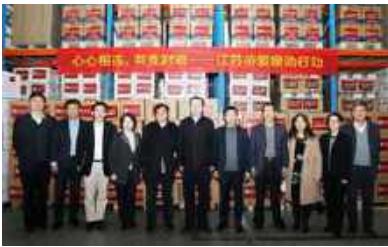
Amity's supplies for overseas countries and regions

shields, protective suits, ventilators and other supplies to countries and regions including Russia, Italy, Japan, South Korea, Myanmar, Indonesia, the Philippines, Malaysia, the Netherlands, Argentina, Angola, Belgium, Spain, Sweden, Hong Kong and Macao.