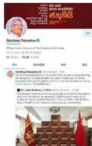
Gotabaya Rajapaksa, Sri Lanka President, expressing his gratitude to Amity for 33,600 surgery masks sent by Amity on social media

Amidst the pandemic that spread across the world, China, under the strong leadership of the government and through the joint efforts of all sectors of society, effectively got the virus under control in March 2020. However, situations in other countries became increasingly severe. From March 2020, in the spirit of humanitarianism, Amity started supporting countries in need (especially those with limited medical resources and inadequate sanitation). Amity also actively participated in the "Heart-to-Heart, Together Overcoming Hardships - Jiangsu Overseas Chinese Aid Action" programs to deliver masks, face