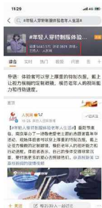
"Story of Time - Amity Volunteers Carnival" is reported by mainstream media and discussed as a hot topic on social media

Nearly 400 companies made donation to Amity, of which 15 companies donated an amount of over RMB 500,000. Over the year, Amity held 57 charity activities such as the "Story of Time - Amity Volunteers Carnival", "Amity Cup" Table Tennis Game, "Warm Winter Action", "Love Crossing 2000 Kilometers", and "My Kindergarten and I". With effective integration among Amity project teams, Amity Bakery, Amity Home of Blessings and other entities, Amity planned and organized a series of charity activities such as "Comfortable Summer" to enhance the participation of companies and the public in charity.