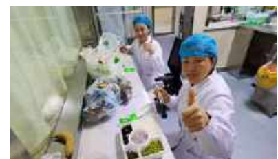
Medical workers having "Guarding Angel" meals