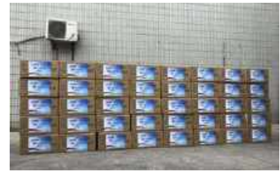
Amity's supplies for Angola