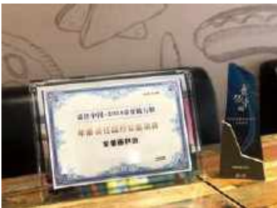
Amity Bakery - Responsible Charity Project of the Year

Throughout the year, Amity provides employment, internship and training opportunities for 48 people with mental disabilities in Nanjing, Kunshan and Wuxi. Amity Bakery has upgraded its online sales channels, exploring group purchase in more than 10 local communities in Nanjing. Due to Amity's continuous promotion of the social inclusion of people with mental disabilities, Amity Bakery was selected as Responsible Charity Project of the Year by ThePaper.cn, and once again won the title of "Charity Lighthouse Award" issued by Youzan Online Store. In 2020, Amity Bakery (Wuxi) and the second chain store in Kunshan opened.